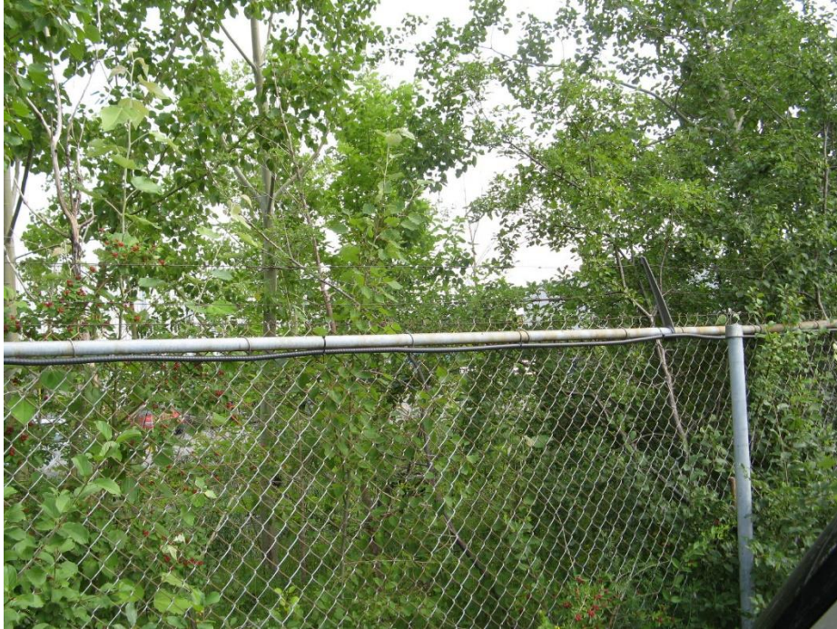
Photo 4 – The Municipal Drain corridor is protected with a chain-link fence along the north property line. This area has fewer trees and plantings are recommended to increase the diversity of the buffer function. View looking north