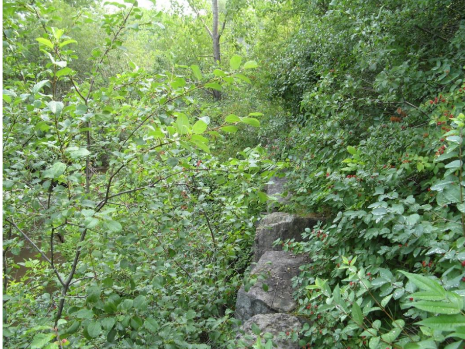
Photo 2 – South side of the Municipal Drain corridor to the north of the site, with large boulder retaining wall. View looking east, with site beginning 7.5 metres from wall