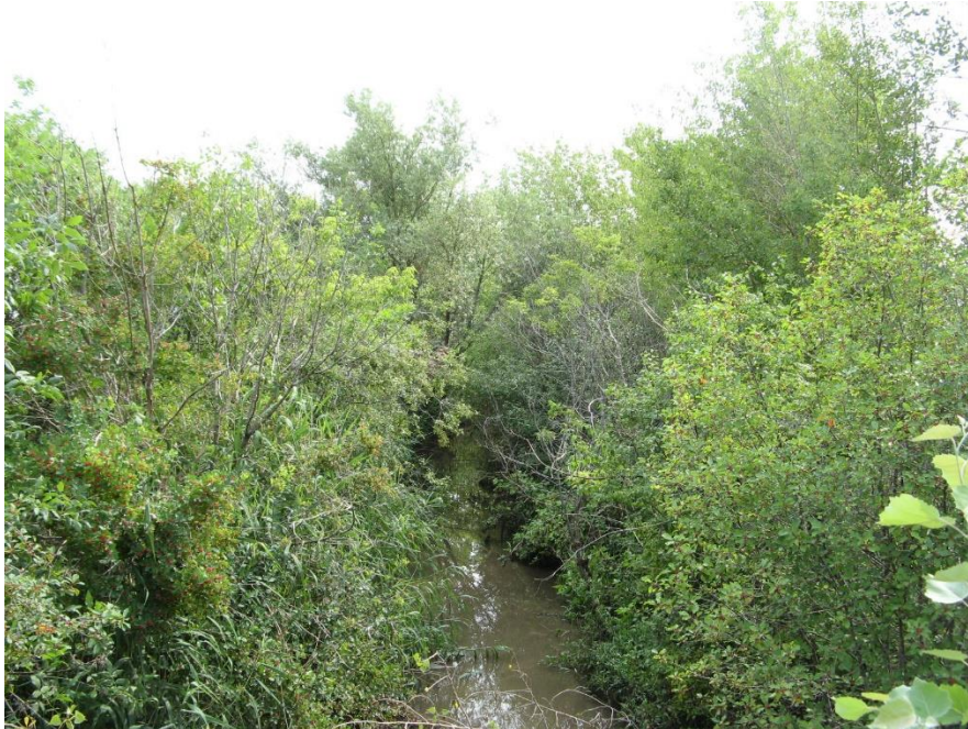
Photo 1 - South Cyrville Municipal Drain immediately to the north of the site. View looking east from the northwest entrance to the site

Wildlife observed during the July 11 th survey included American crow, ring-billed gull, grey catbird, house sparrow, European starling, American robin, northern cardinal, and American goldfinch. No stick nests or other evidence of raptor utilization or trees with suitable wildlife cavities were observed.