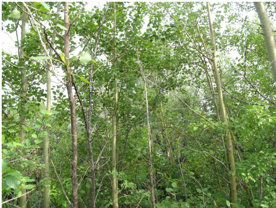
Photo 3 – The corridor between the Municipal Drain and the site is generally well treed with young poplars. View looking north from the centre of the north property line