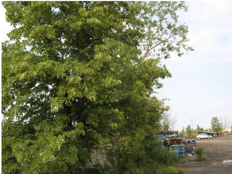
Photo 7 – Cottonwood along southeast boundary of the site. View looking west