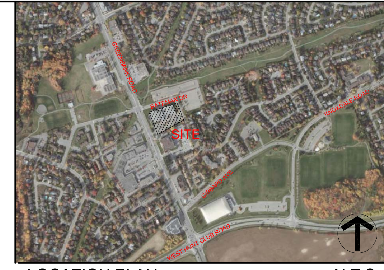
LOCATION PLAN N.T.S.

TREE CANOPY COVER DATA (PROJECTION ASSUMED AT 40 YR. MATURITY) LARGE DECIDUOUS TREES: 10m Dia. Spread 78m 2 per x 6 = 468m 2 CONIFEROUS TREES: 4.5m Dia. Spread 16m 2 per x 3 = 48m 2 TOTAL TREE CANOPY COVER: 516m 2 DEVELOPMENT SITE AREA minus BLDG. FOOTPRINT: 1597m 2 % TREE CANOPY COVER: 32.3