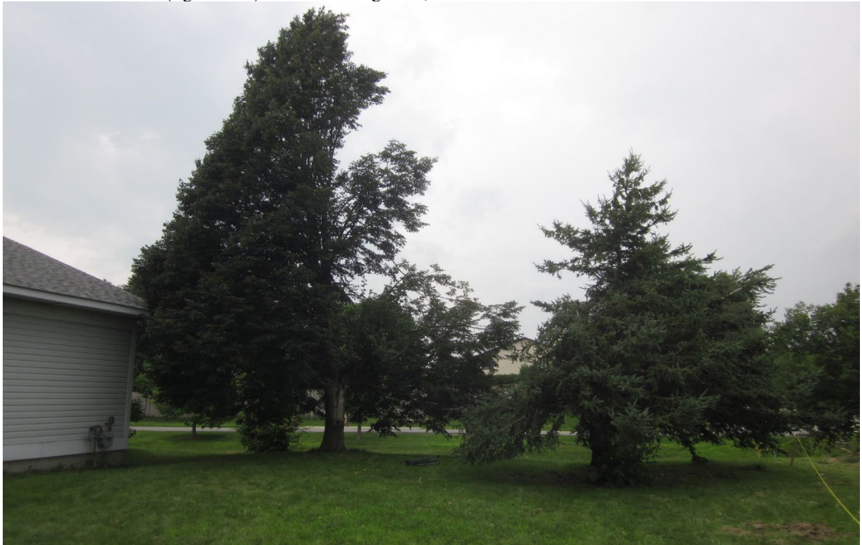
Picture 2. Trees #6 and 7 (left to right), little-leaf linden and white spruce trees at 4000 Strandherd Drive