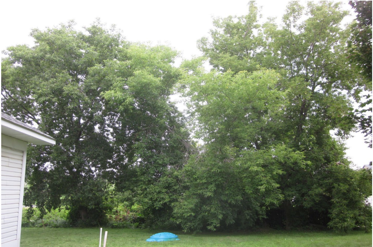
Picture 3. Tree #8, 9 and 10 (left to right), Manitoba maples shared with 4000 Strandherd Drive