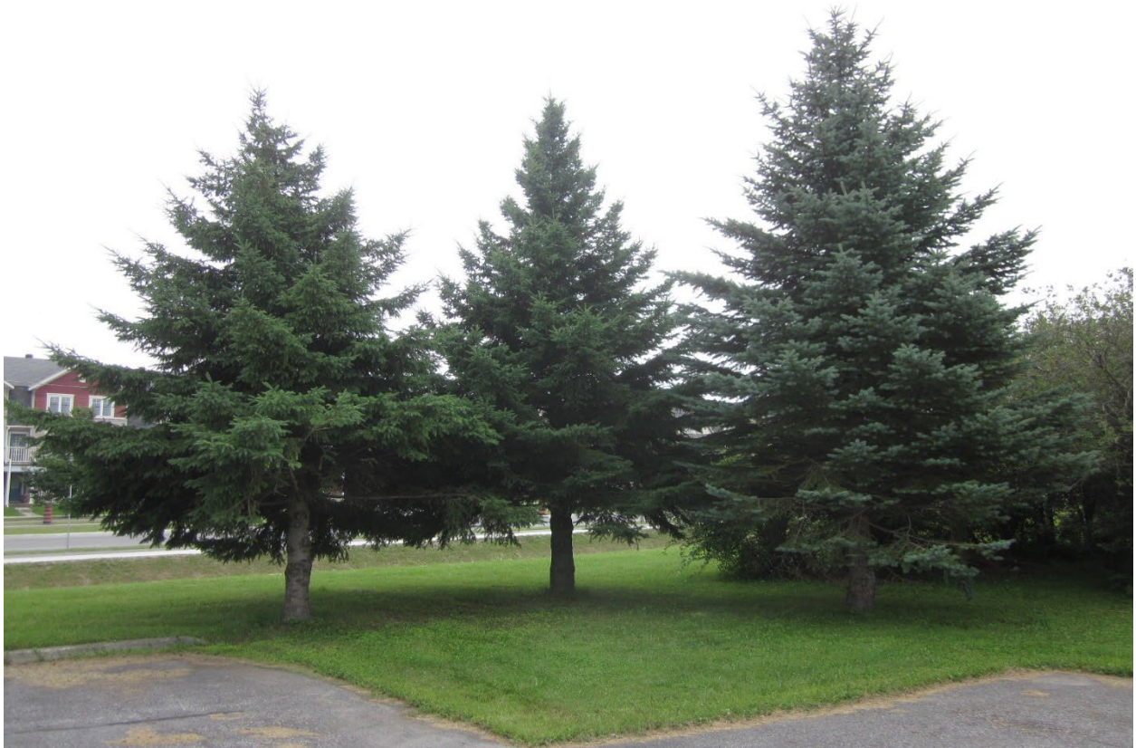
Picture 5. Trees #13, 14 and 15, white and Colorado spruce trees at 4000 Strandherd Drive