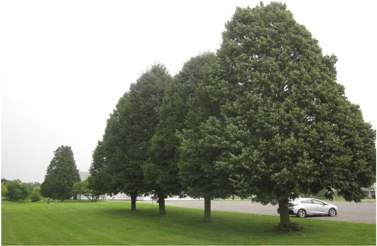
Picture 1. Trees #1-4 (right to left) and #5 in background, little-leaf linden trees at 4000 Strandherd Drive