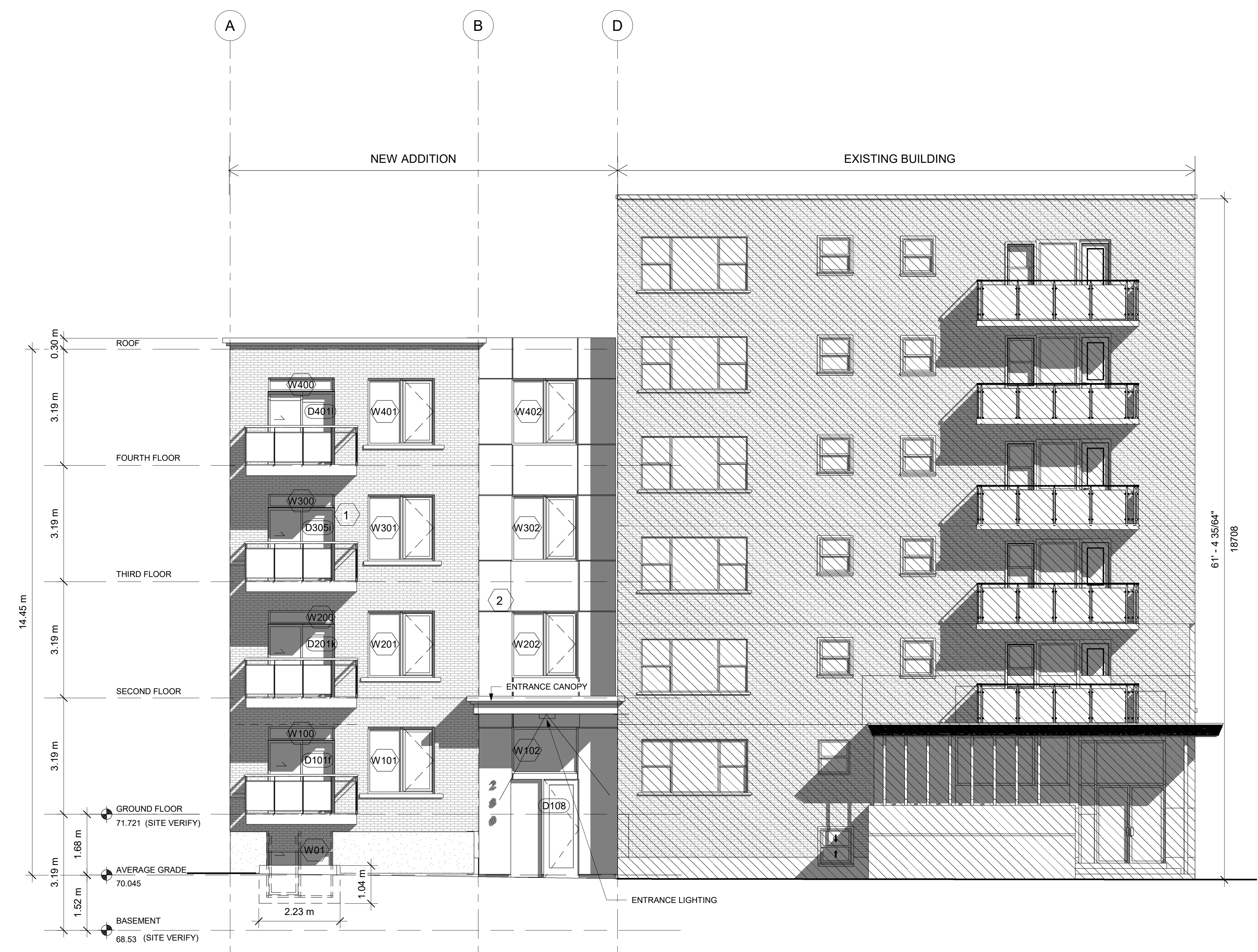
1 Front (North) Elevation 3/16" = 1'-0"

ANDREW MCCREIGHT MANAGER, DEVELOPMENT REVIEW CENTRAL PLANNING, DEVELOPMENT & BUILDING SERVICES DEVELOPMENT DEPARTMENT, CITY OF OTTAWA