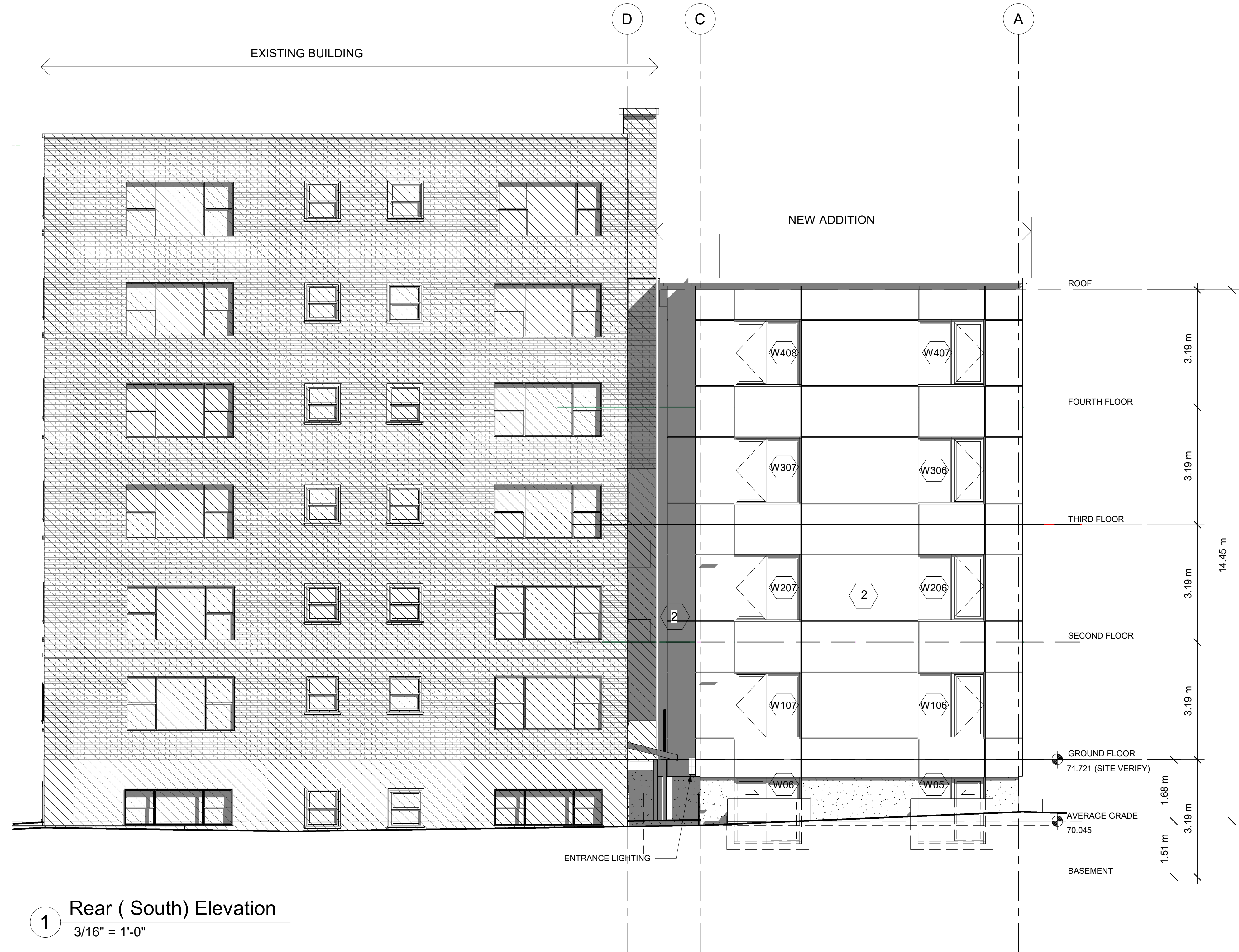
1 Rear ( South) Elevation 3/16" = 1'-0"