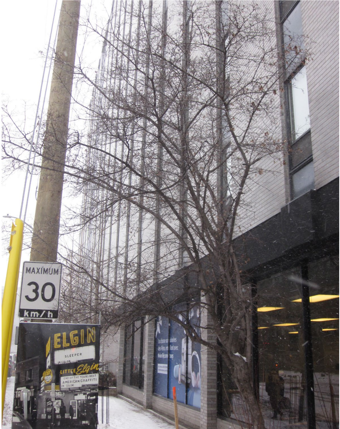
Picture 1. Tree #1, amur maple on city property adjacent to 200 Elgin Street (to be removed).