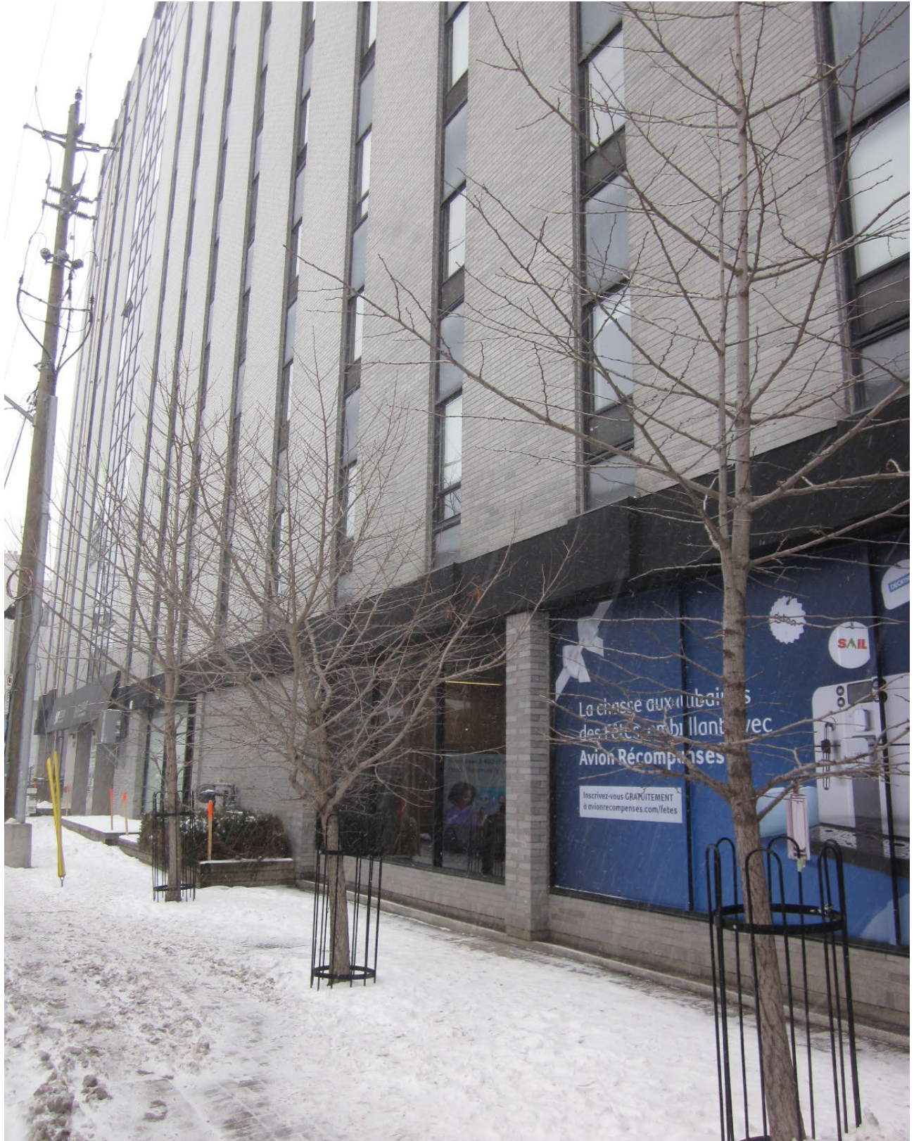
Picture 2. Trees #2-4 (right to left), ginkgo trees on city property adjacent to 200 Elgin Street (to be removed).