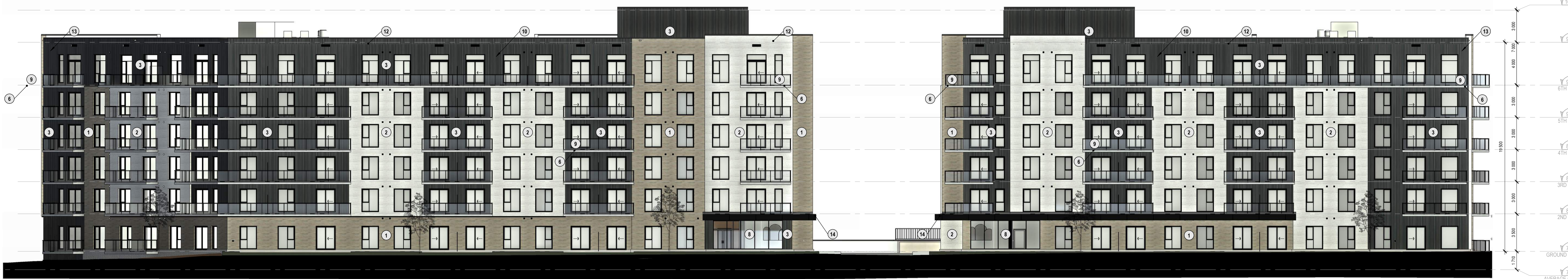
SOUTH ELEVATION 1:150