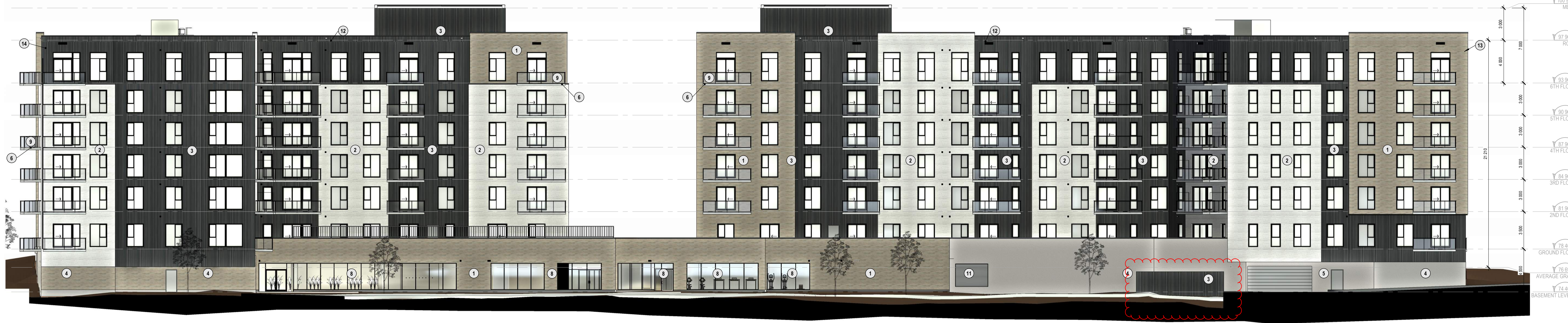
NORTH ELEVATION 1:150

REVISION / Revision C NO. DESSIN / Drawing Number A450