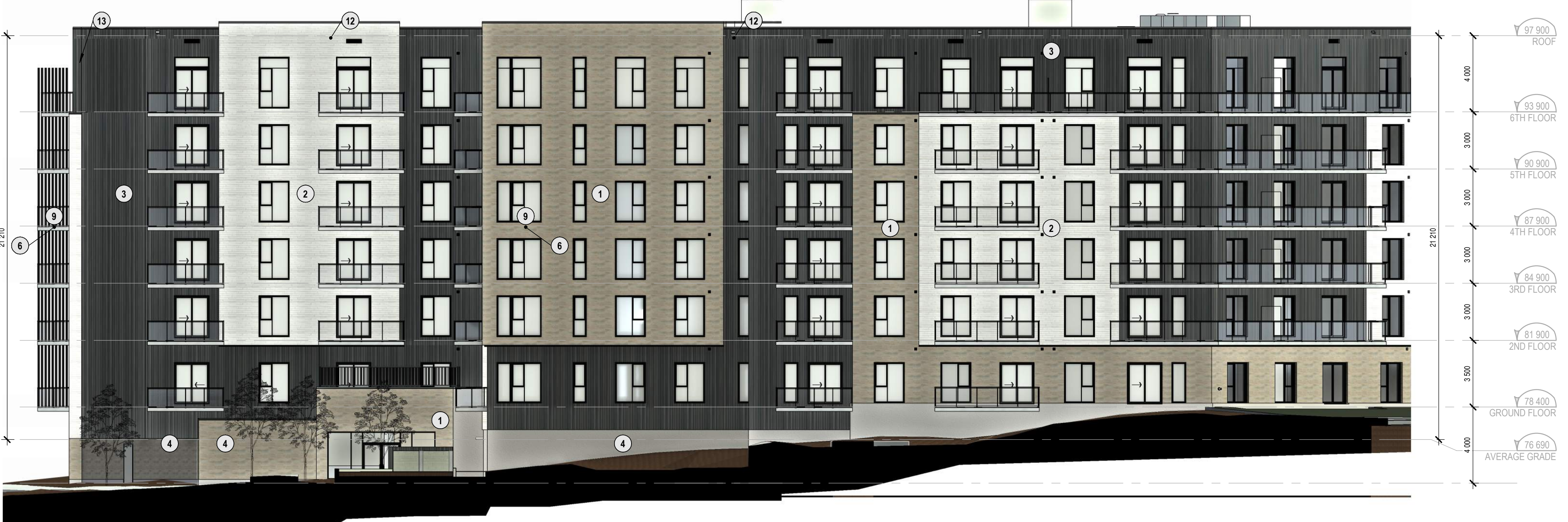
SOUTH WEST ELEVATION 1:150