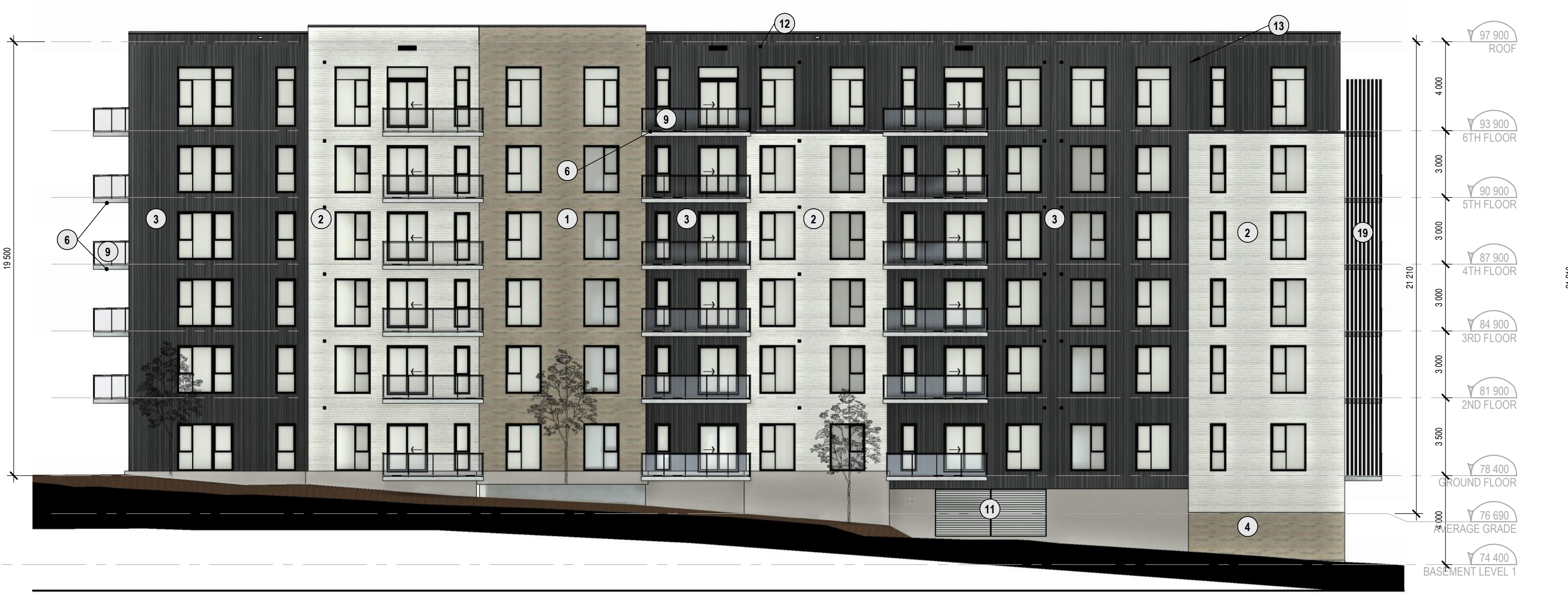
EAST ELEVATION 1:150