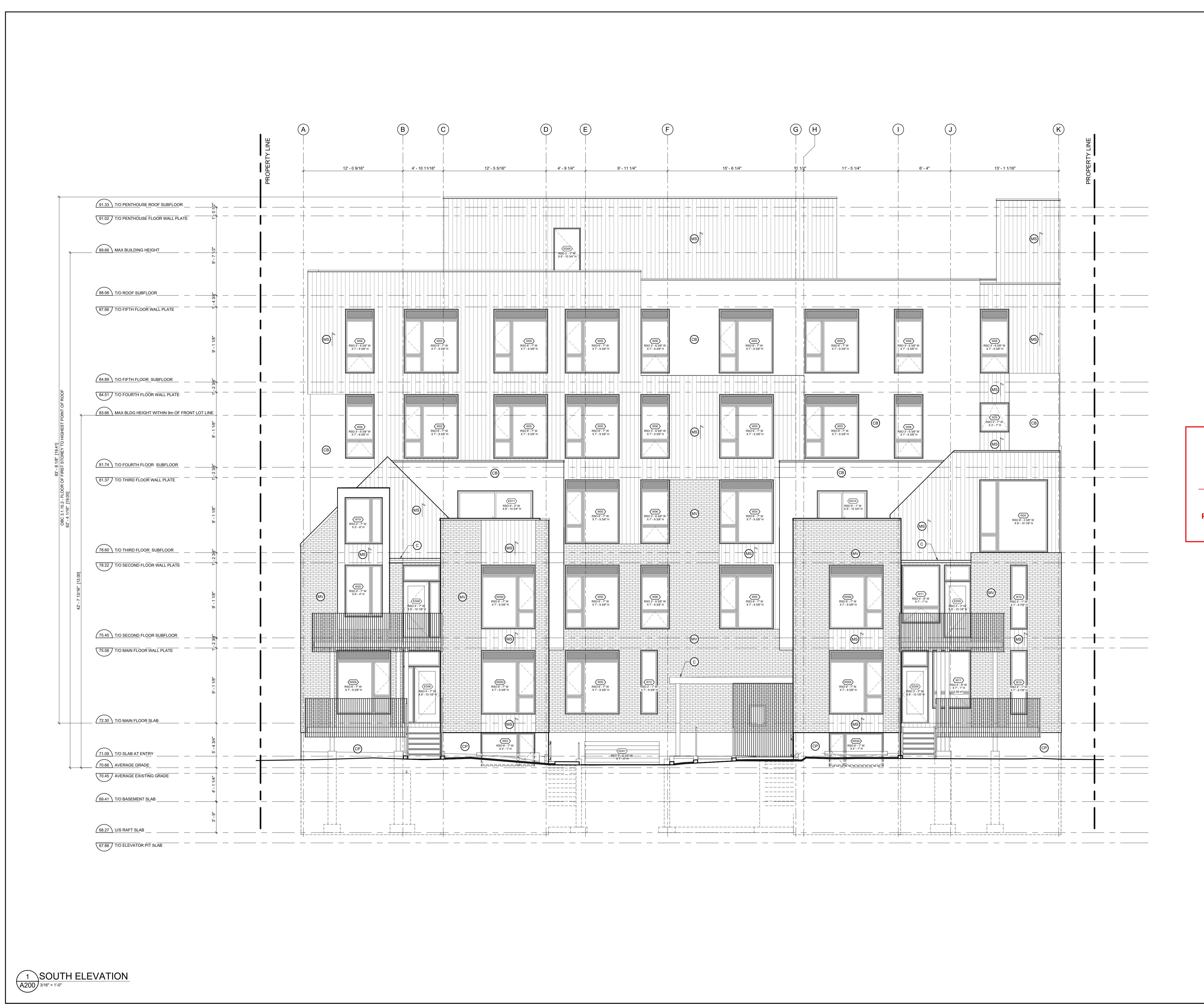
1 SOUTH ELEVATION A200 3/16" = 1'-0"

SCALE AS NOTED DRAWN BY BS DATE 24/09/04 PROJECT NO. 01917 DRAWING NO. A200