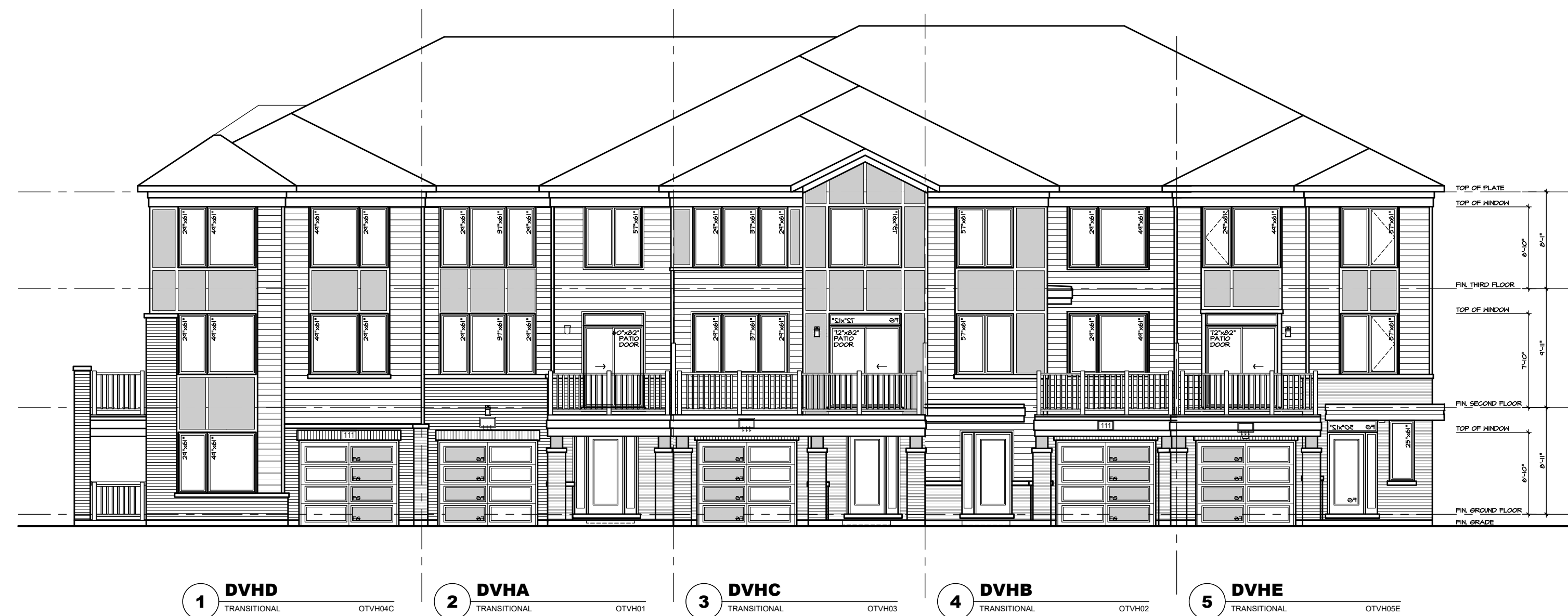
FRONT ELEVATION 'TN'

APPROVED By Lily Xu at 3:45 pm, Oct 21, 2024 Lily Xu LILY XU, MCIP, RPP MANAGER, DEVELOPMENT REVIEW SOUTH PLANNING, DEVELOPMENT, AND BUILDING SERVICES DEPARTMENT, CITY OF OTTAWA