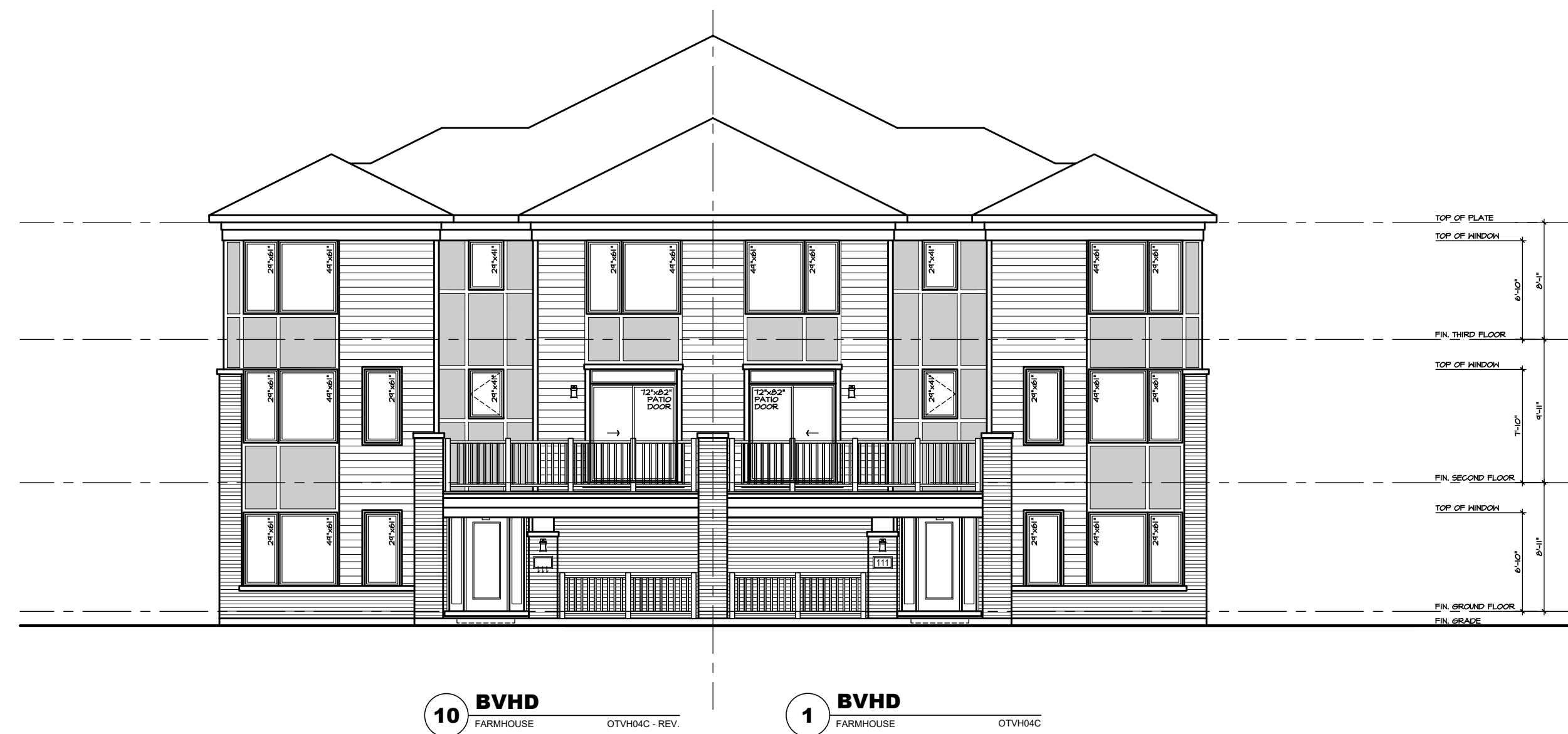
FLANKAGE ELEVATION 'TN'