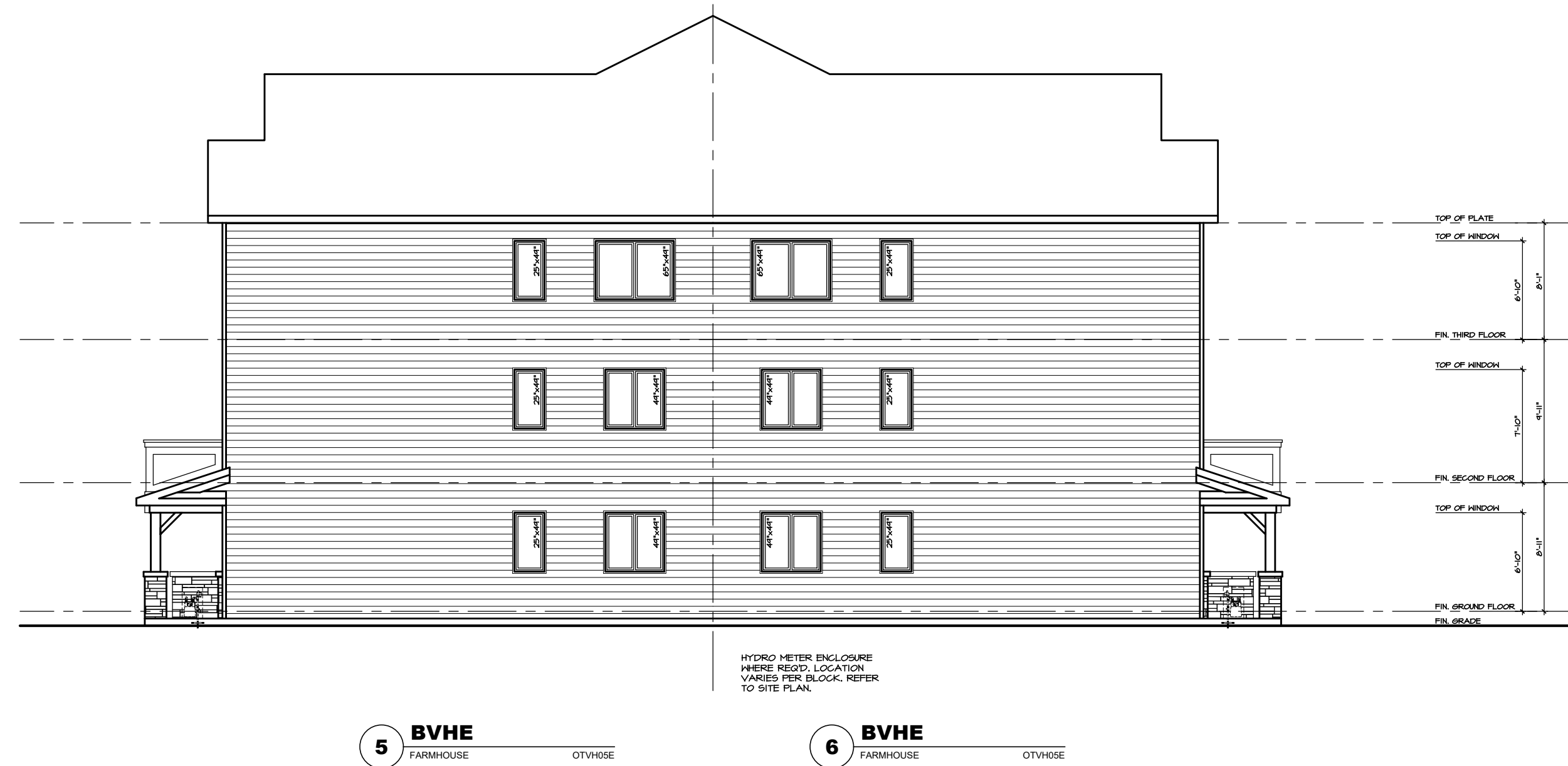
SIDE ELEVATION 'FH'

Q4 Architects Inc. retains the copyright in all drawings, plans, sketches, and all digital information. They may not be copied or used for any other projects or purposes or distributed without the written consent of Q4 Architects Inc.