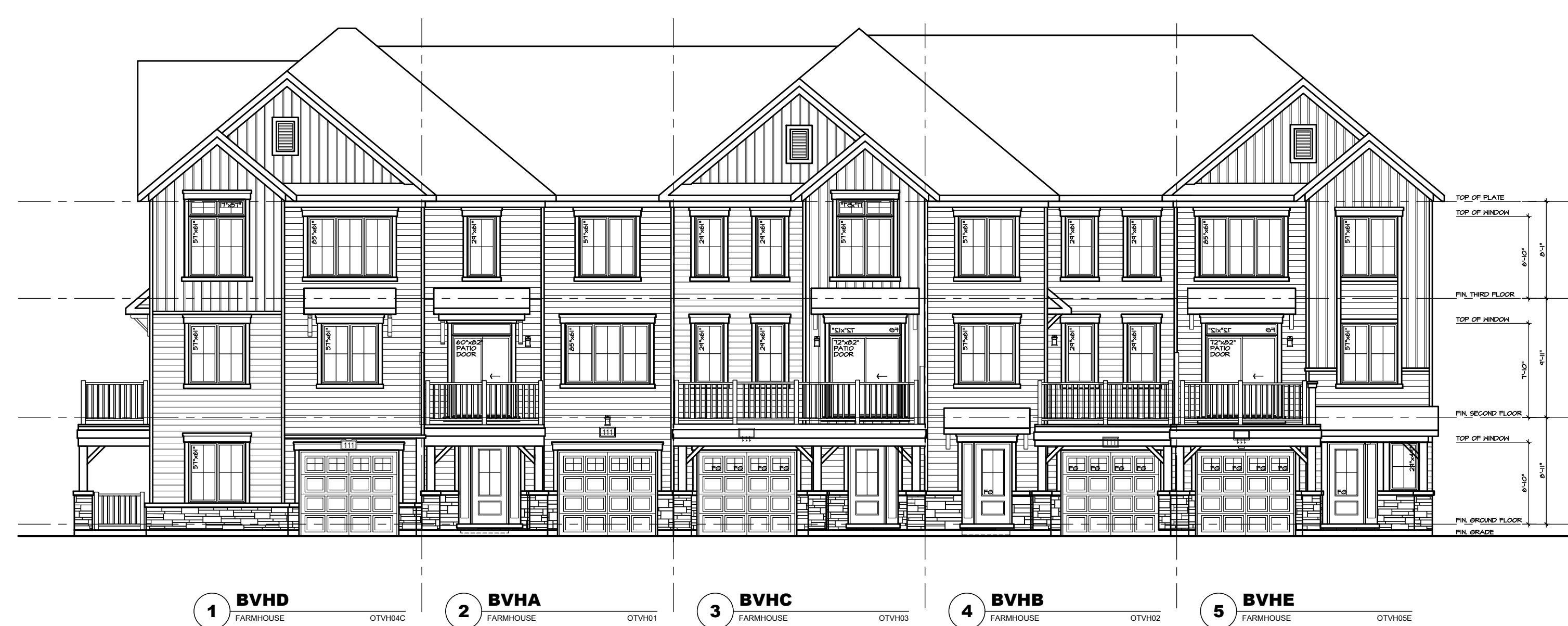
FRONT ELEVATION 'FH'