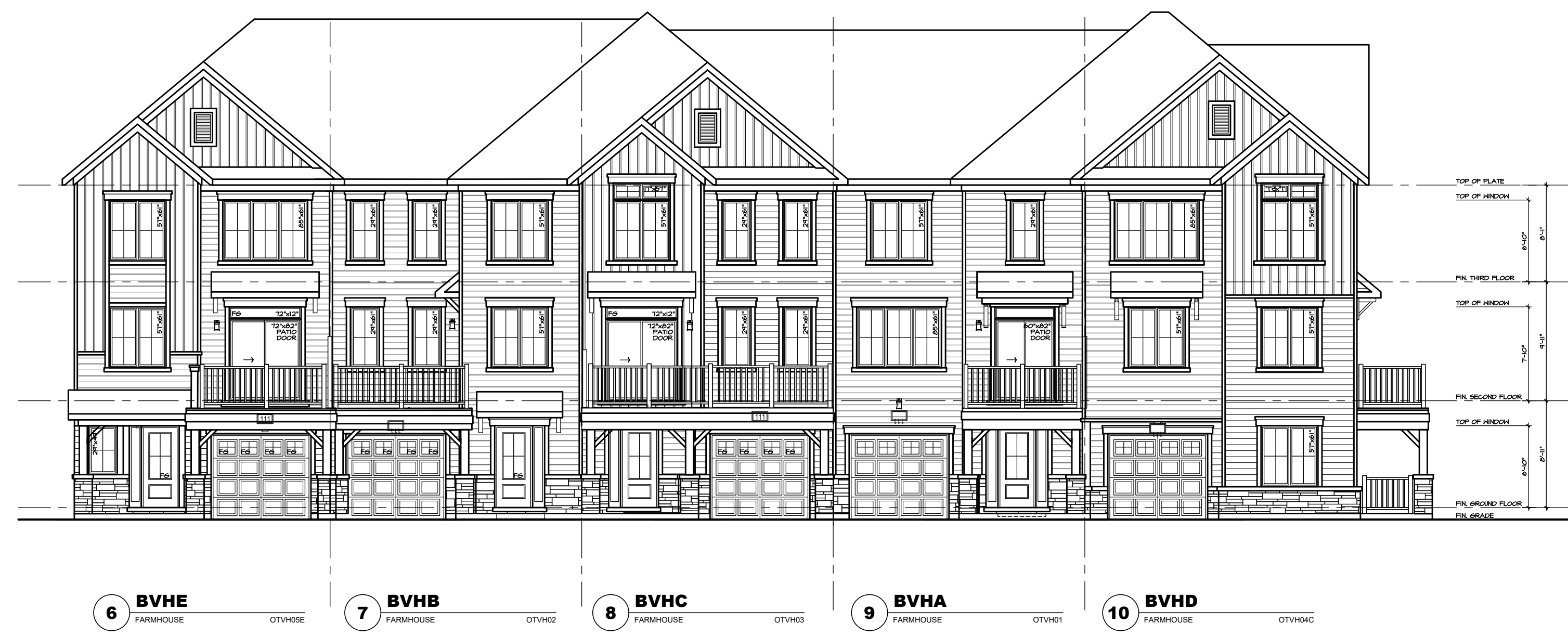
FRONT ELEVATION 'FH'