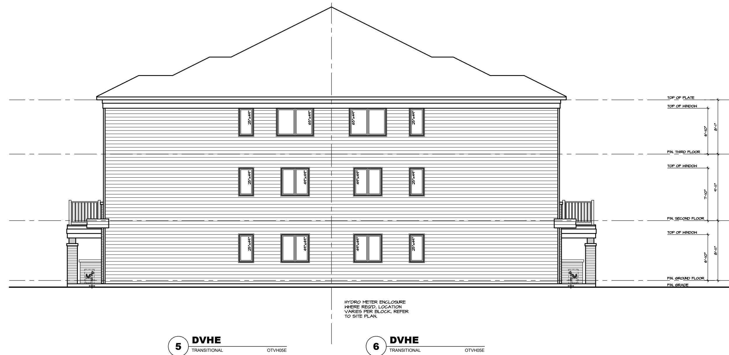
SIDE ELEVATION 'TN'

Q4 Architects Inc. retains the copyright in all drawings, plans, sketches, and all digital information. They may not be copied or used for any other projects or purposes or distributed without the written consent of Q4 Architects Inc.