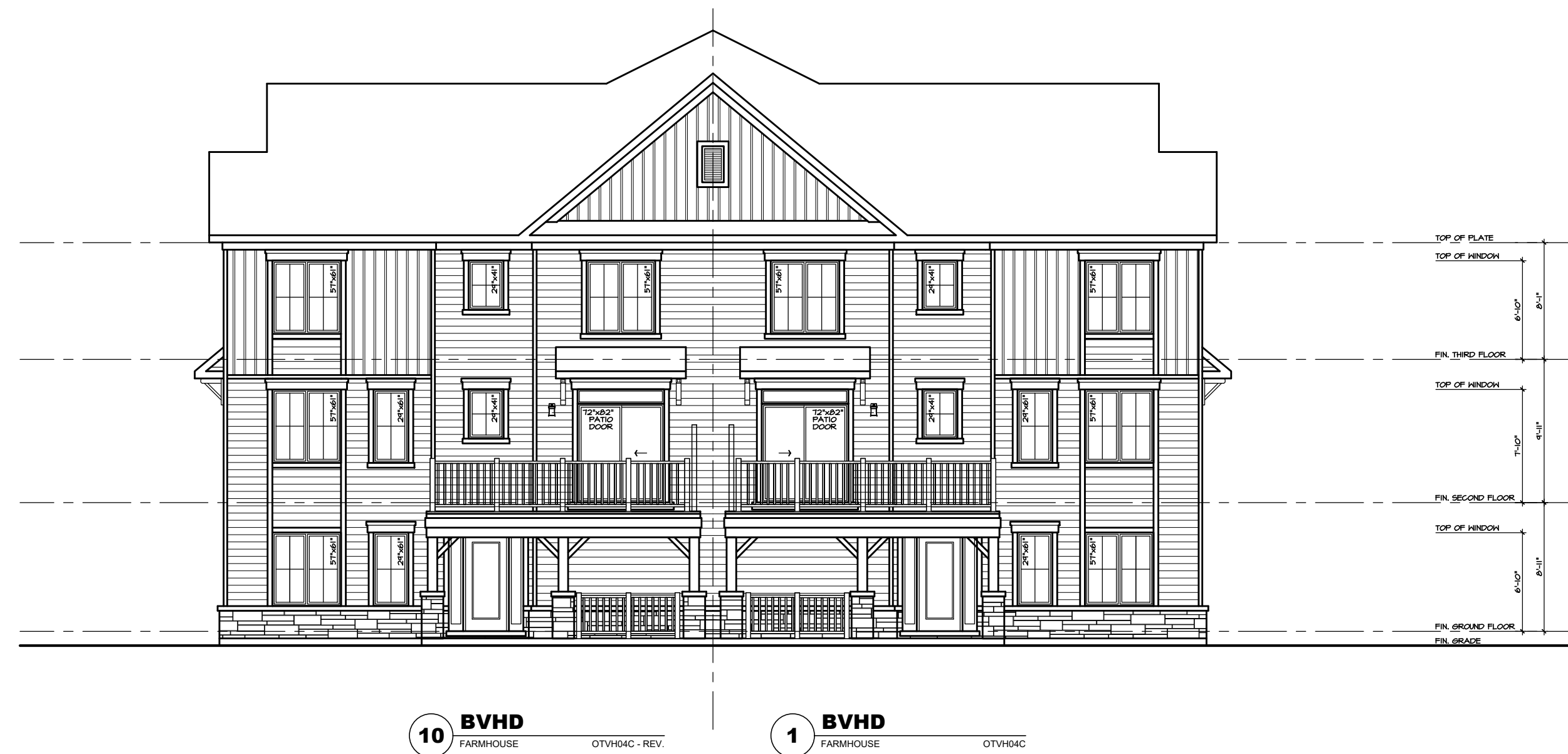
FLANKAGE ELEVATION 'FH'