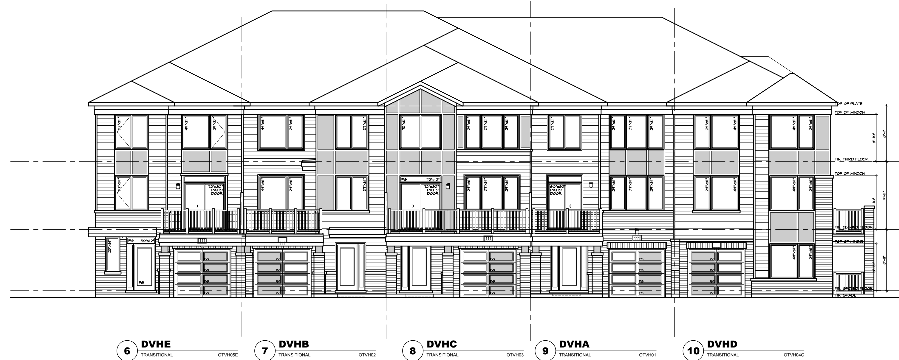
FRONT ELEVATION 'TN'