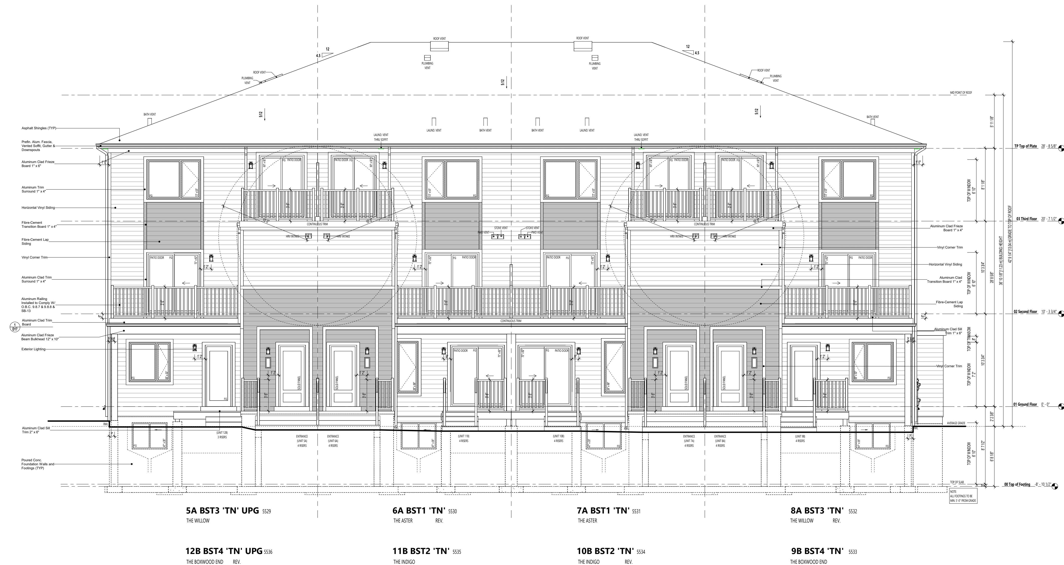
REAR ELEVATION BLOCK 3, NORTH SIDE

APPROVED By Lily Xu at 3:53 pm, Oct 21, 2024 LILY XU, MCIP, RPP MANAGER, DEVELOPMENT REVIEW SOUTH PLANNING, DEVELOPMENT, AND BUILDING SERVICES DEPARTMENT, CITY OF OTTAWA