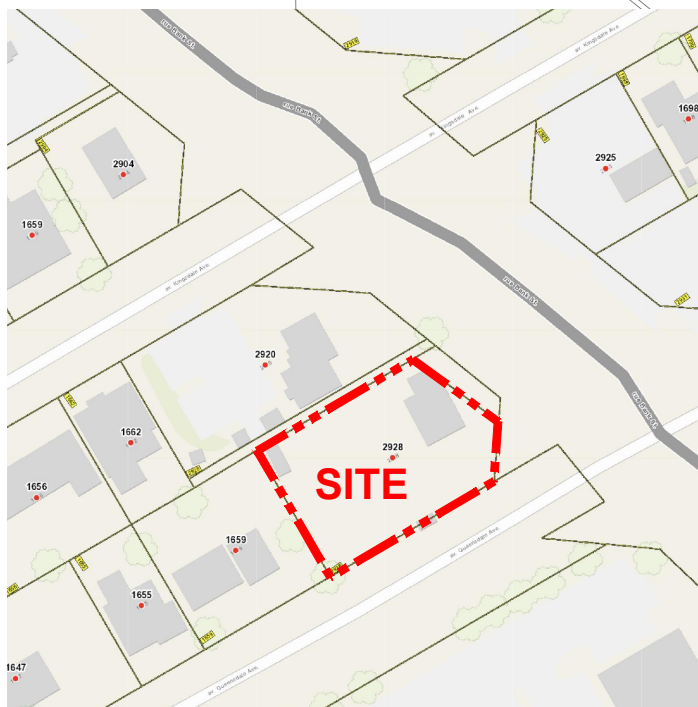
KEY PLAN N.T.S.

AREAS WITHIN THE CRITICAL ROOT ZONE OF EXISTING TREES ARE TO BE EXCAVATED USING A HYDRO-VAC