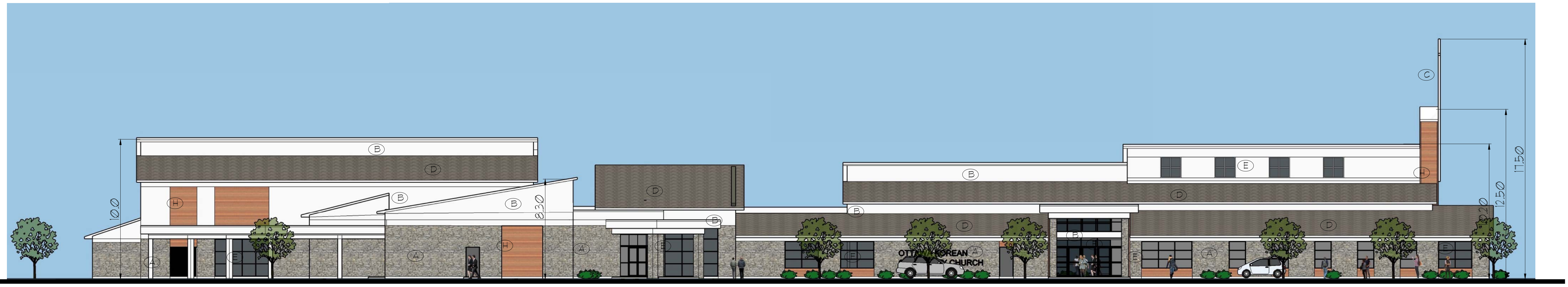
FRONT (NORTHWEST) ELEVATION SCALE 1:150