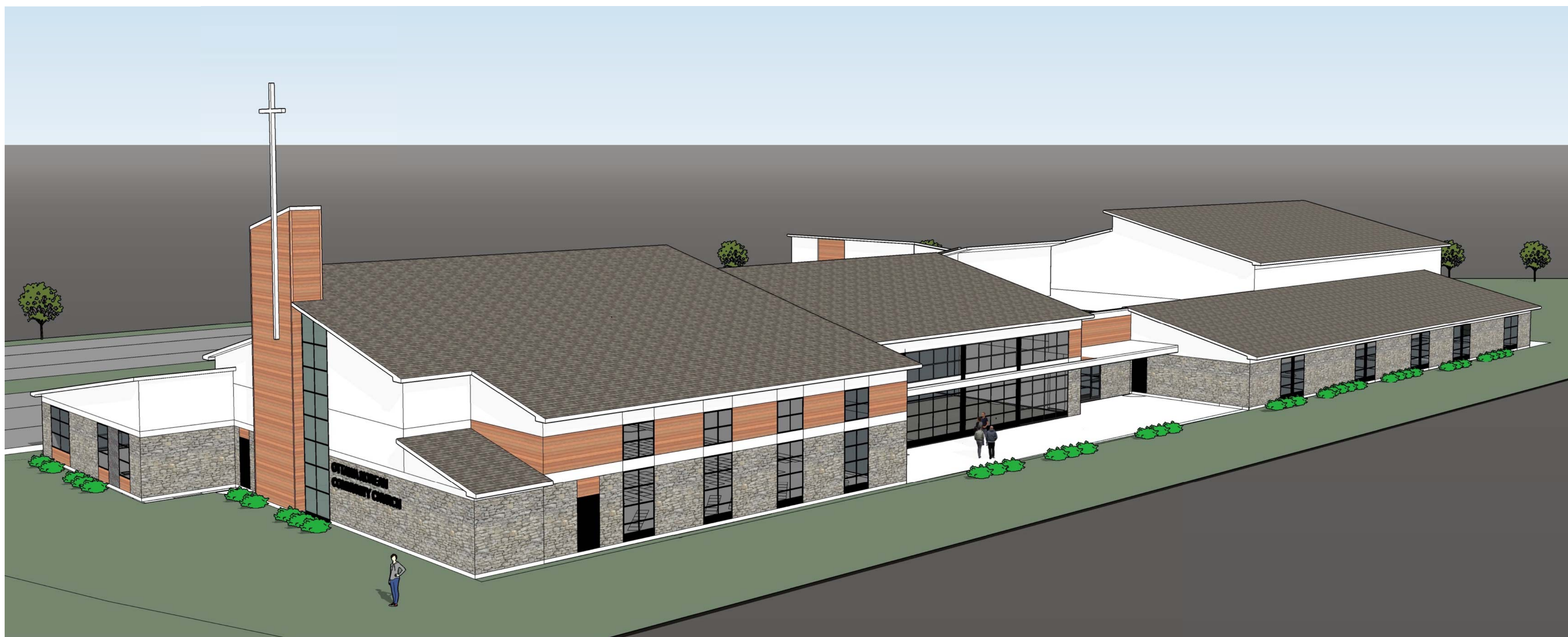
AERIAL VIEW OF SOUTHWEST FACADE