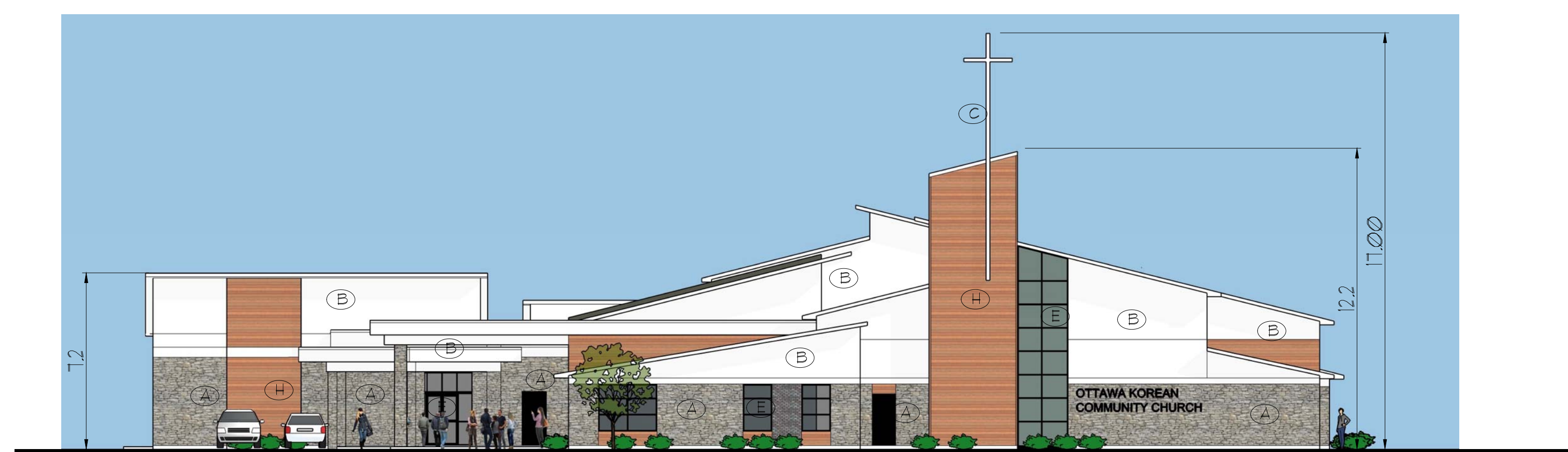
LEFT (SOUTHWEST) ELEVATION