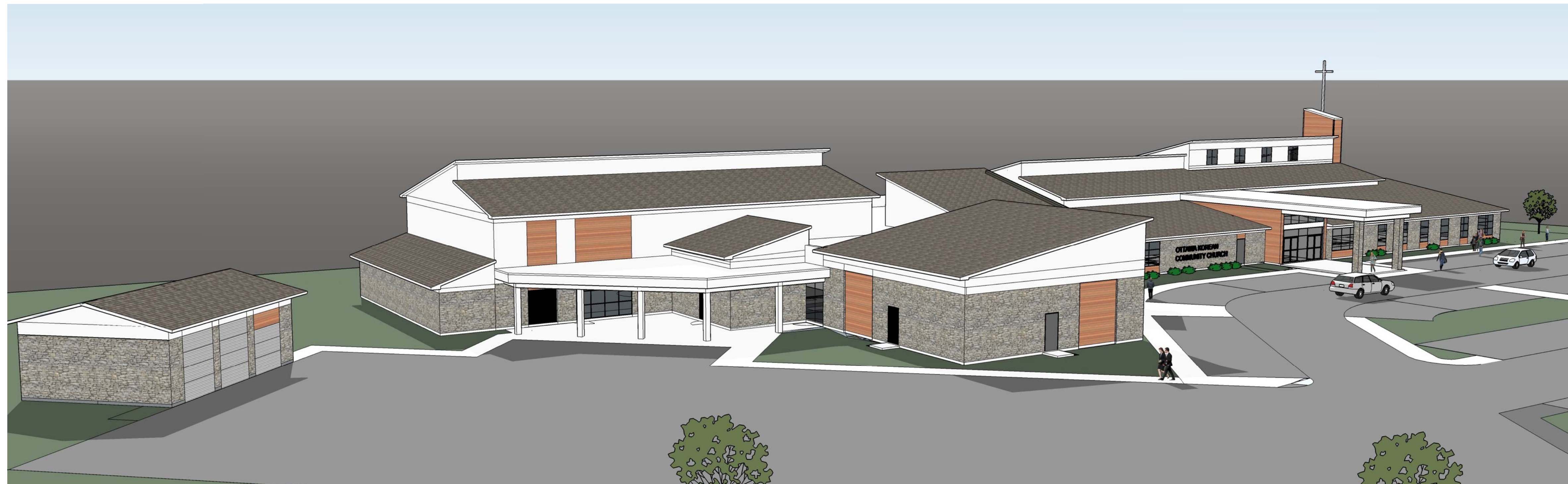
VIEW OF NORTHEAST FACADE