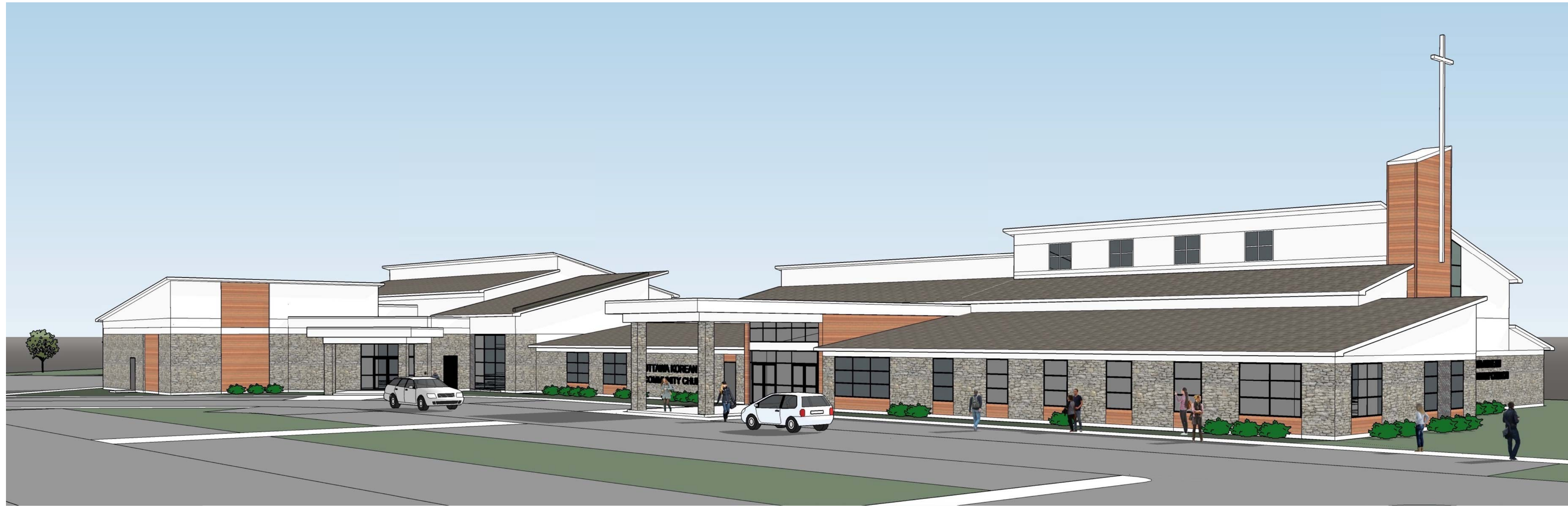
VIEW OF SOUTHWEST FACADE FROM BORRISOKANE ROAD