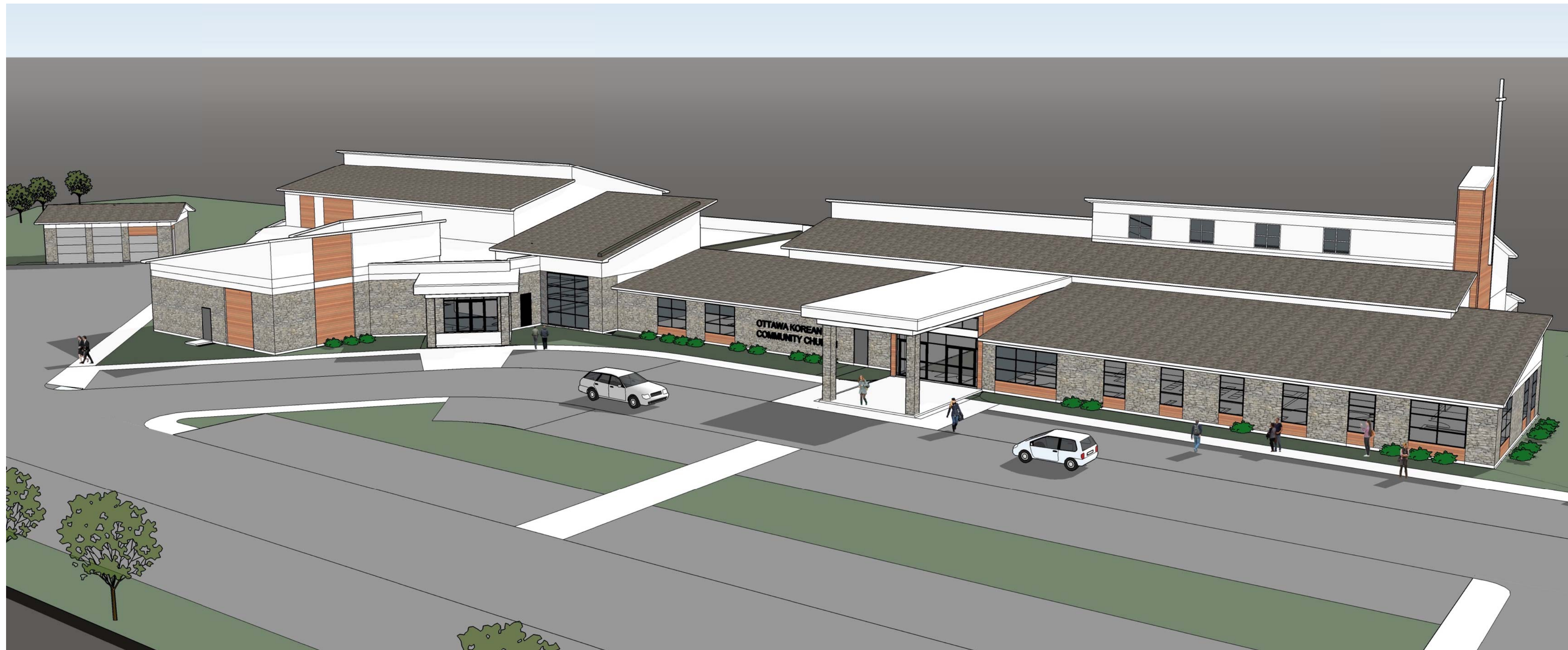
AERIAL VIEW OF NORTHEAST FACADE