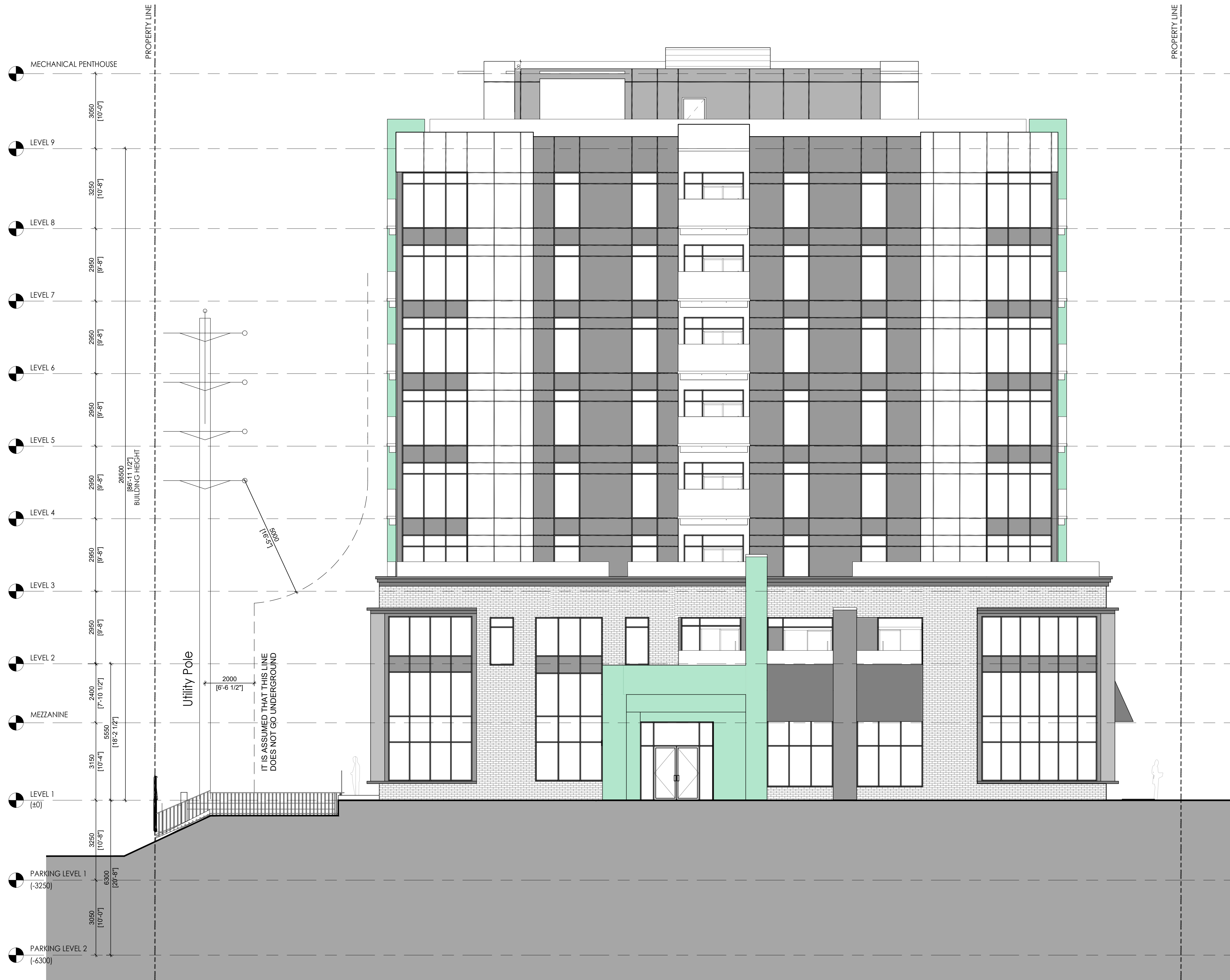
1 SOUTH ELEVATION A120 1:75