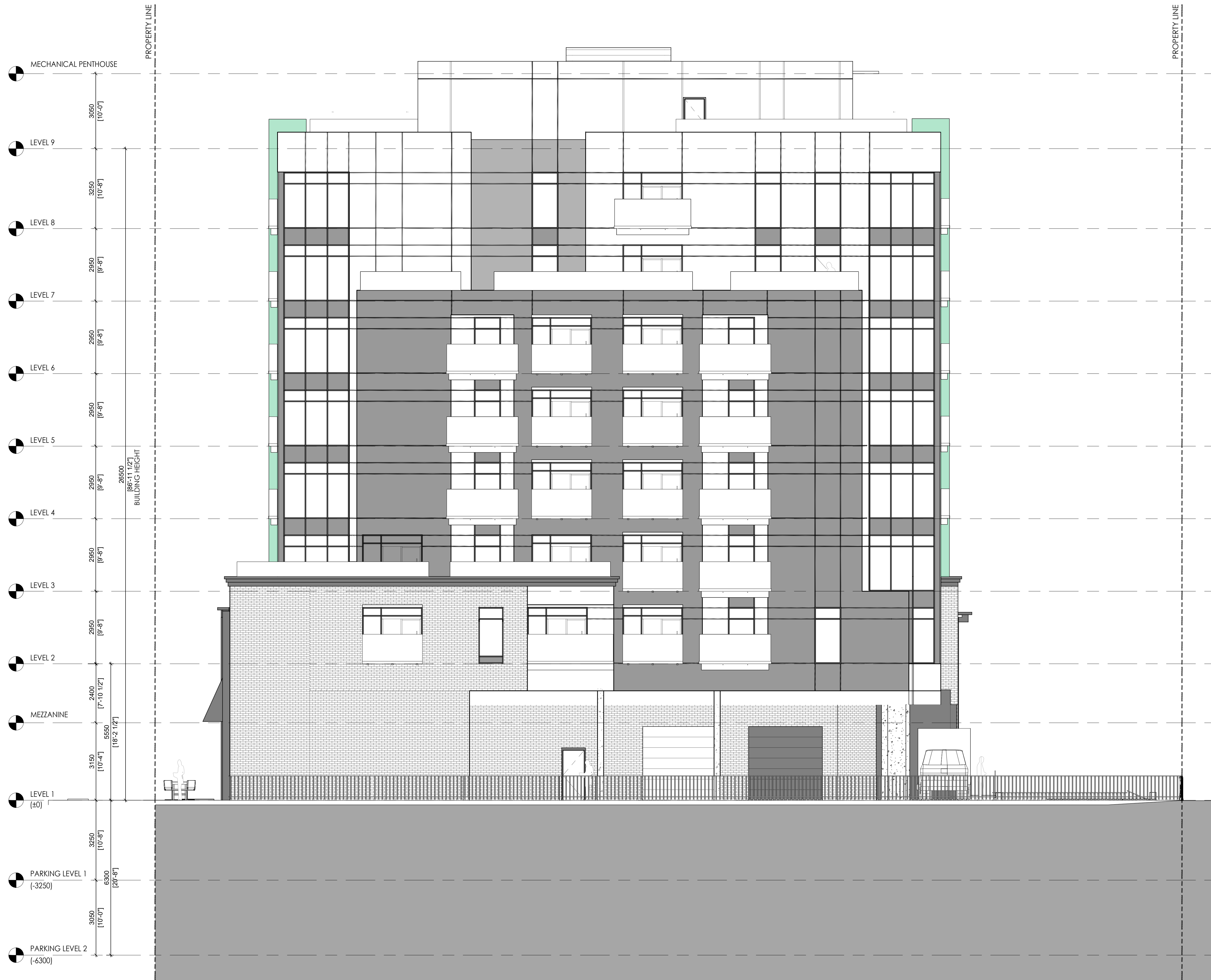
1 NORTH ELEVATION A120 1 : 75