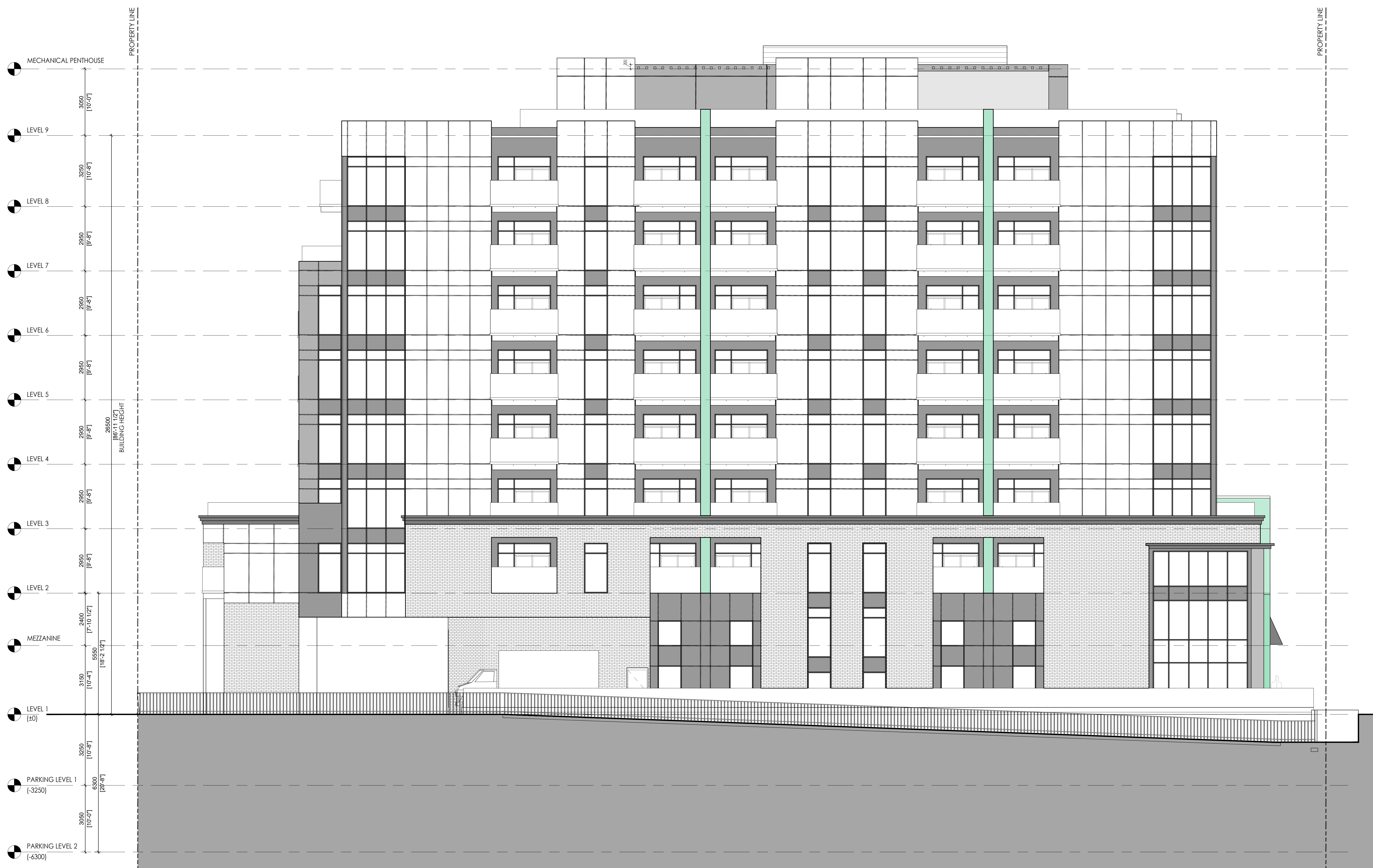
1 WEST ELEVATION A120 1:75