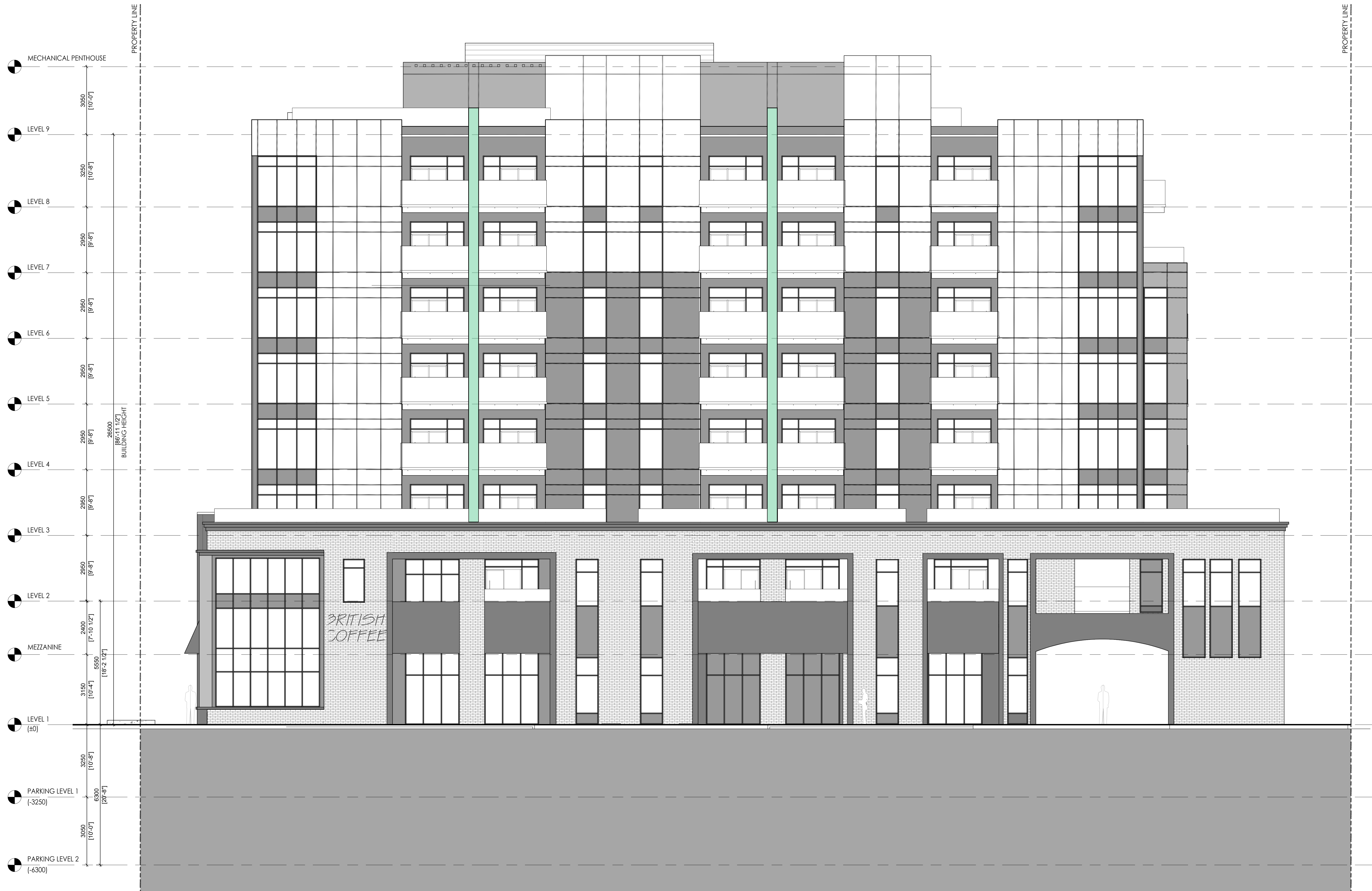
1 EAST ELEVATION A120 1:75