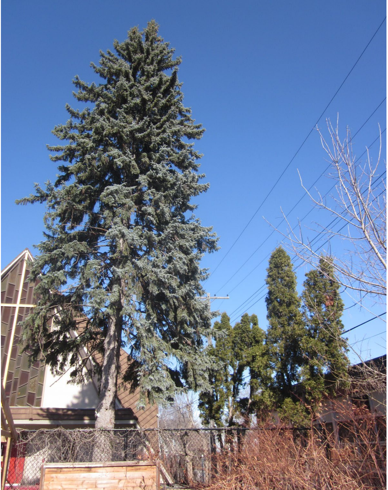
Picture 1. Trees #1 and 2 (right to left), neighbouring cedar and spruce trees at 917 Merivale Road