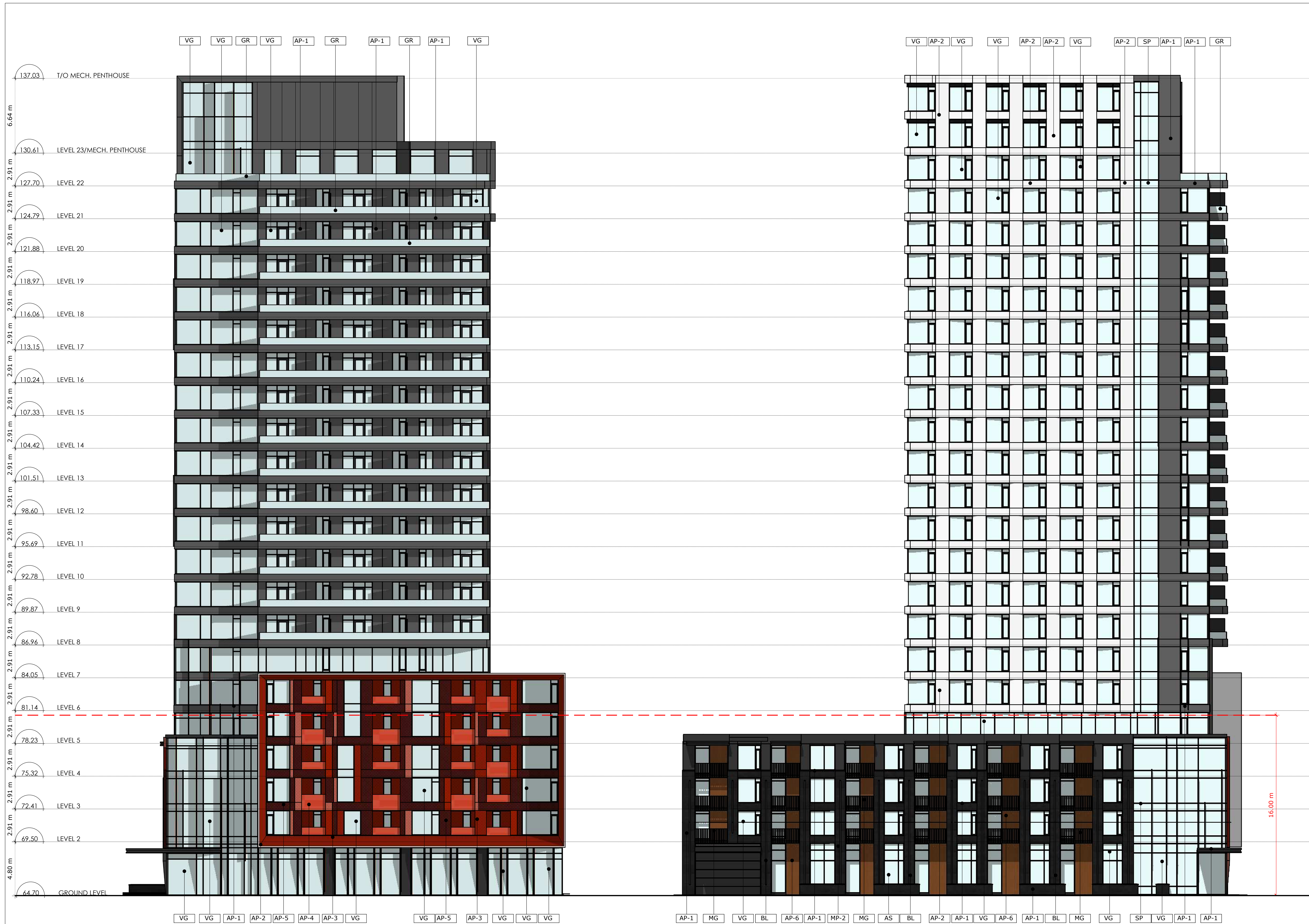
1 NORTH ELEVATION A3.00 Scale: 1: 150