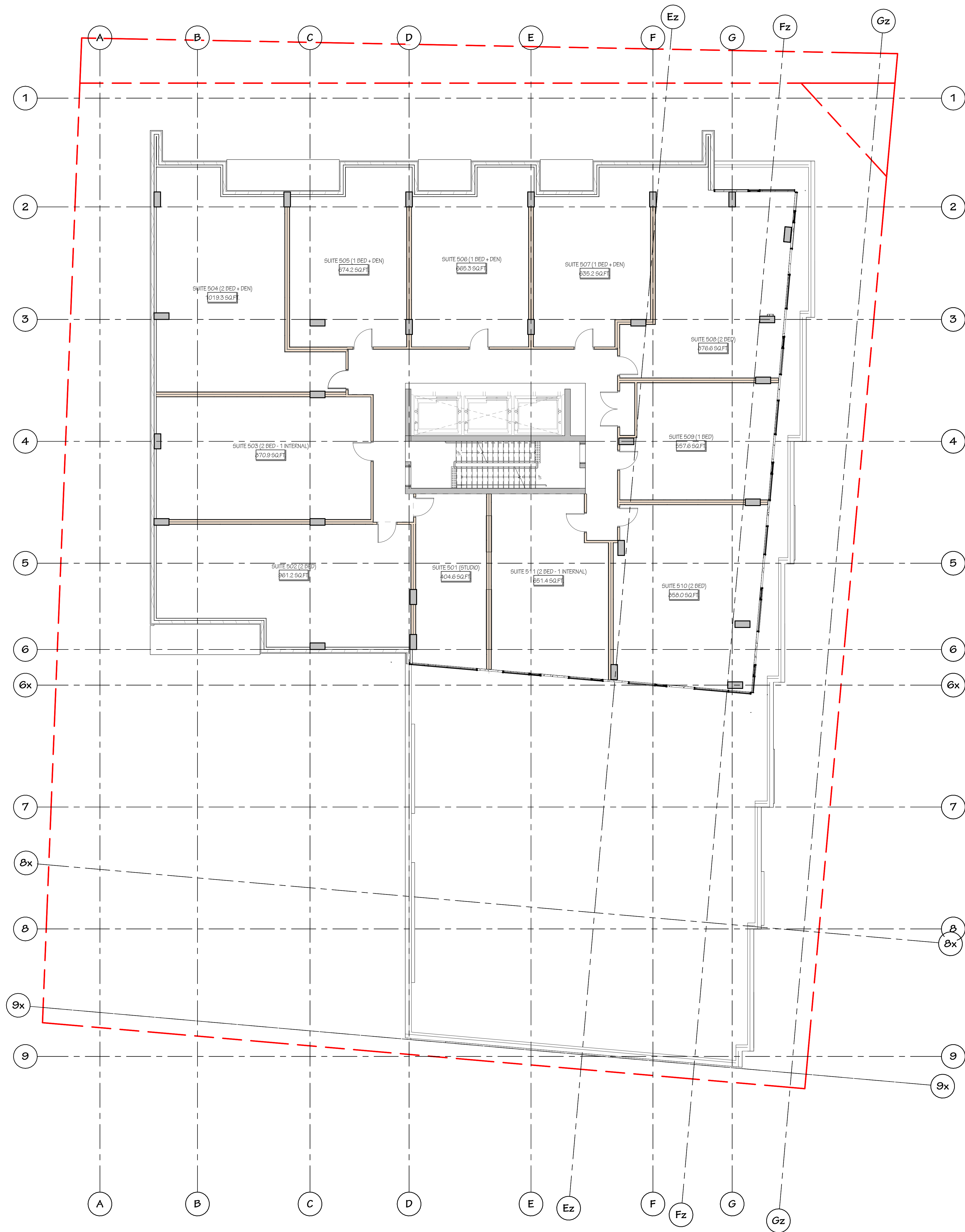
1 LEVEL 5 - SPA SPA - A2.04 SCALE: 1:100