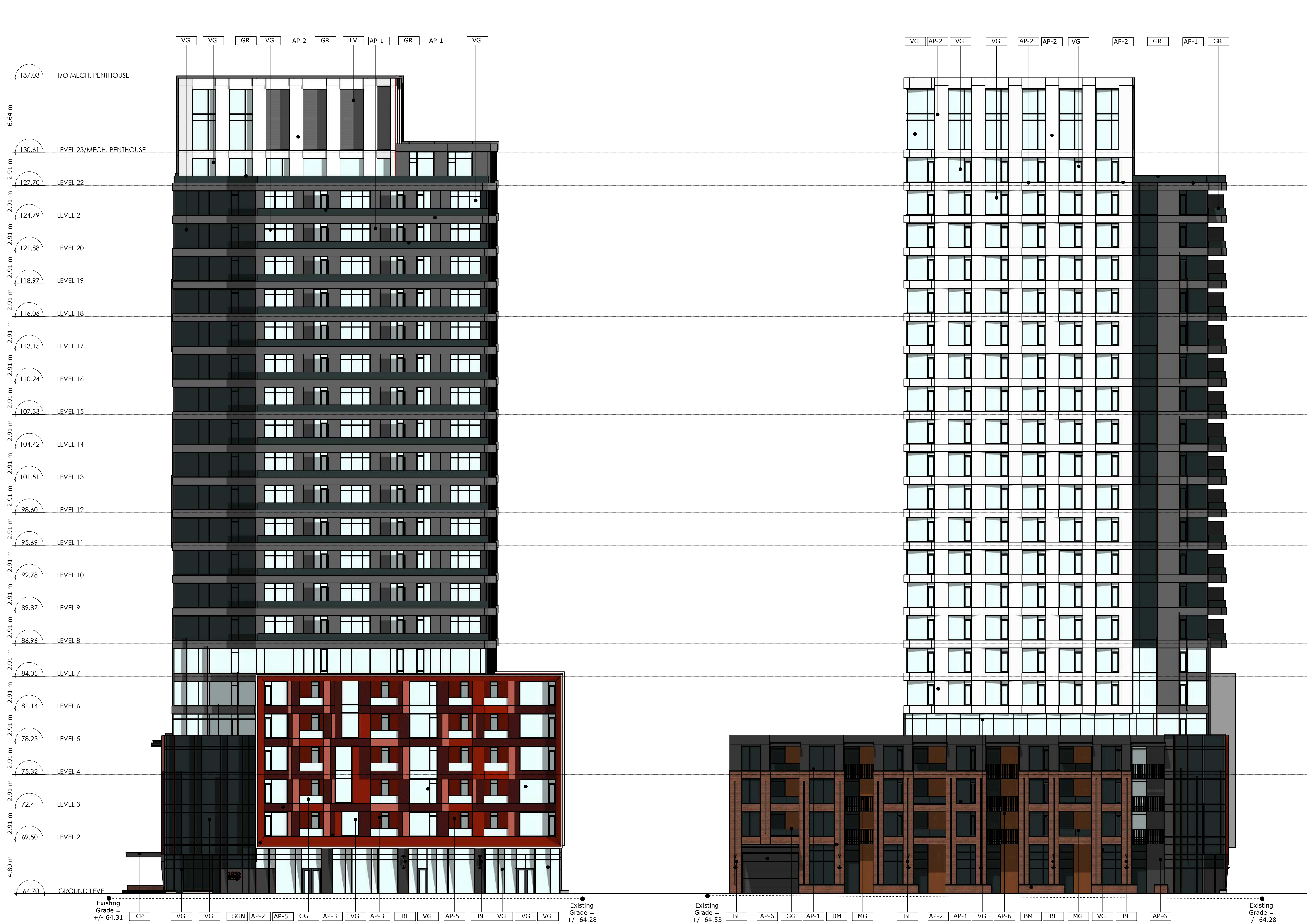
1 NORTH ELEVATION A3.00 Scale: 1: 150