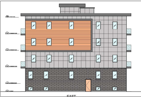
1 EAST (SIDE) FACADE SCALE = 1/8" = 1'-0"