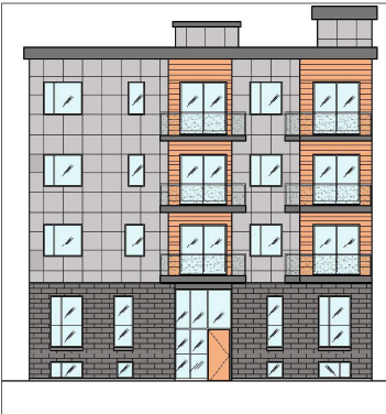
1 FRONT (NORTH) FACADE SCALE = 1/8" = 1'-0"