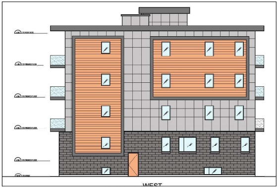
1 EAST (SIDE) FACADE SCALE = 1/8" = 1'-0"