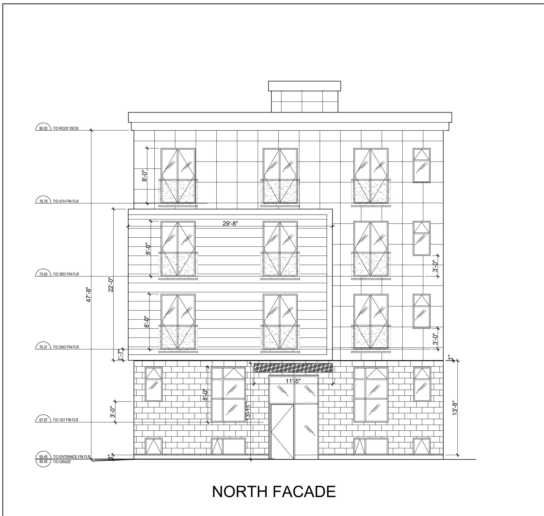
1 NORTH FACADE A-400 SCALE = 1/8" = 1'-0"