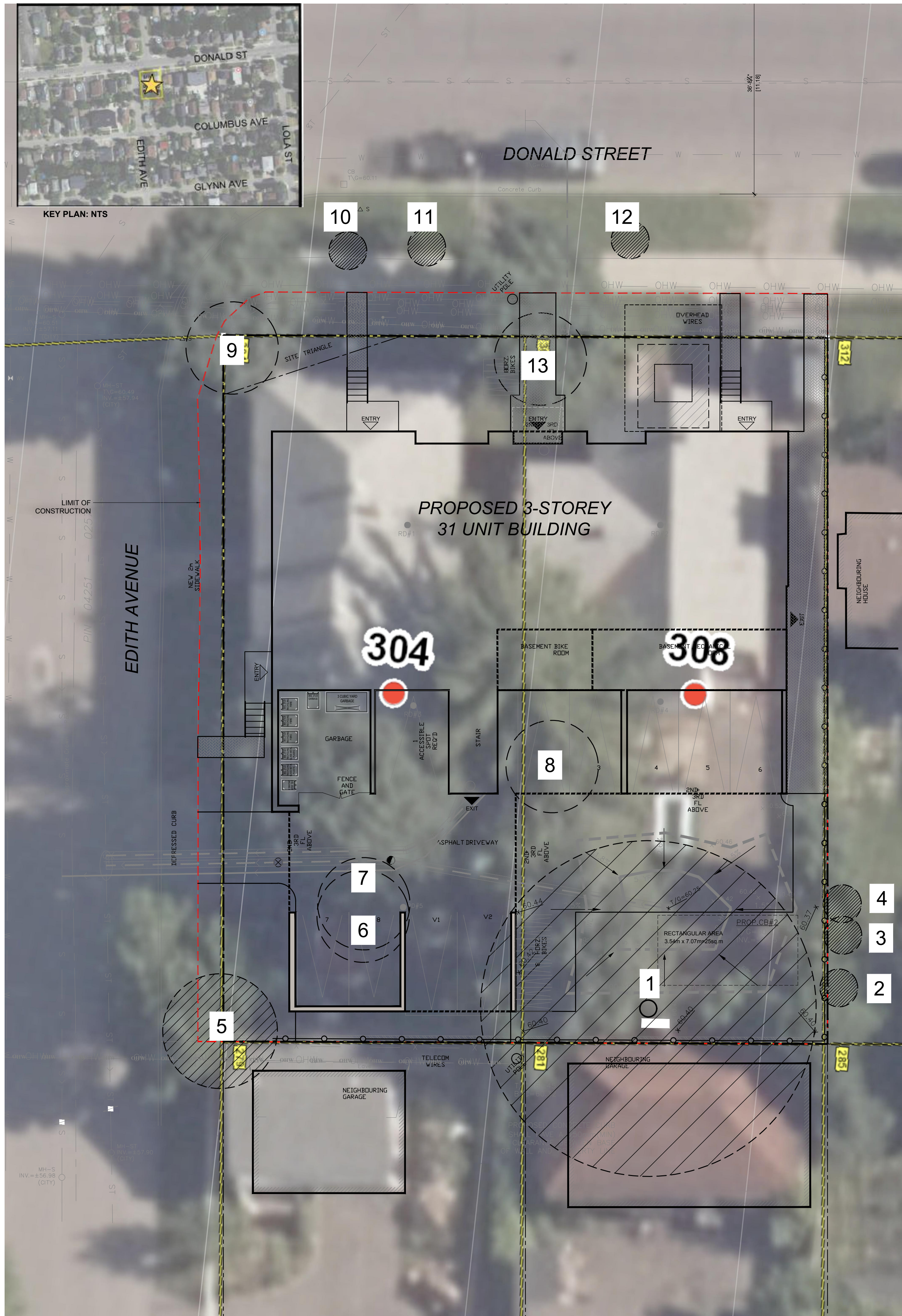
1 EXISTING CONDITIONS MAP E.1 SCALE 1:125