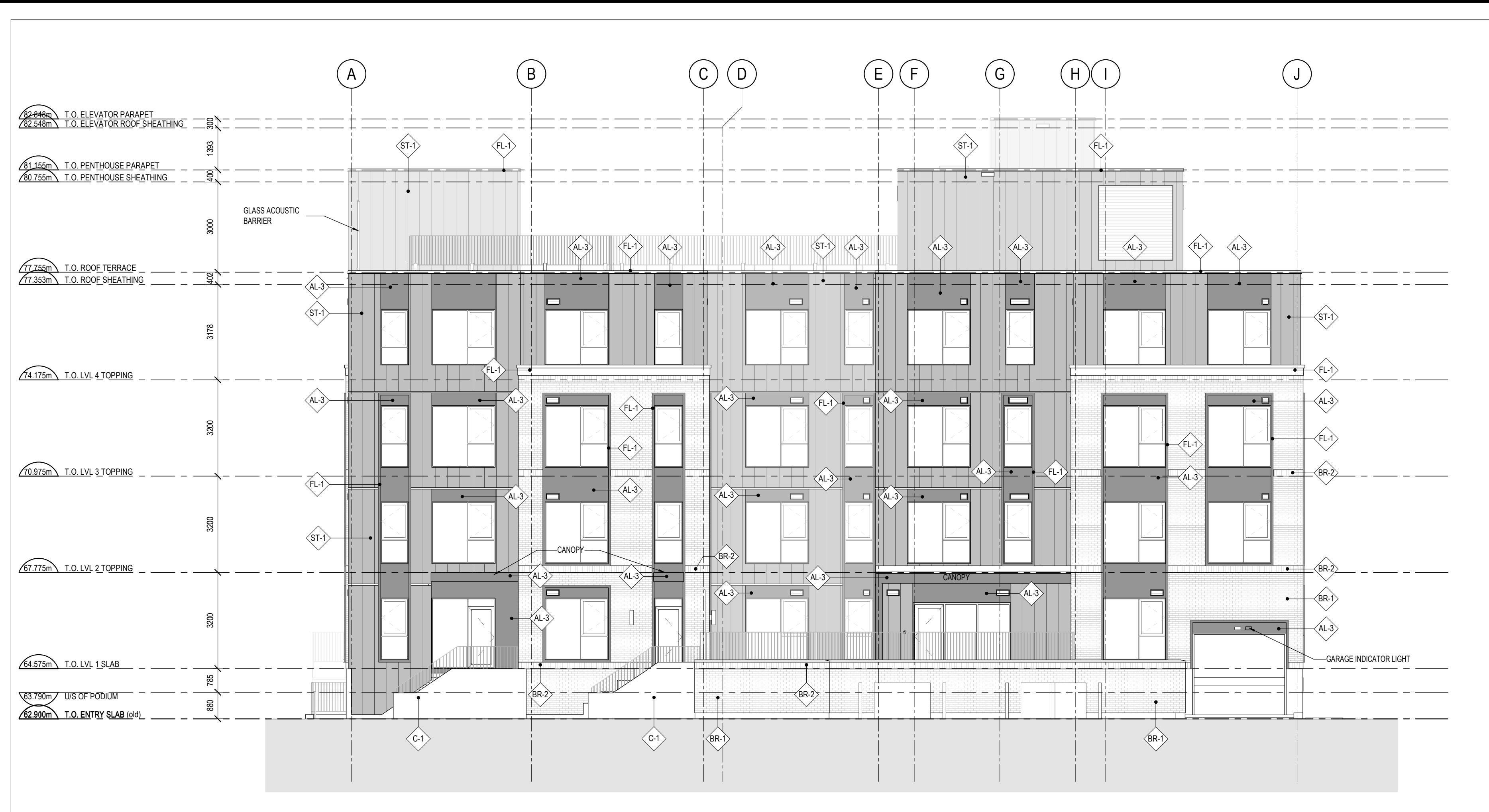
1 WEST ELEVATION A11 SCALE: 1:100