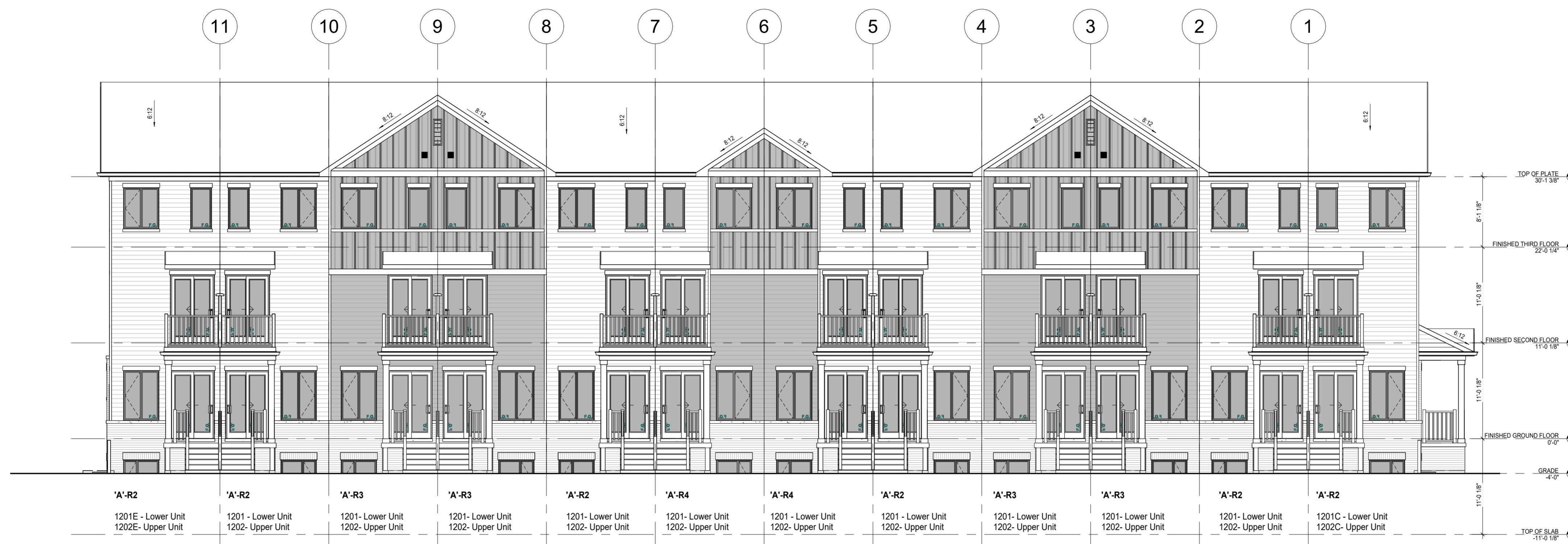
① 24 UNIT BLOCK - UPGRADE REAR ELEVATION OPTION 1 1/8" = 1'-0"

Q4 Architects Inc. retains the copyright in all drawings, plans, sketches, and all digital information. They may not be copied or used for any other projects or purposes or distributed without the written consent of Q4 Architects Inc.