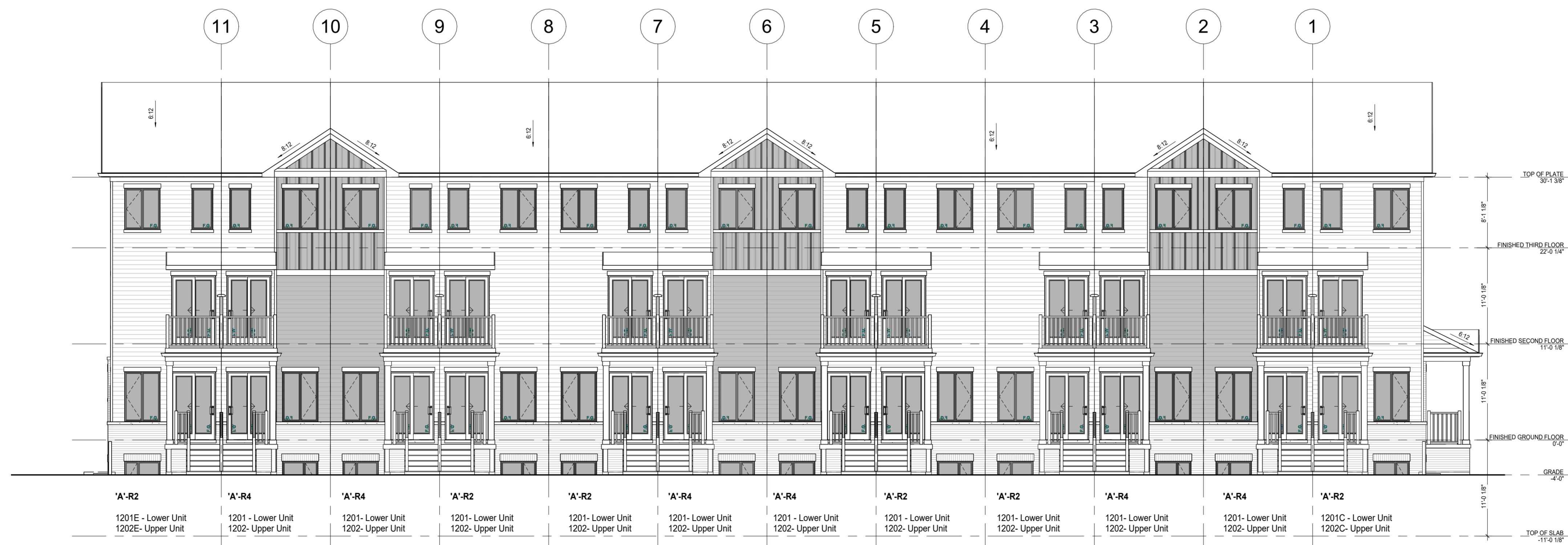
② 24 UNIT BLOCK - UPGRADE REAR ELEVATION OPTION 2 1/8" = 1'-0"