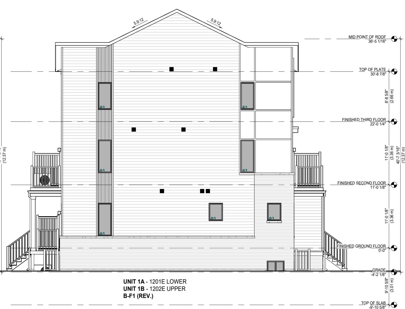
3 24 UNIT BLOCK - LEFT ELEVATION B 1/8" = 1'-0"

1 ISSUED FOR CLIENT REVIEW 2024.08.20 SDW