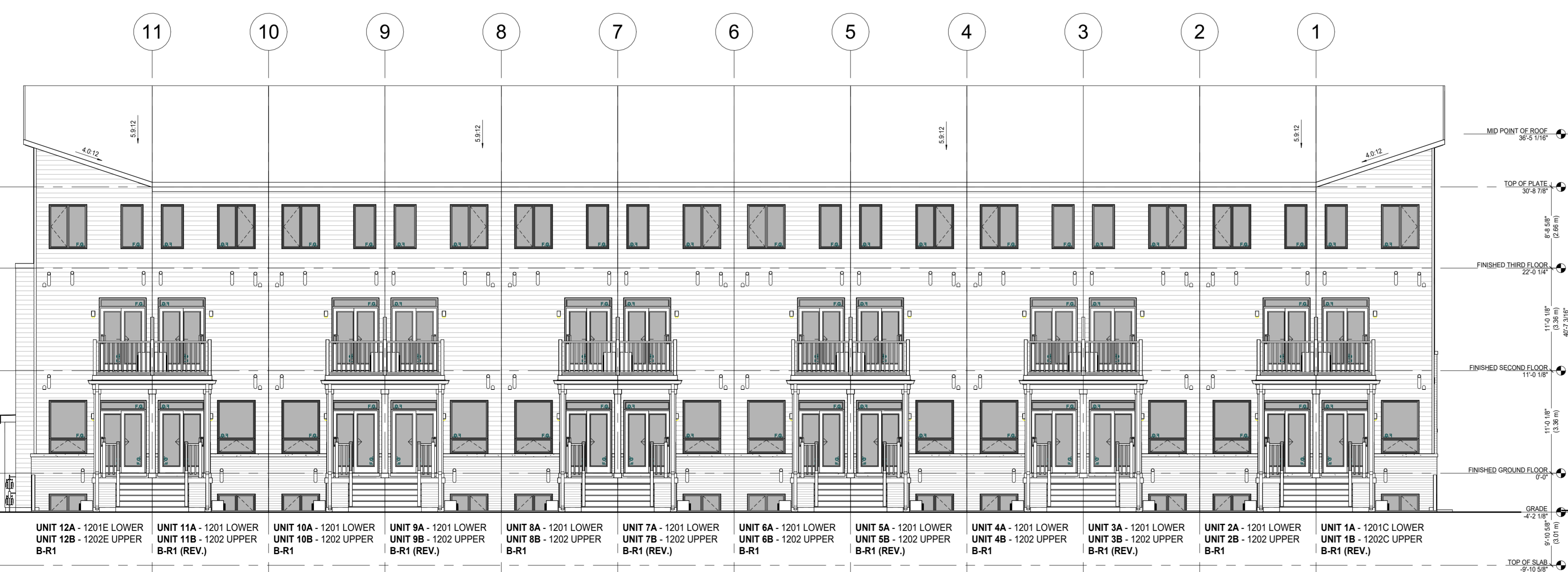
2 24 UNIT BLOCK - REAR ELEVATION B 1/8" = 1'-0"