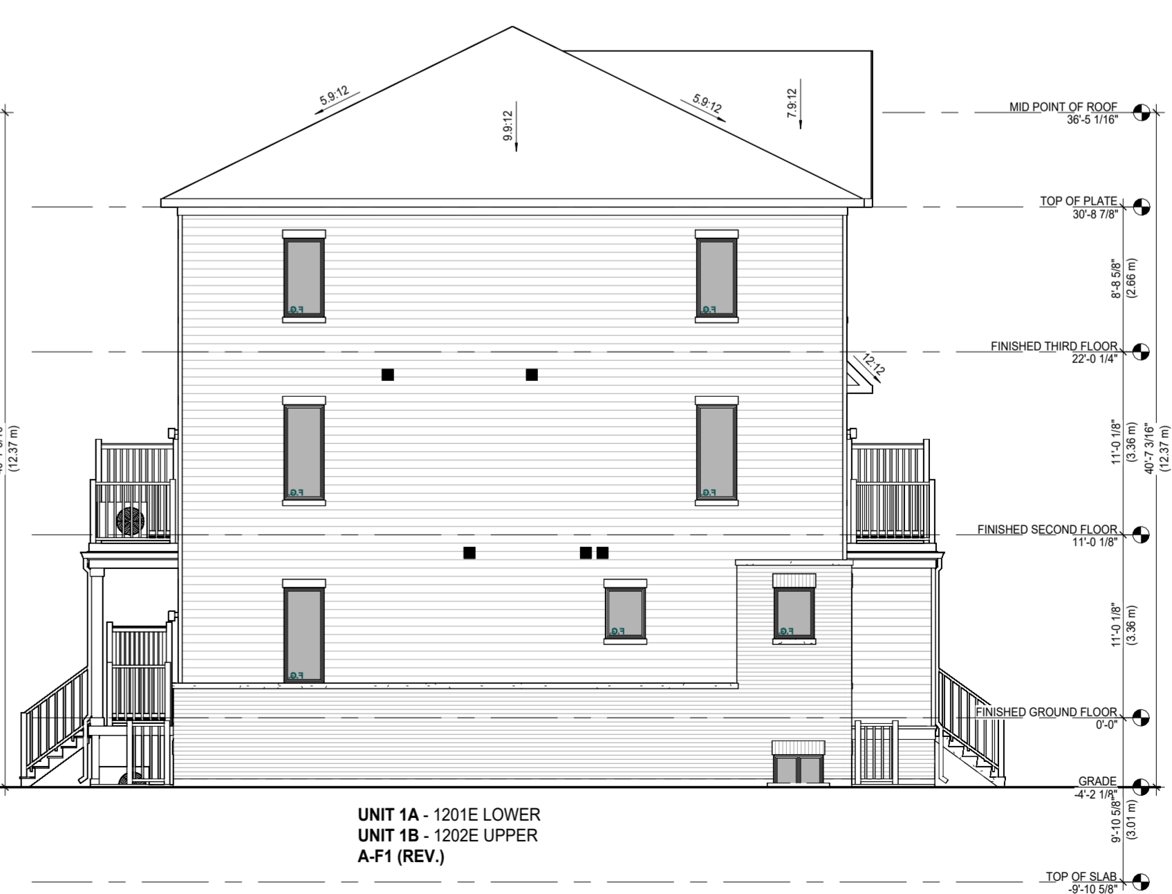
3 24 UNIT BLOCK - LEFT ELEVATION A 1/8" = 1'-0"

1 ISSUED FOR CLIENT REVIEW 2024.08.20 SDW