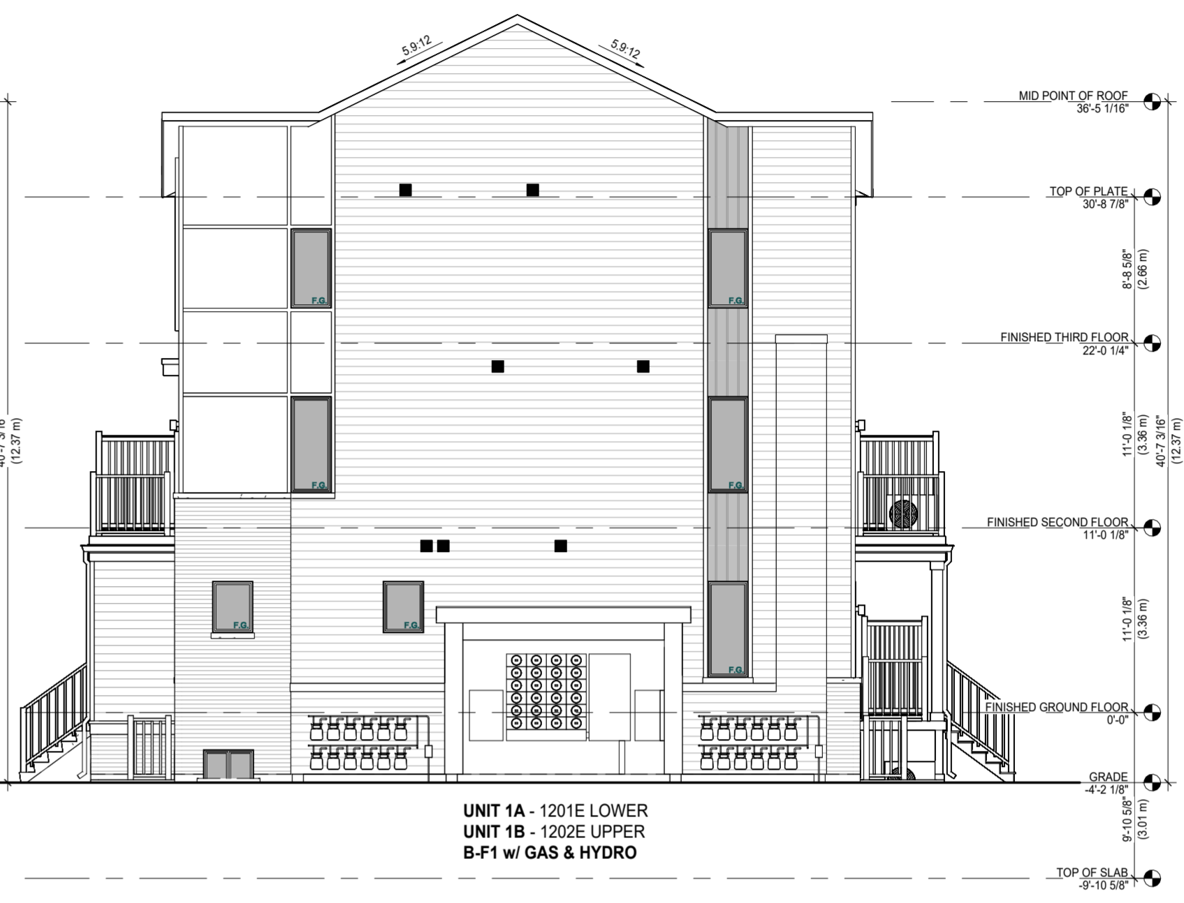
4 24 UNIT BLOCK - RIGHT ELEVATION B 1/8" = 1'-0"