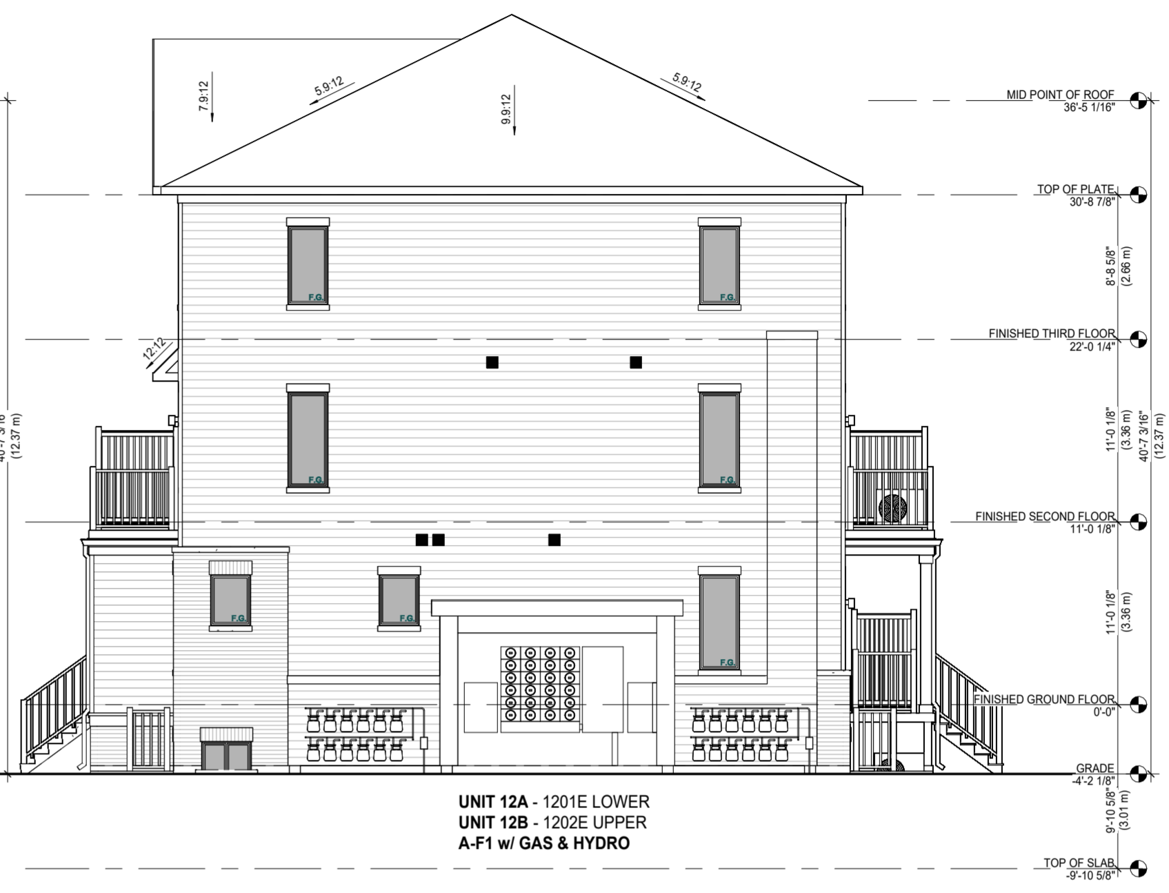
4 24 UNIT BLOCK - RIGHT ELEVATION A 1/8" = 1'-0"