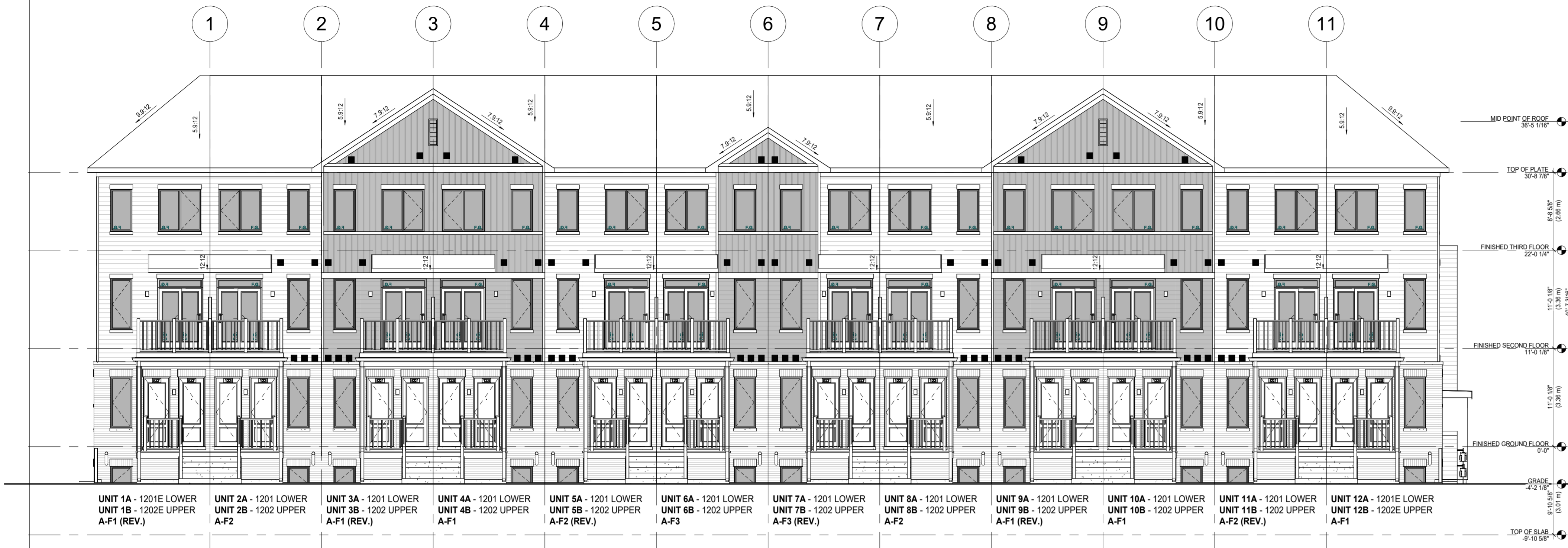
1 24 UNIT BLOCK - FRONT ELEVATION A 1/8" = 1'-0"

Blocks 2, 5, 6 and will have both Typical front and rear elevations. Elevation style to vary between blocks.