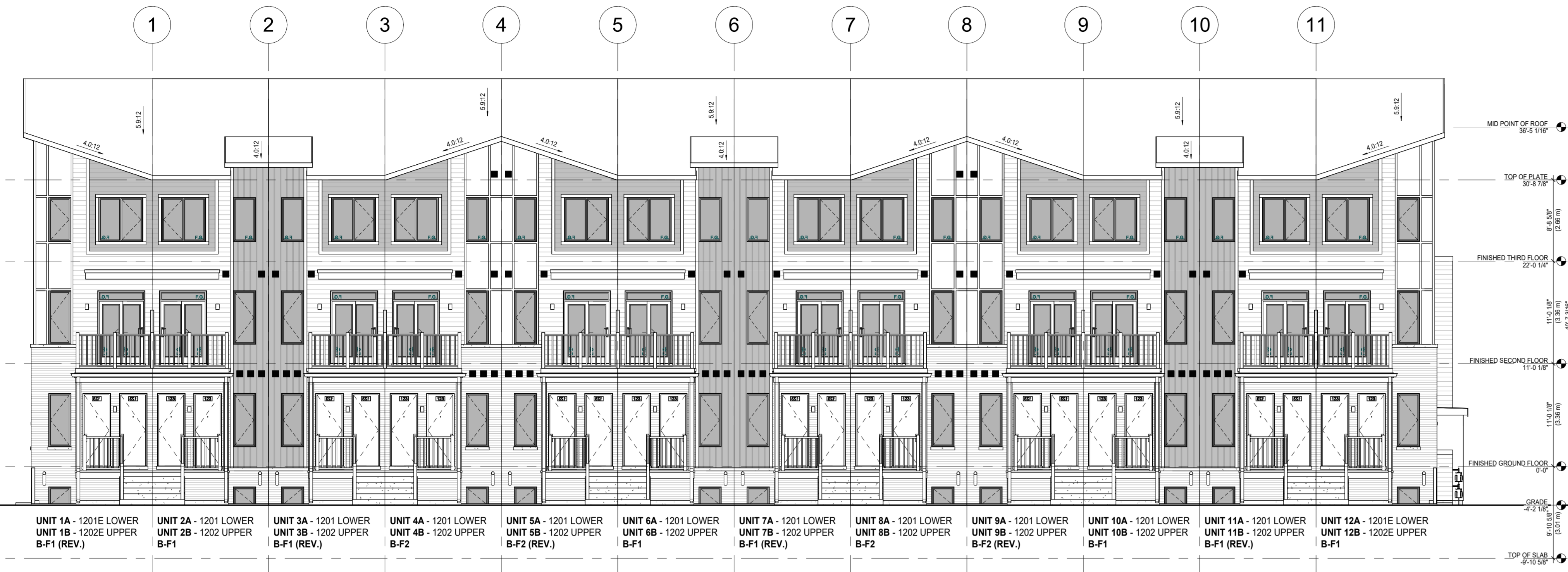
1 24 UNIT BLOCK - FRONT ELEVATION B 1/8" = 1'-0"

Blocks 2, 5, 6 and will have both Typical front and rear elevations. Elevation style to vary between blocks.