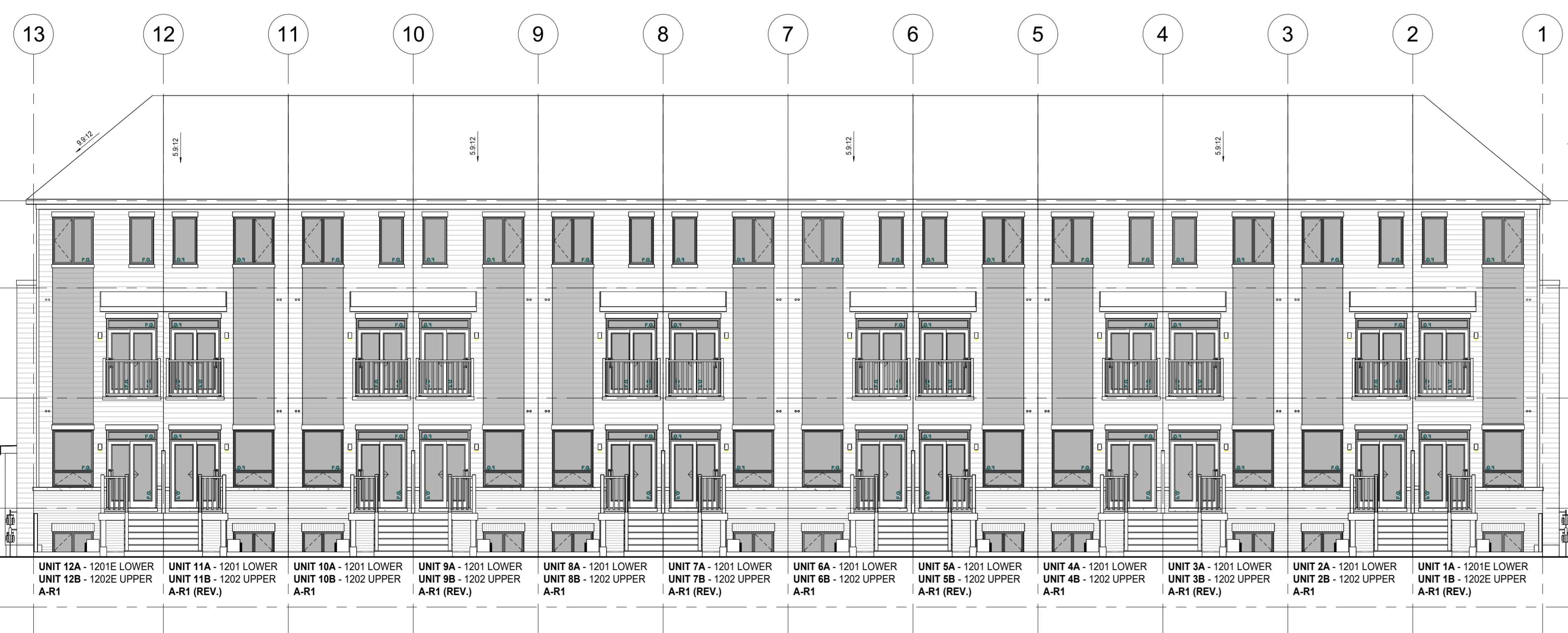
3 24 UNIT BLOCK - REAR ELEVATION A 1/8" = 1'-0"