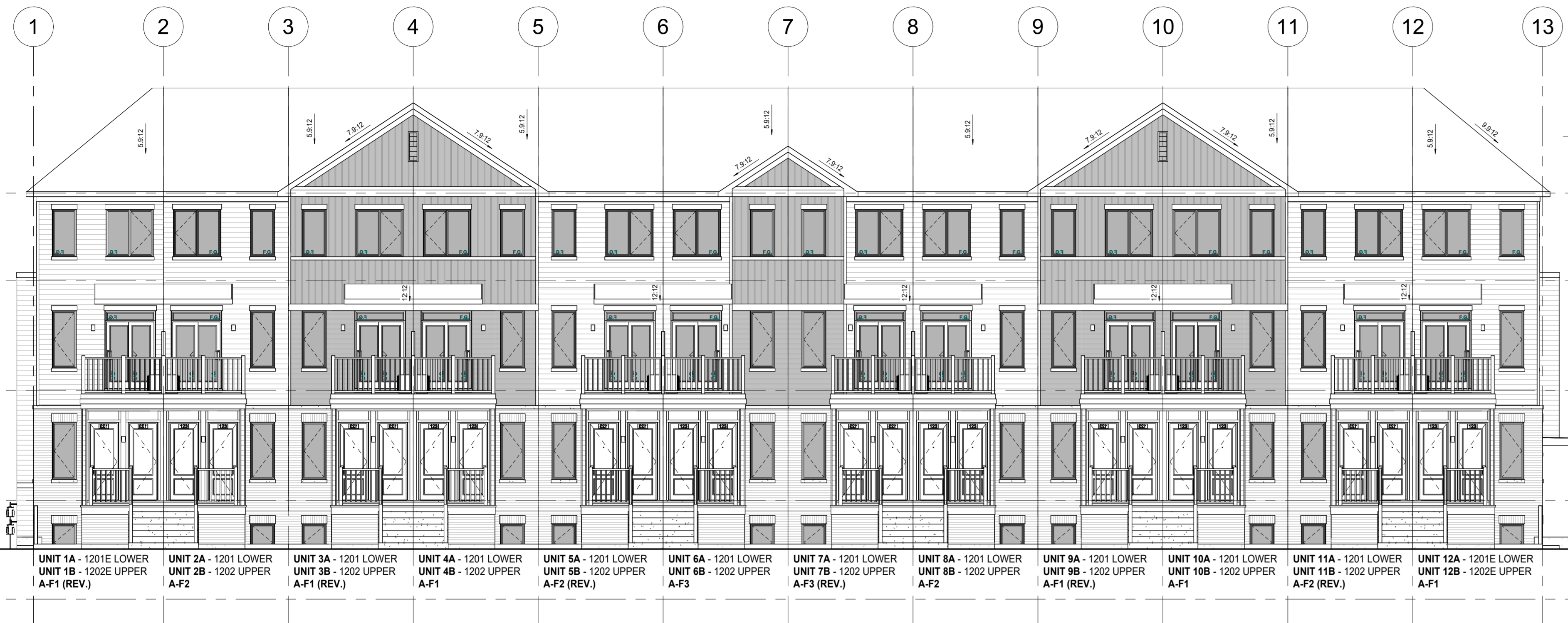
1 24 UNIT BLOCK - FRONT ELEVATION A 1/8" = 1'-0"

Block elevations are to vary between the provided two options Option 1 and Option 2.