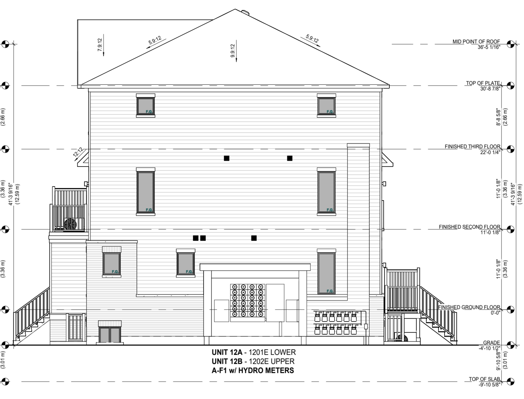
2 24 UNIT BLOCK - RIGHT ELEVATION A 1/8" = 1'-0"