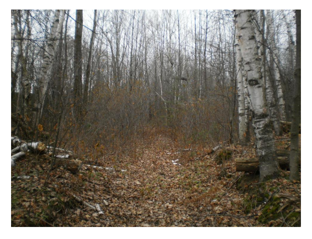
Photo 12 – Another access lane in the east portion of the site. View looking west (December 4<sup>th</sup>, 2017)