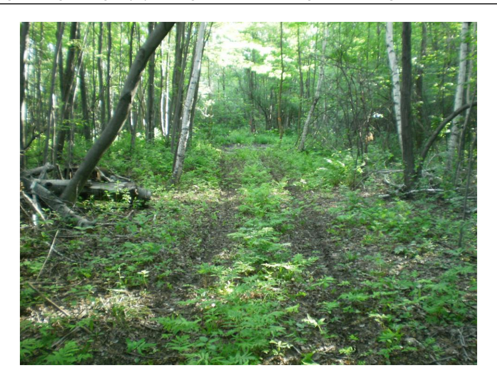
Photo 11 – Many access lanes are on the site. This example is in the southwest portion, with view looking west (June 20^{th} , 2018)