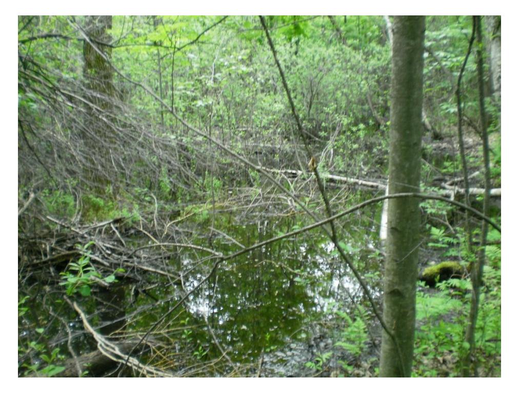
Photo 2 – Standing water in another excavation area. This example is in the south-central portion of the site (May 27^{th} , 2018)