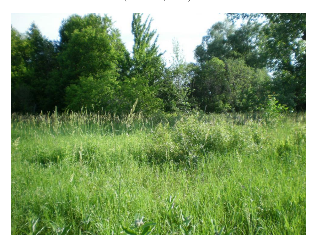
Photo 14 - Cultural meadow in the southeast corner of the site north of Navan Road. View looking north to the southeast edge of maple swamp (June 20<sup>th</sup>, 2018)