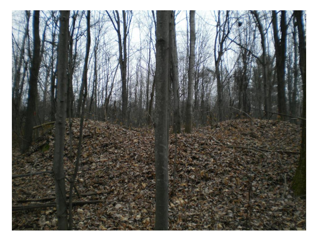
Photo 10 – Another example of the spoil piles, in the southeast portion of the site (December 4^{th} , 2017)