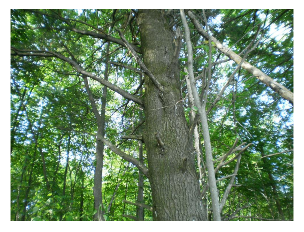
Photo 8 – Mature white pine in the northeast portion of the site (June 20th, 2018)