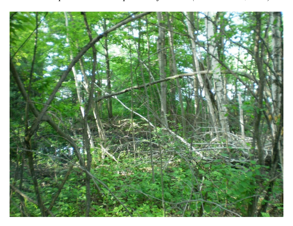
Photo 4 - Windthrow was common in the west portion of the site (June 20<sup>th</sup>, 2018)