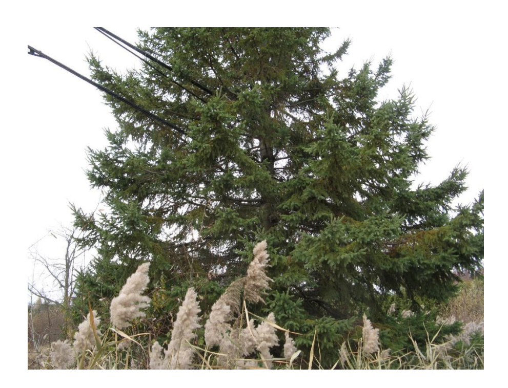
Photo 17 – White spruce along the southeast edge of the site ('Tree A'). This appears to be a coowned tree with the Page Road allowance. View looking northwest