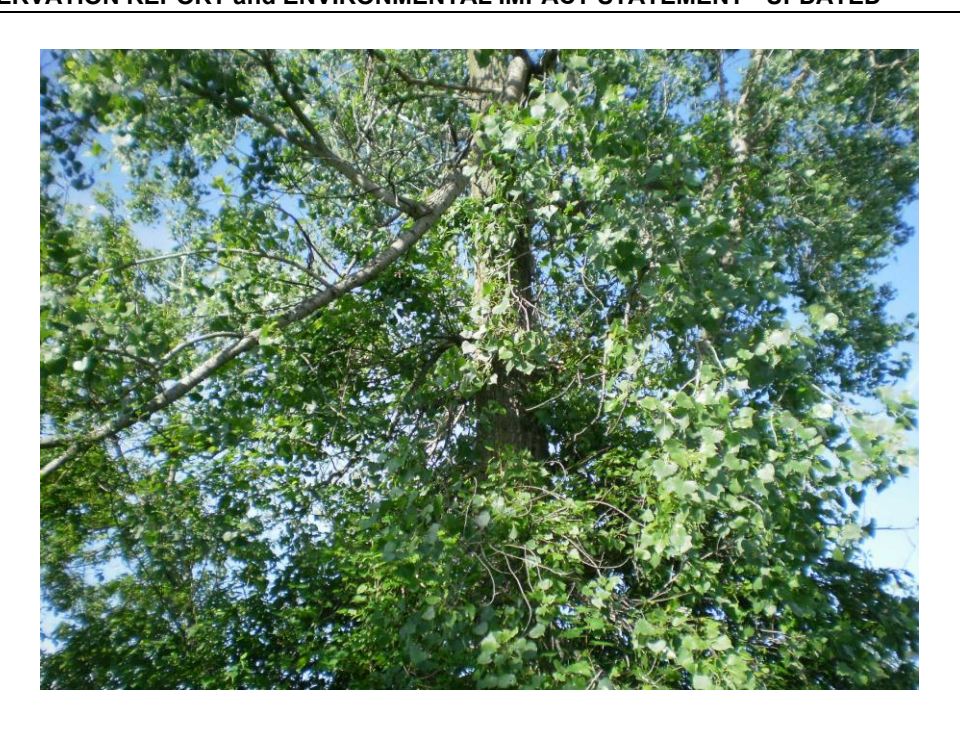
Photo 15 - Mature trembling aspen in the northeast portion of the cultural meadow in the southeast corner of the site (June 20<sup>th</sup>, 2018)