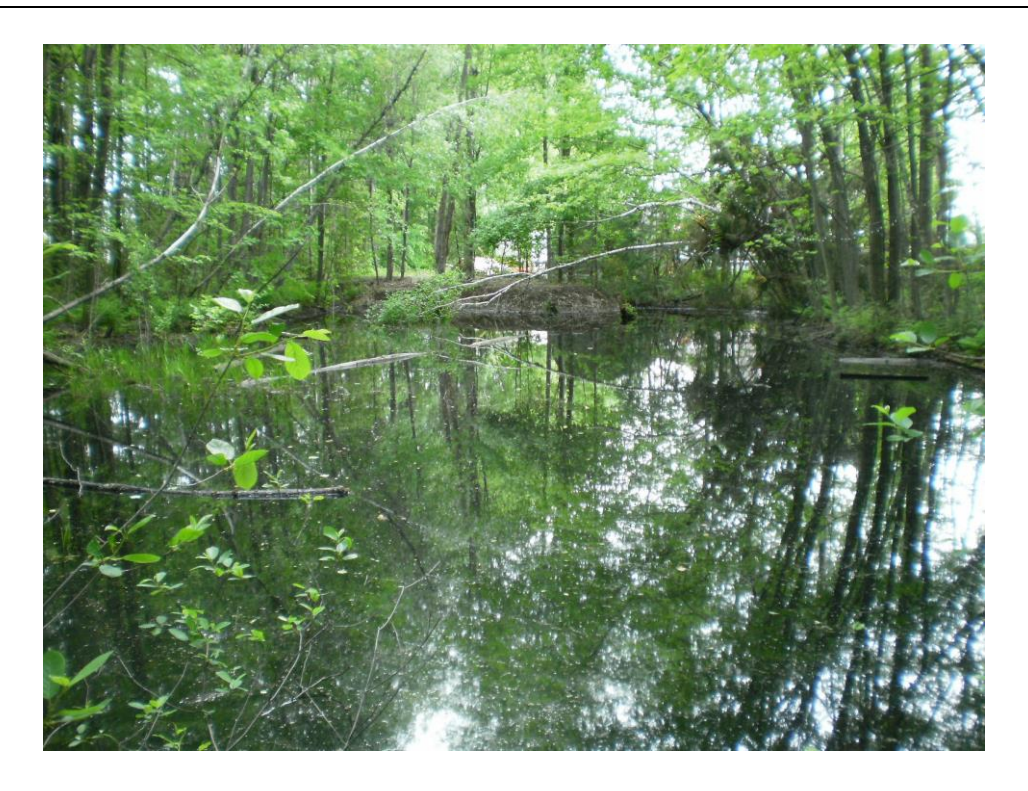
Photo 1 – One of the larger areas of standing water. This example is in the northeast portion of the site (May 27^{th} , 2018).