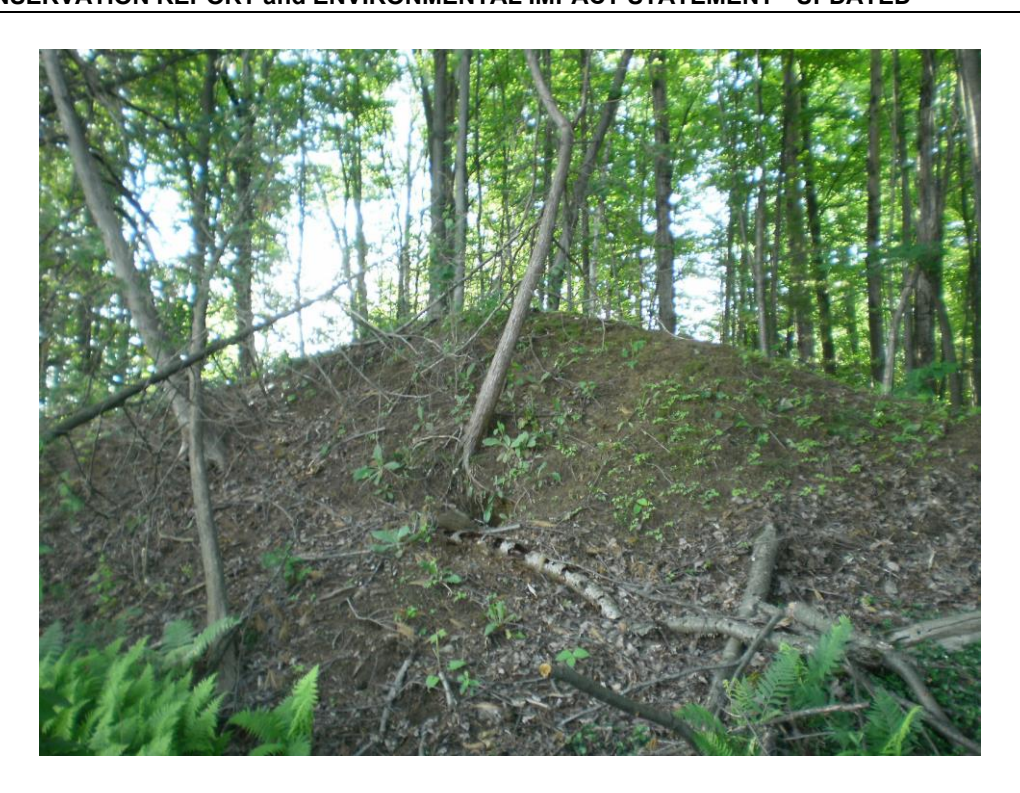
Photo 9 – Spoil piles from past sand extraction are common throughout the site. This example is in the northeast portion of the site (June 20^{th} , 2018)