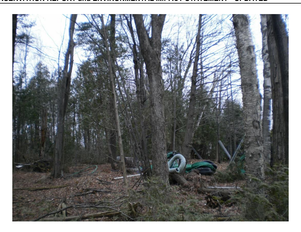
Photo 7 – Larger trees were more common in the northeast portion of the site. Debris was also common in this area (December 4<sup>th</sup>, 2017)