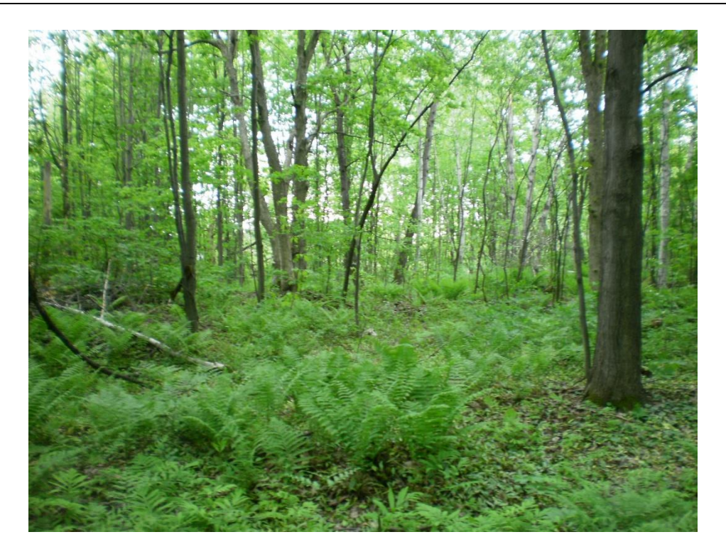
Photo 5 – Red maple swamp in the central-east portion of the site (May 27<sup>th</sup>, 2018)