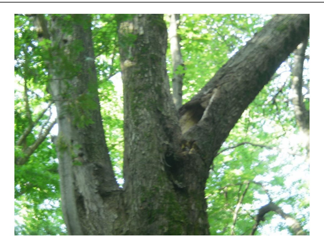
Photo 13 – Red maple with potential wildlife cavity in the northeast portion of the site (June 20^{th} , 2018)