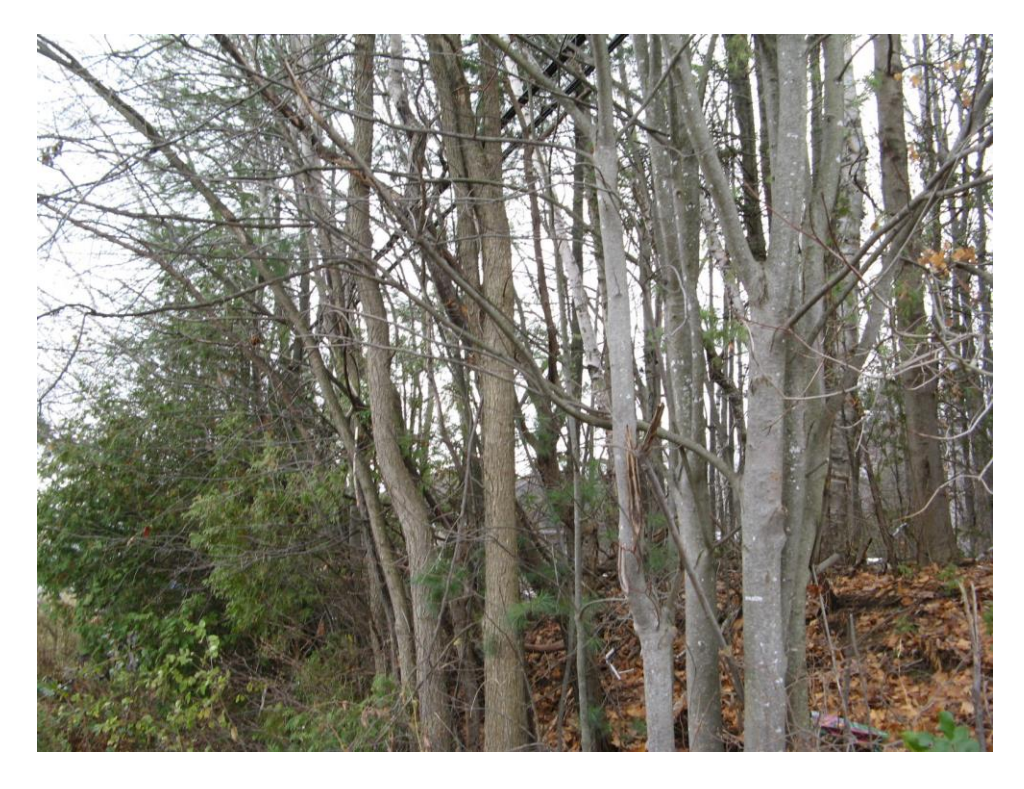
Photo 18 – Row of regenerating stems along and adjacent to the northeast edge of the site ('Trees B'). Most of the trees are within the Pagė Road allowance adjacent to the east edge of the site. View looking south