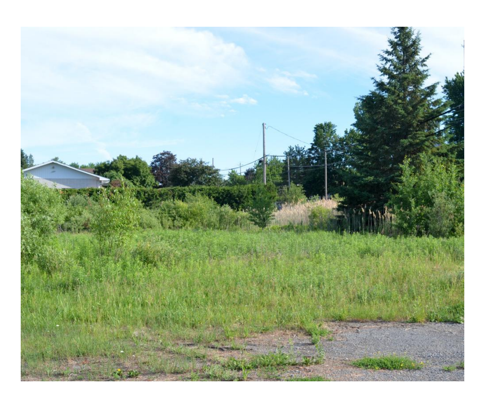
Photo 16 – Cultural meadow in the expanded site area in the southeast corner of the site. View looking north from north edge of gravel fill (June 10<sup>th</sup>, 2021)