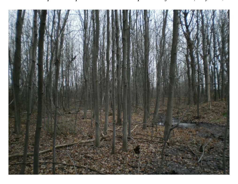
Photo 6 – Typical maple tree size, with white birch and trembling aspen present. This example is in the south-central portion of the site (December 4^{th} , 2017)