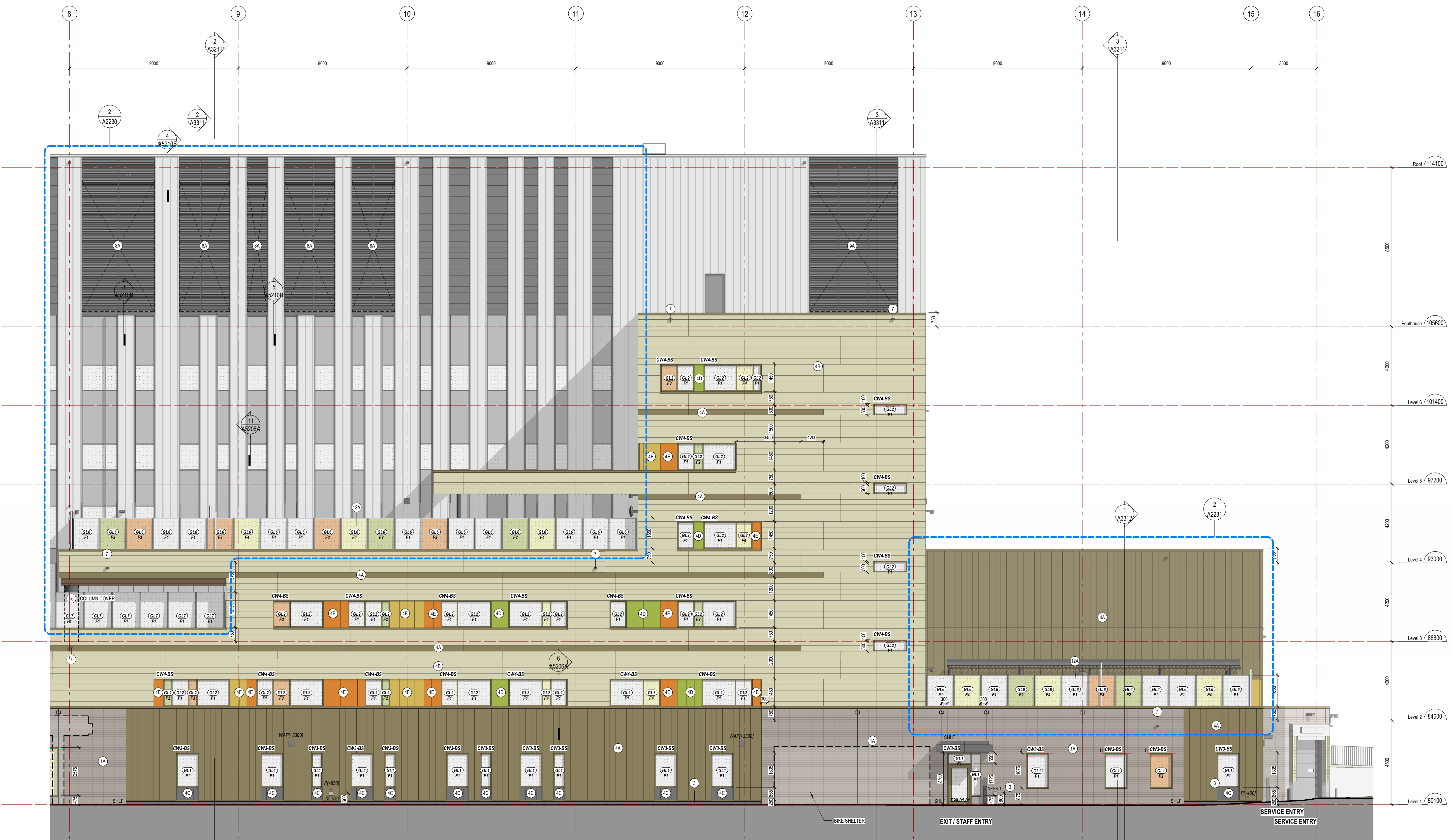
1 SOUTH ELEVATION - ZONE B A2231 1 : 100