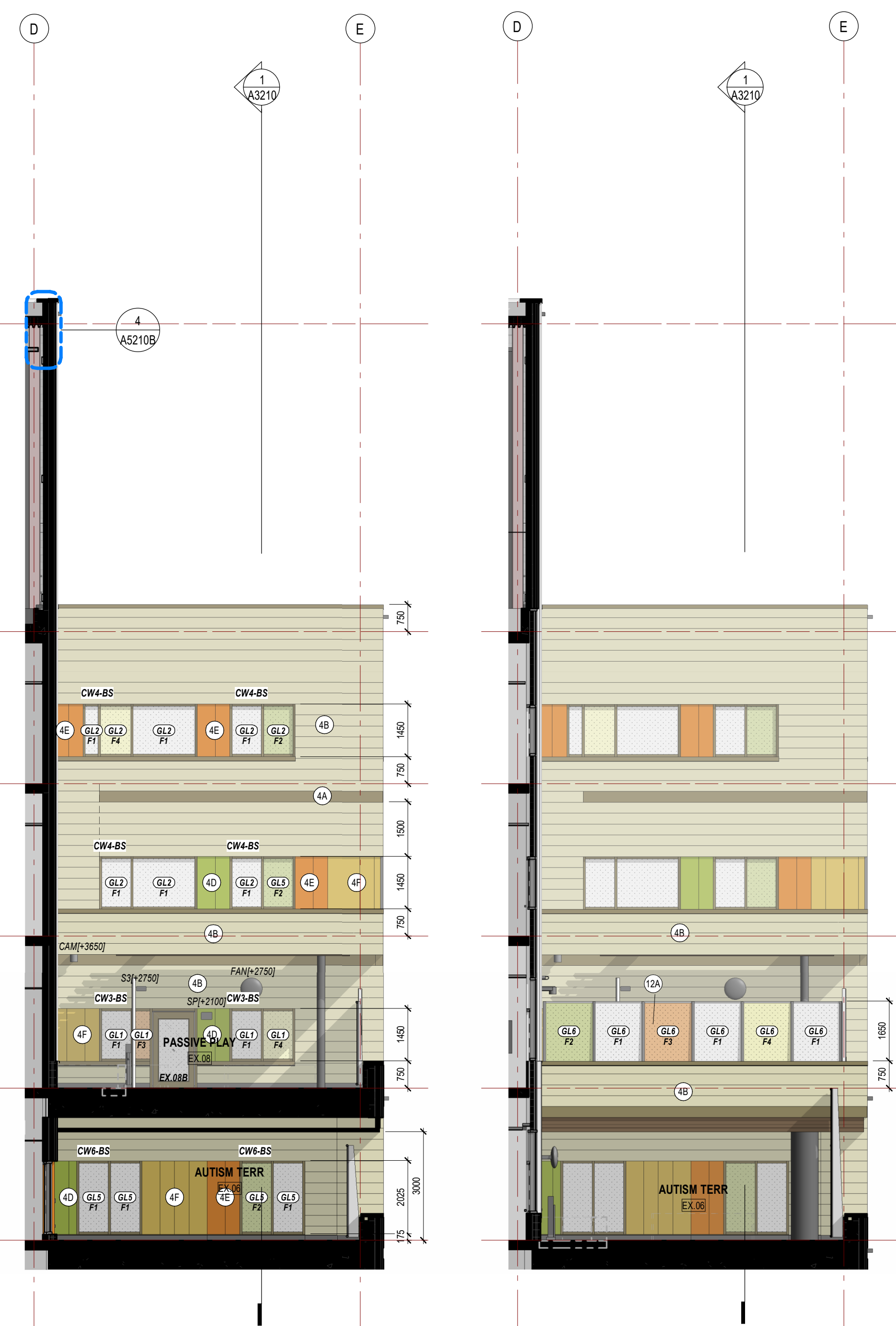
4 LEVEL 3 AUTISM & L4 PASSIVE PLAY TERRACE - EAST A2231 1 : 100 3 LEVEL 3 AUTISM TERRACE - EAST FACING A2231 1 : 100