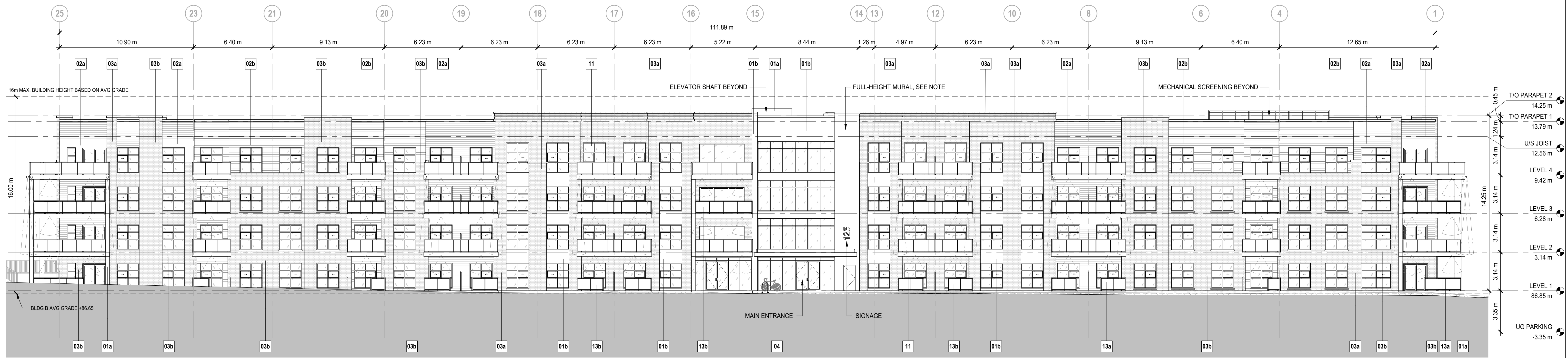
1 EAST ELEVATION - BUILDING B DP30-01-01 SCALE: 1:150