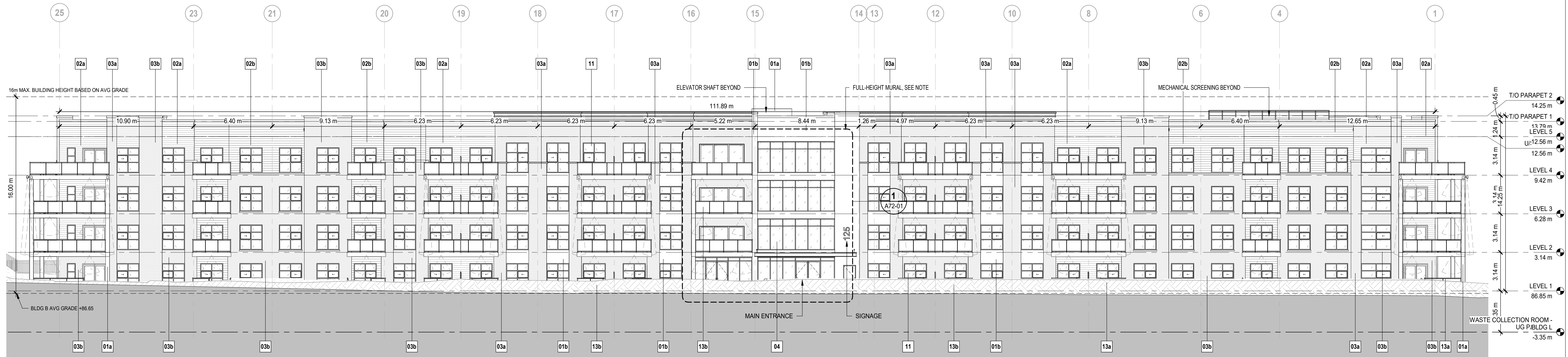
1 EAST ELEVATION - BUILDING B DP30-01-01 SCALE: 1:150