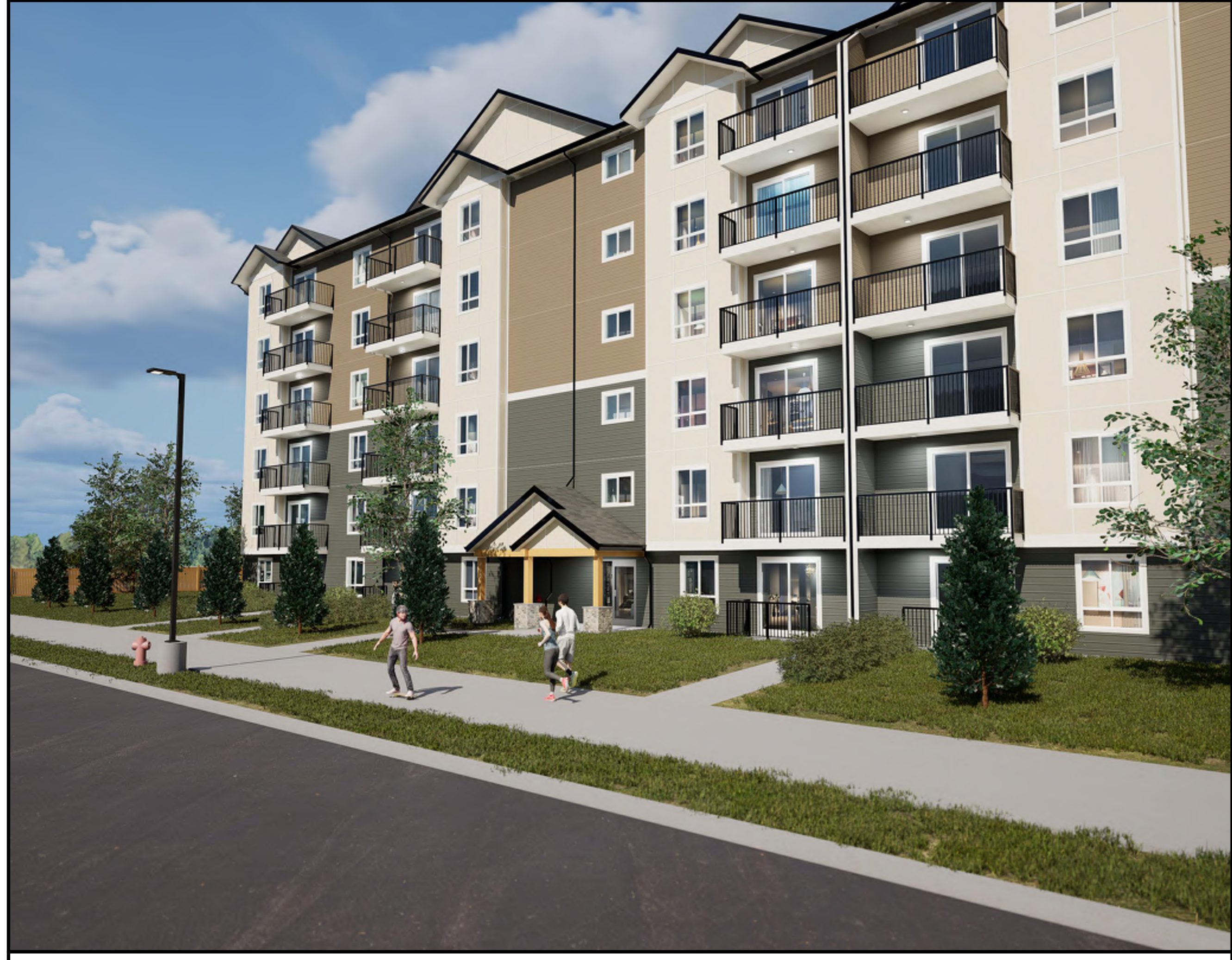
(3) STREET SIDE ENTRANCE