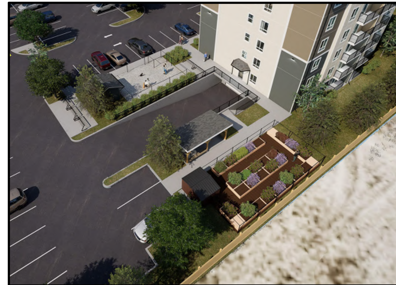
(5) AMENITY AREA