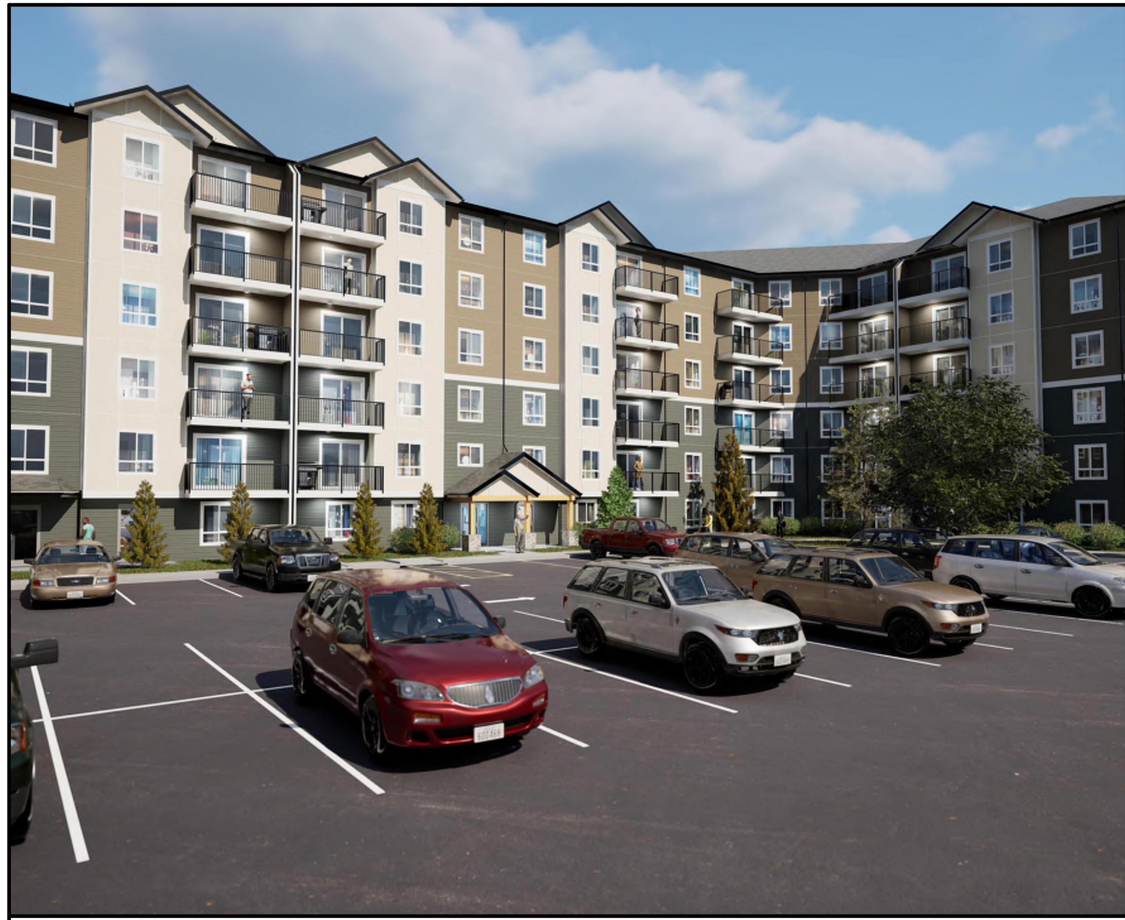
(1) MAIN ENTRANCE