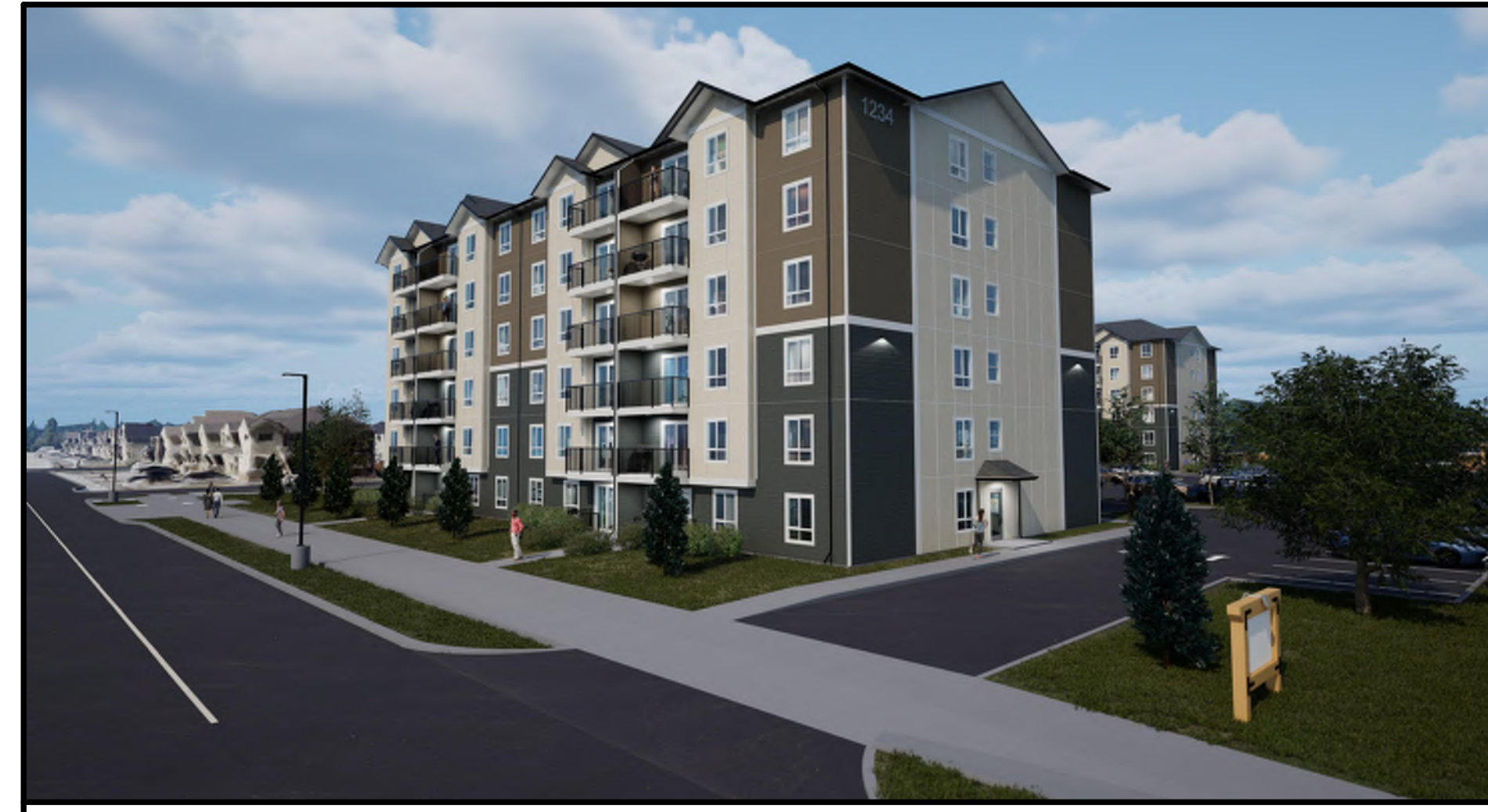
(4) SITE ENTRANCE FROM DERREEN AVE.