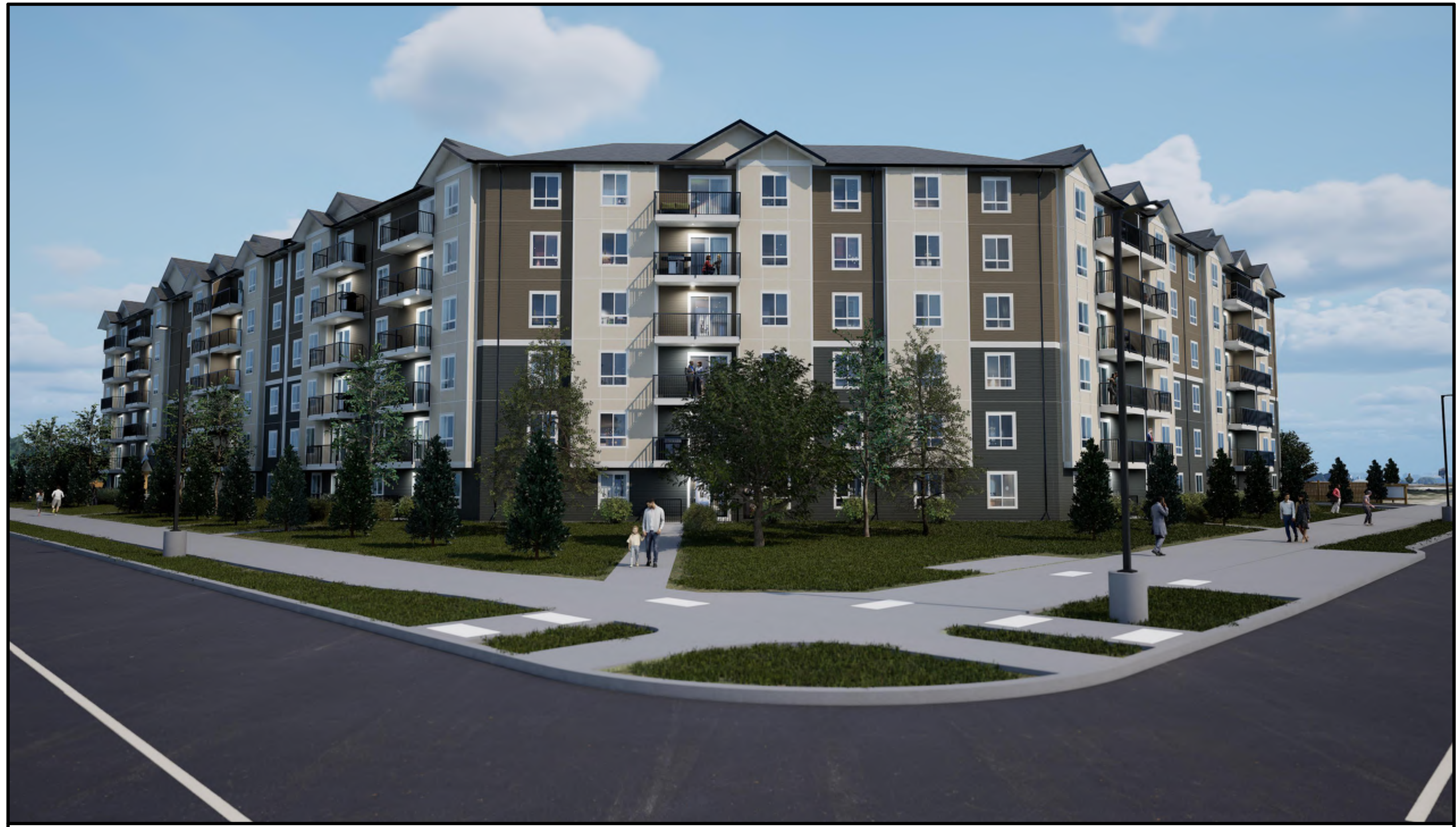
(2) SOUTH VIEW - CORNER OF CULDAFF RD. & DERREEN AVE.