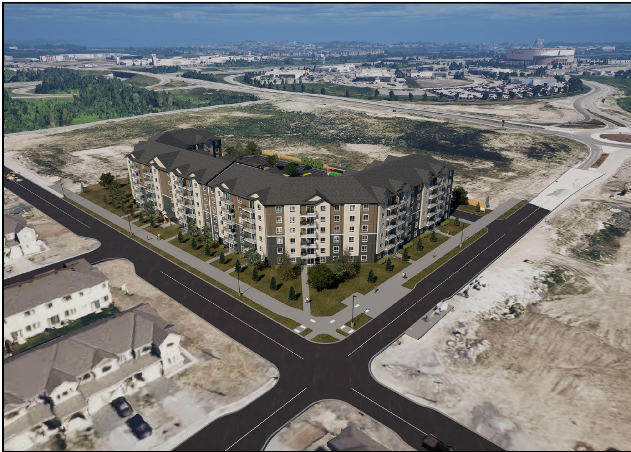
(3) NORTH VIEW