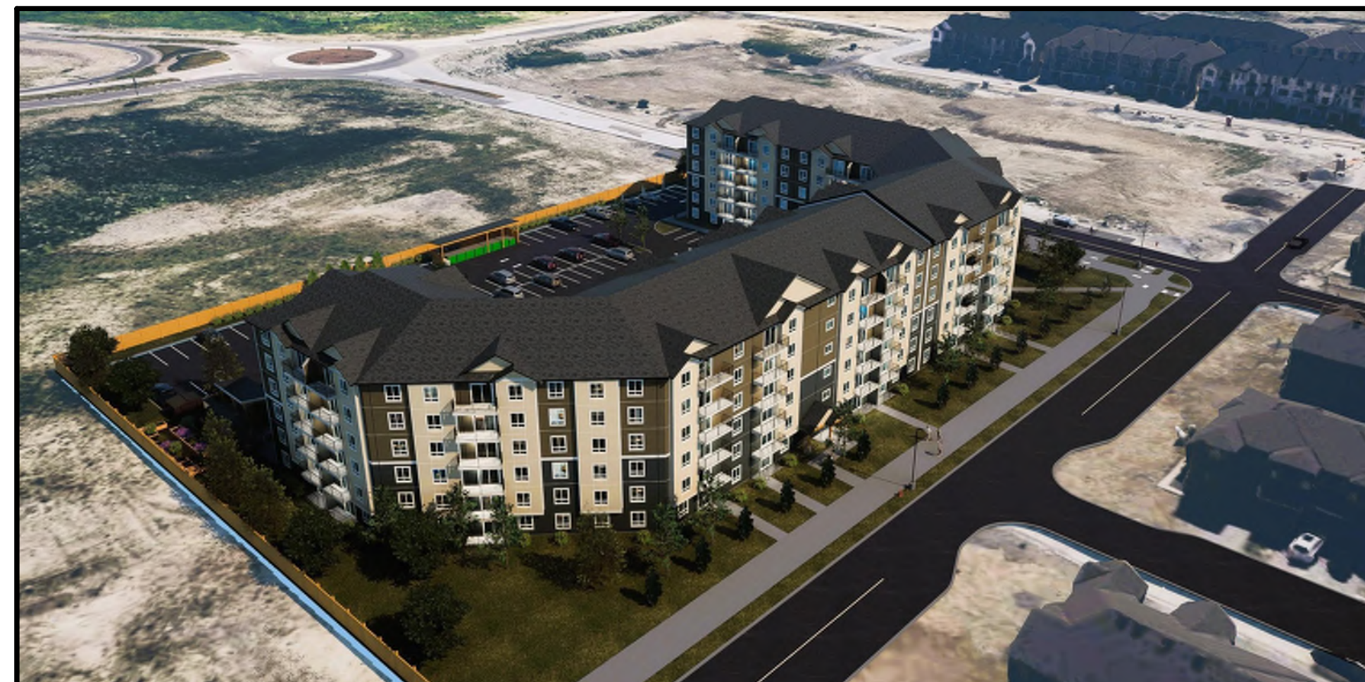
(4) EAST VIEW