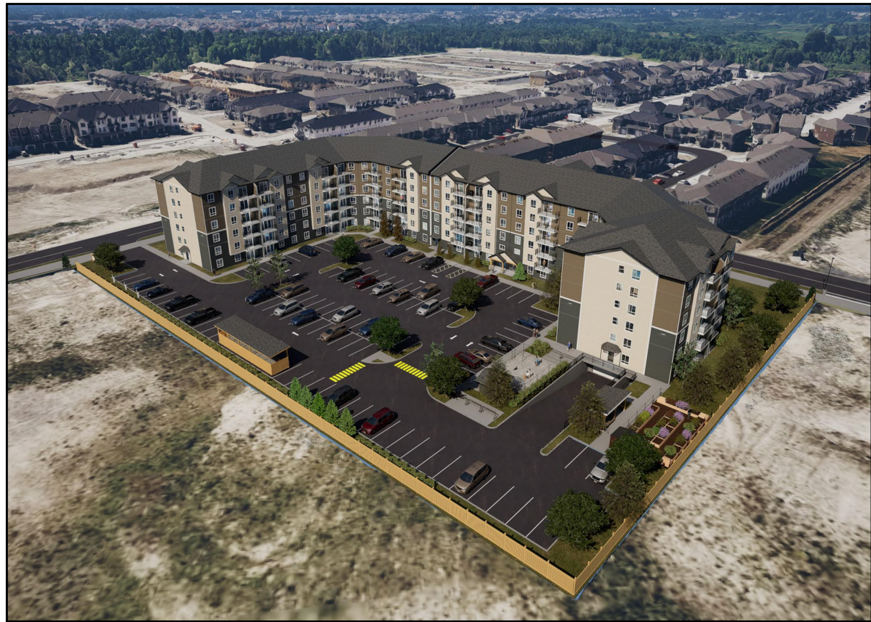
(2) SOUTH VIEW