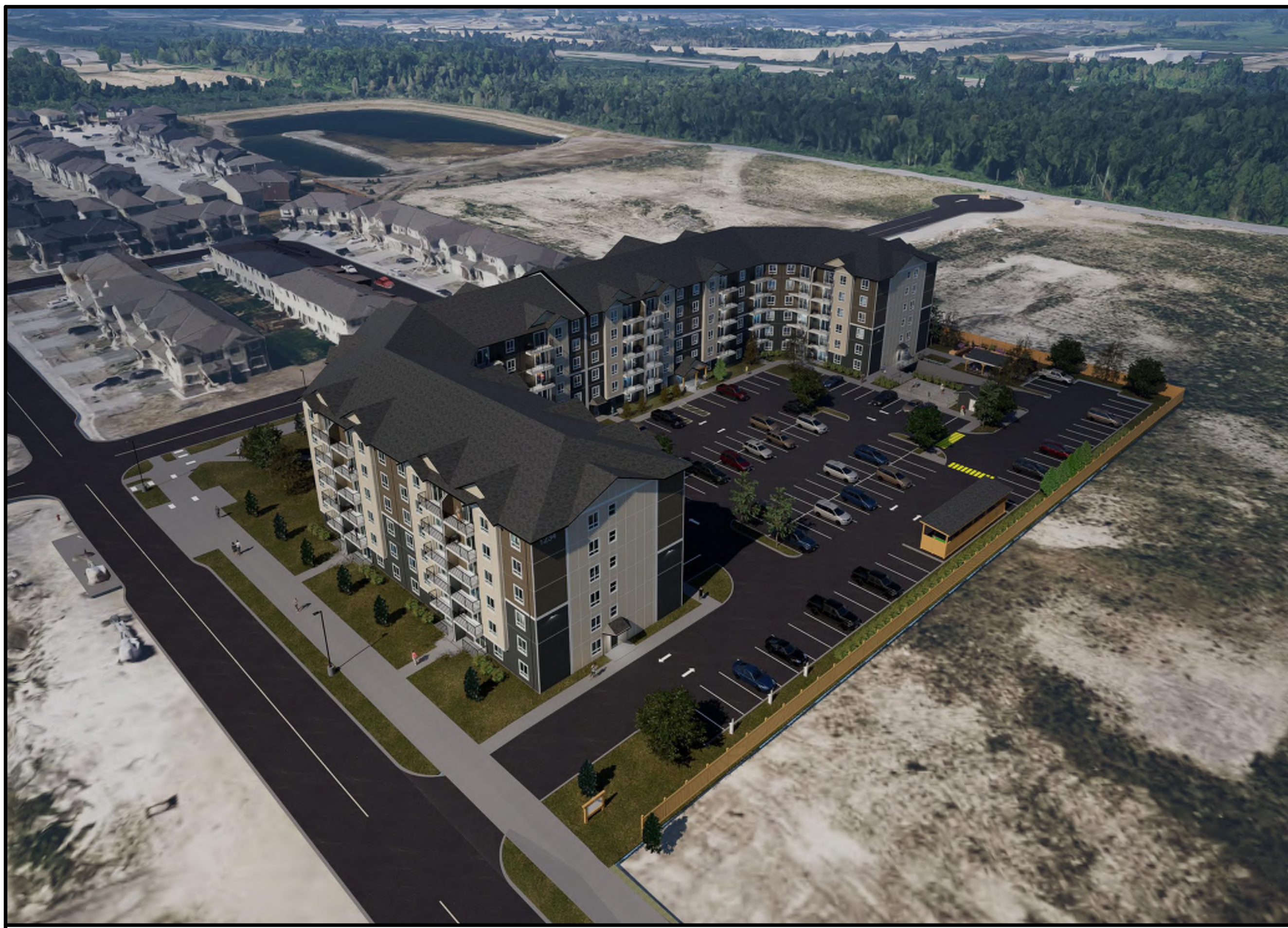
(1) WEST VIEW