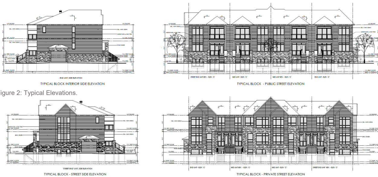
Figure 2: Typical Elevations.