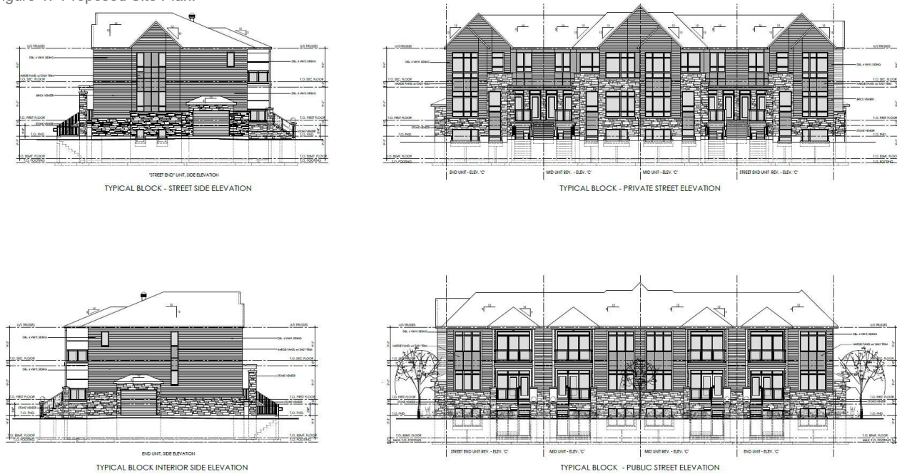
Figure 2: Typical Elevations.