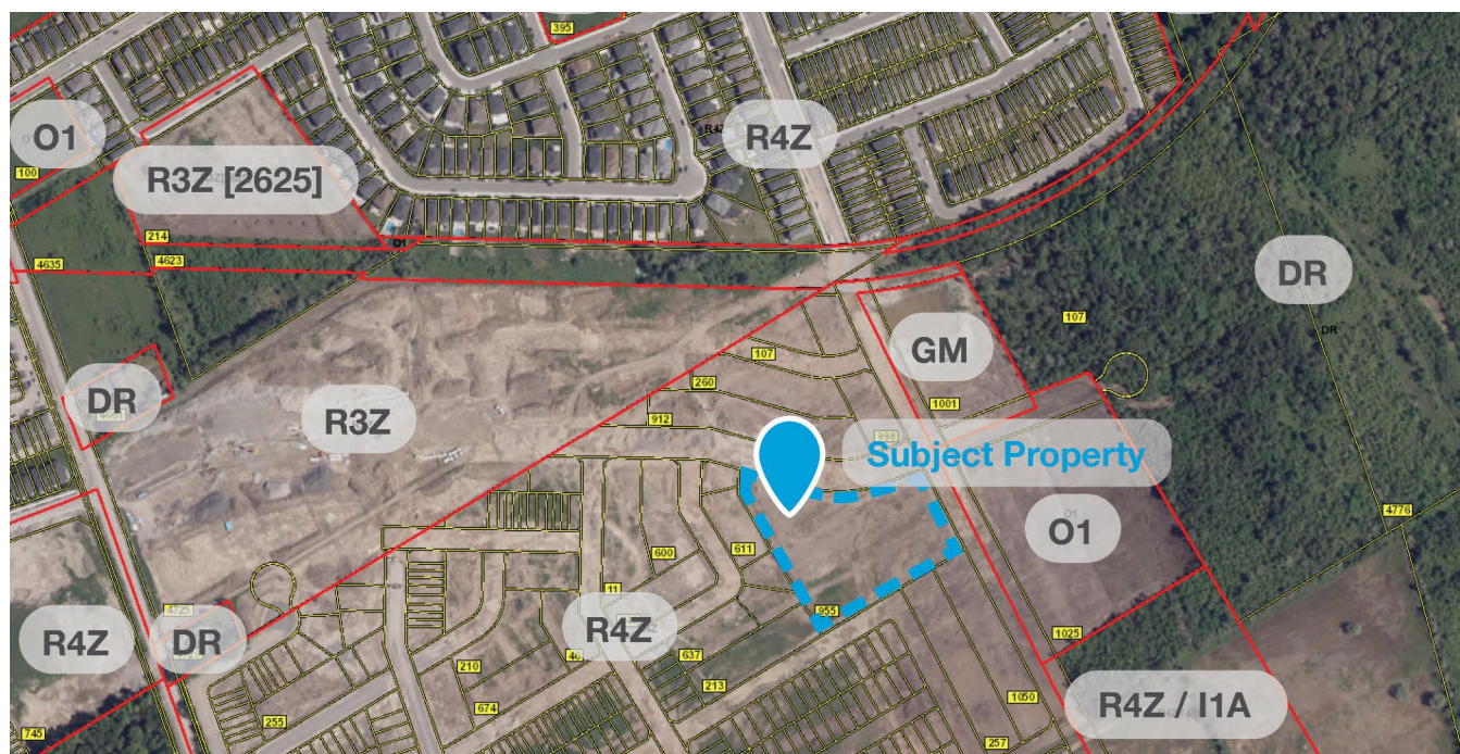
Figure 3: Aerial zoning map of the subject property.

The City of Ottawa Zoning By-law contains specific provisions relating to built form throughout different areas of the City. The subject site is identified as Residential Fourth Density, Subzone Z – R4Z. This zone permits a wide mix of residential building forms, ranging from detached to low-rise apartment dwellings at heights of up to four storeys. The subzone is specifically intended to support the innovative, denser “Missing Middle” housing typologies identified in the Official Plan and Secondary Plan.