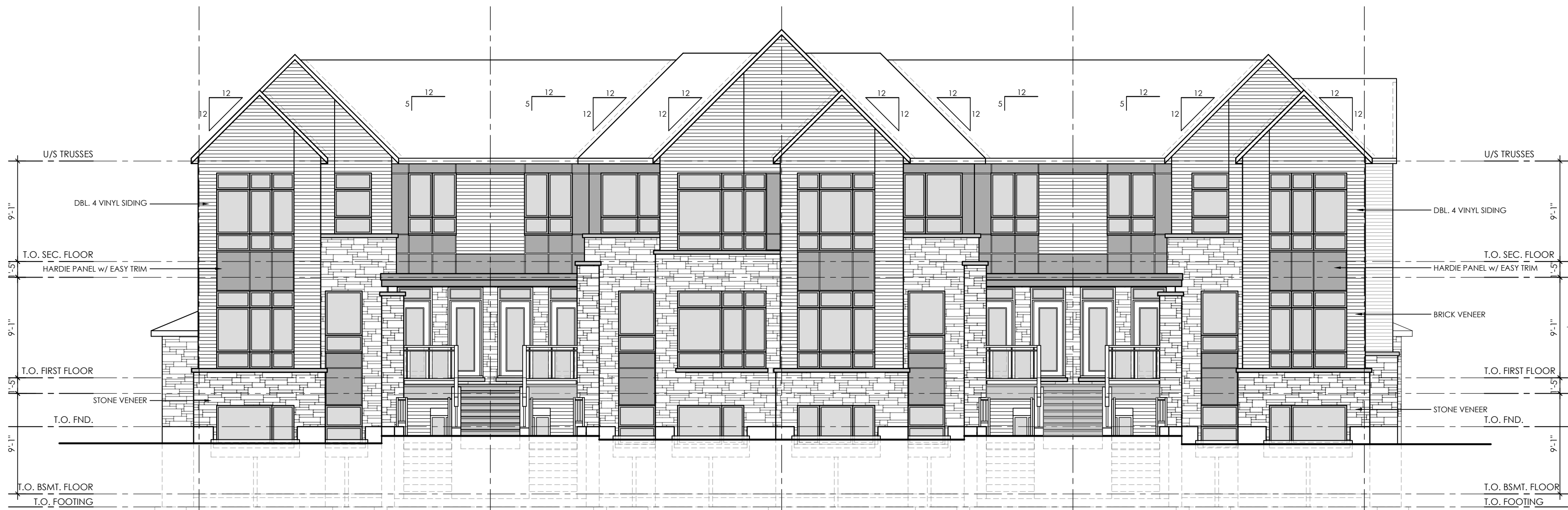
END UNIT - ELEV. 'C' MID UNIT REV. - ELEV. 'C' MID UNIT - ELEV. 'C' STREET END UNIT REV. - ELEV. 'C' TYPICAL BLOCK - PRIVATE STREET ELEVATION