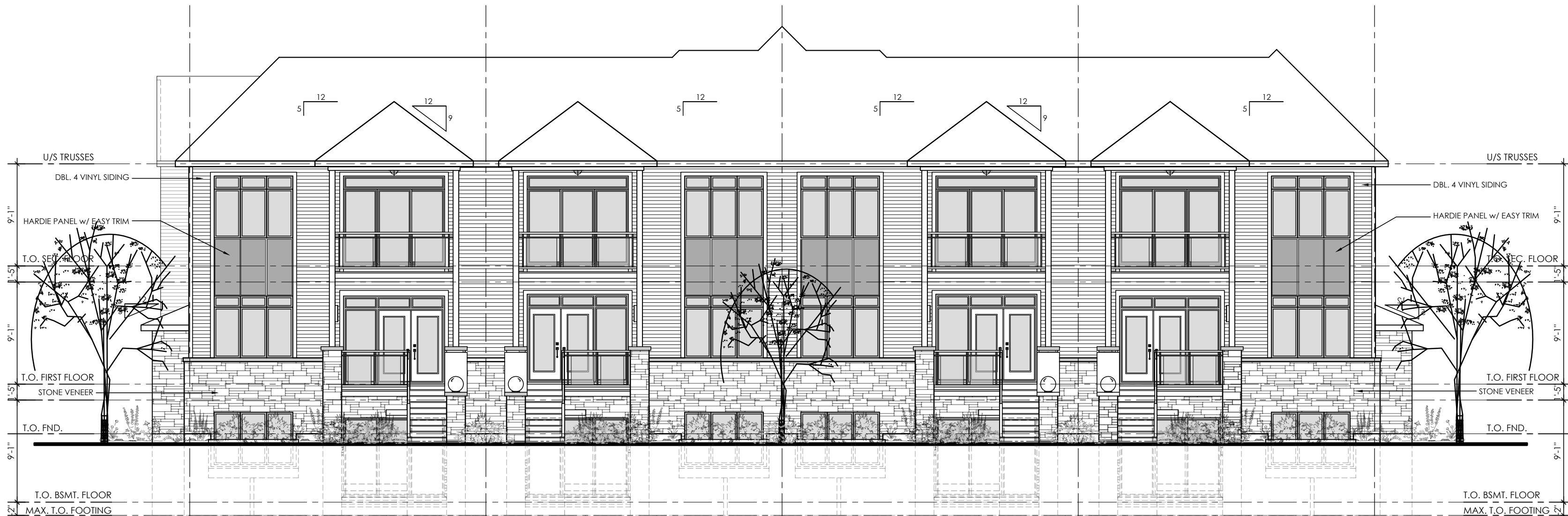
STREET END UNIT REV. - ELEV. 'C' MID UNIT - ELEV. 'C' MID UNIT REV. - ELEV. 'C' END UNIT - ELEV. 'C' TYPICAL BLOCK - PUBLIC STREET ELEVATION