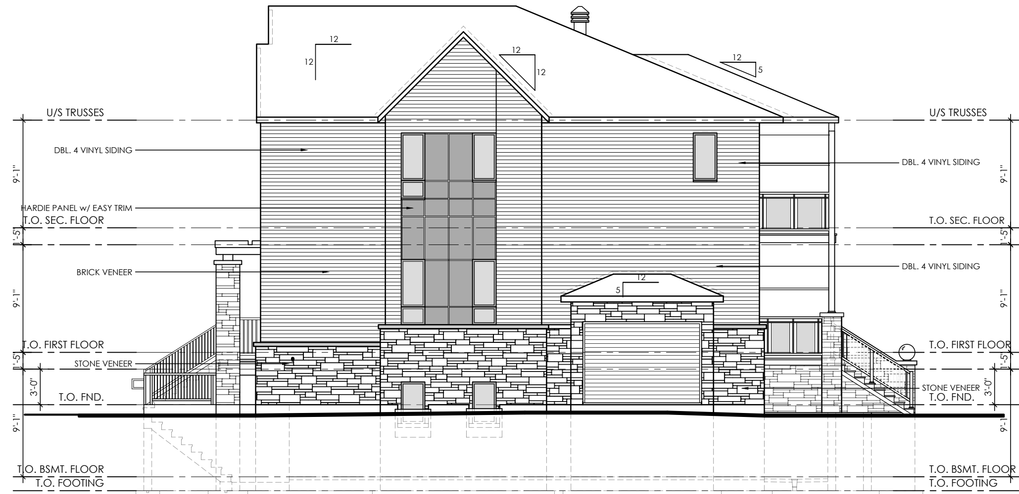
"STREET END" UNIT, SIDE ELEVATION TYPICAL BLOCK - STREET SIDE ELEVATION