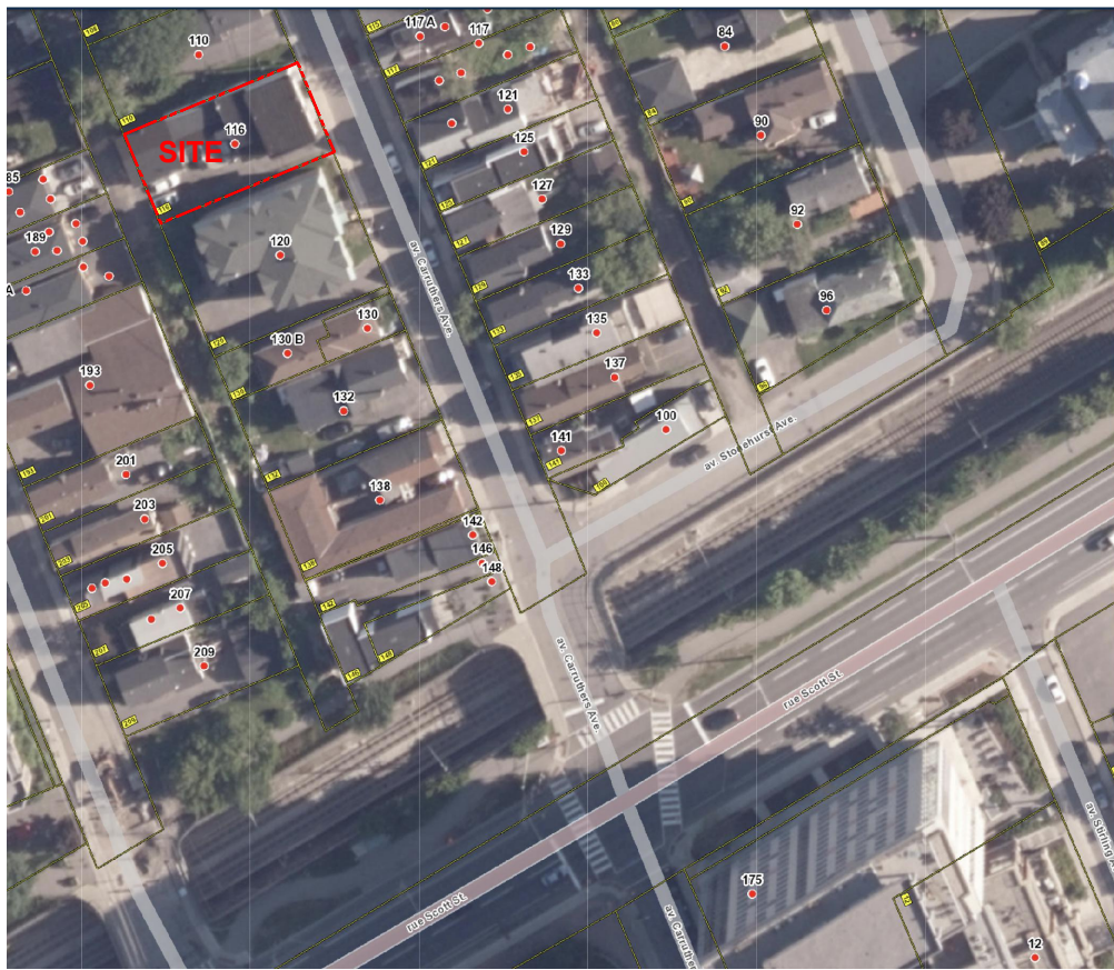
KEY PLAN: NTS