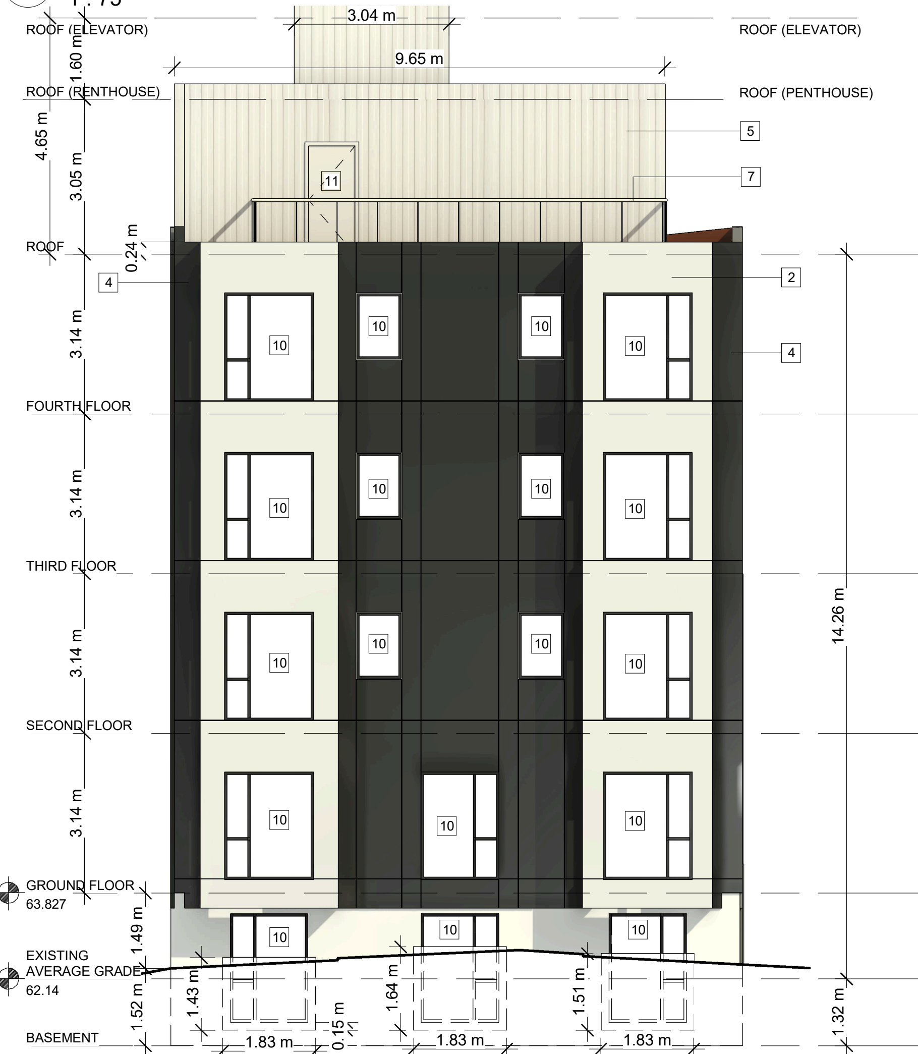
3 Rear ( West) Elevation 1 : 75