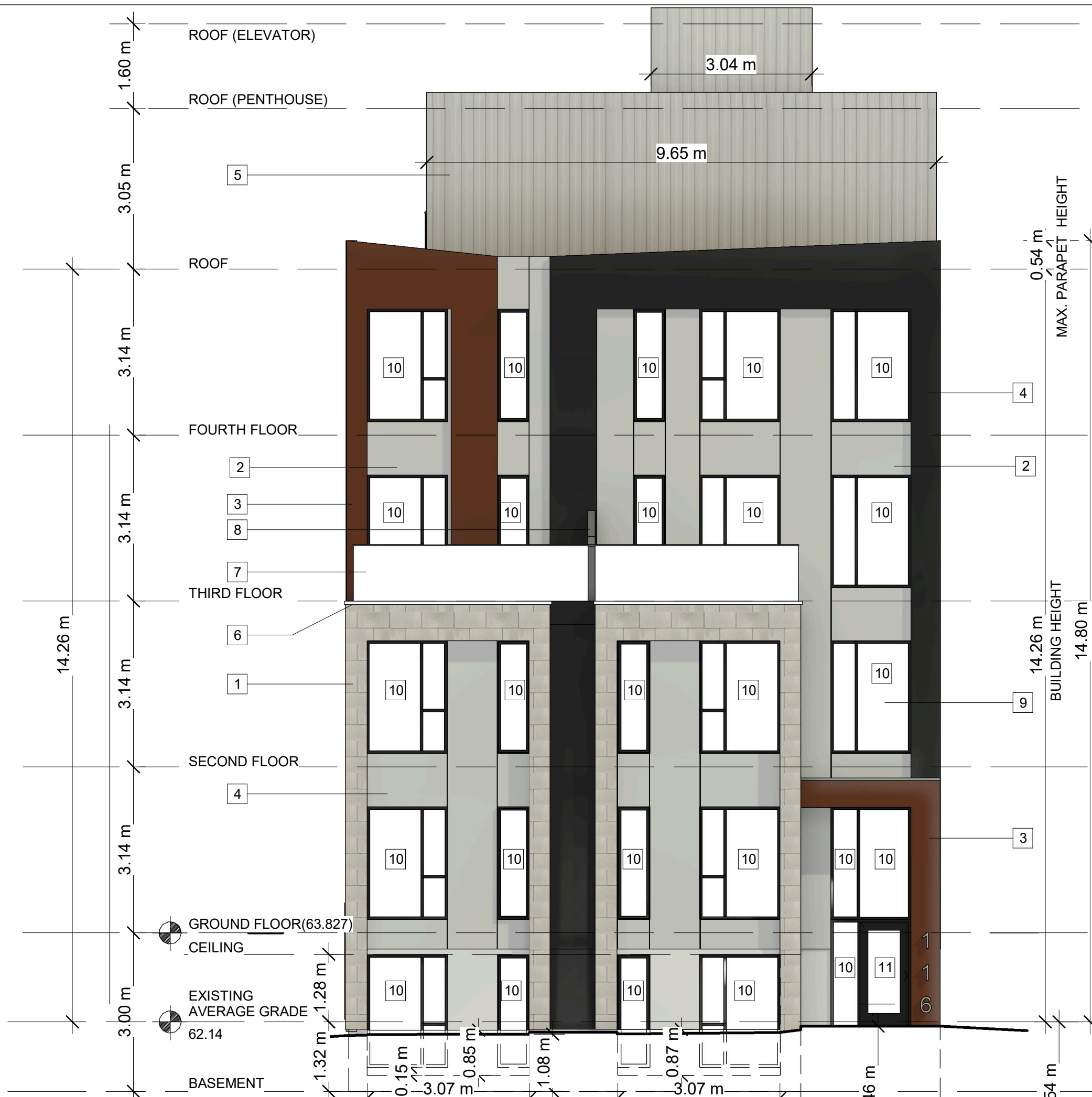
1 Front (East) Elevation 1 : 75