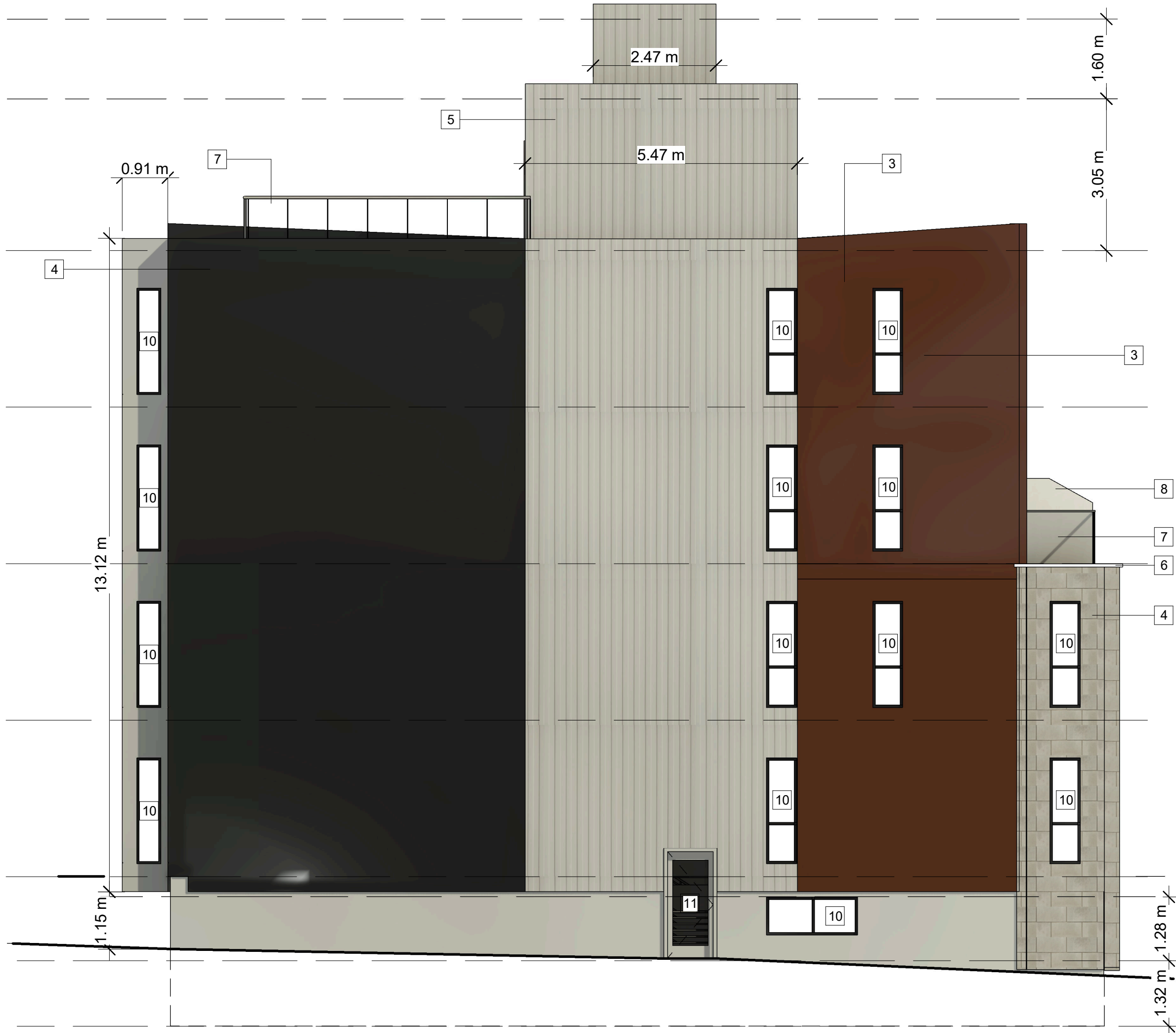
4 Side ( South) Elevation 1 : 75