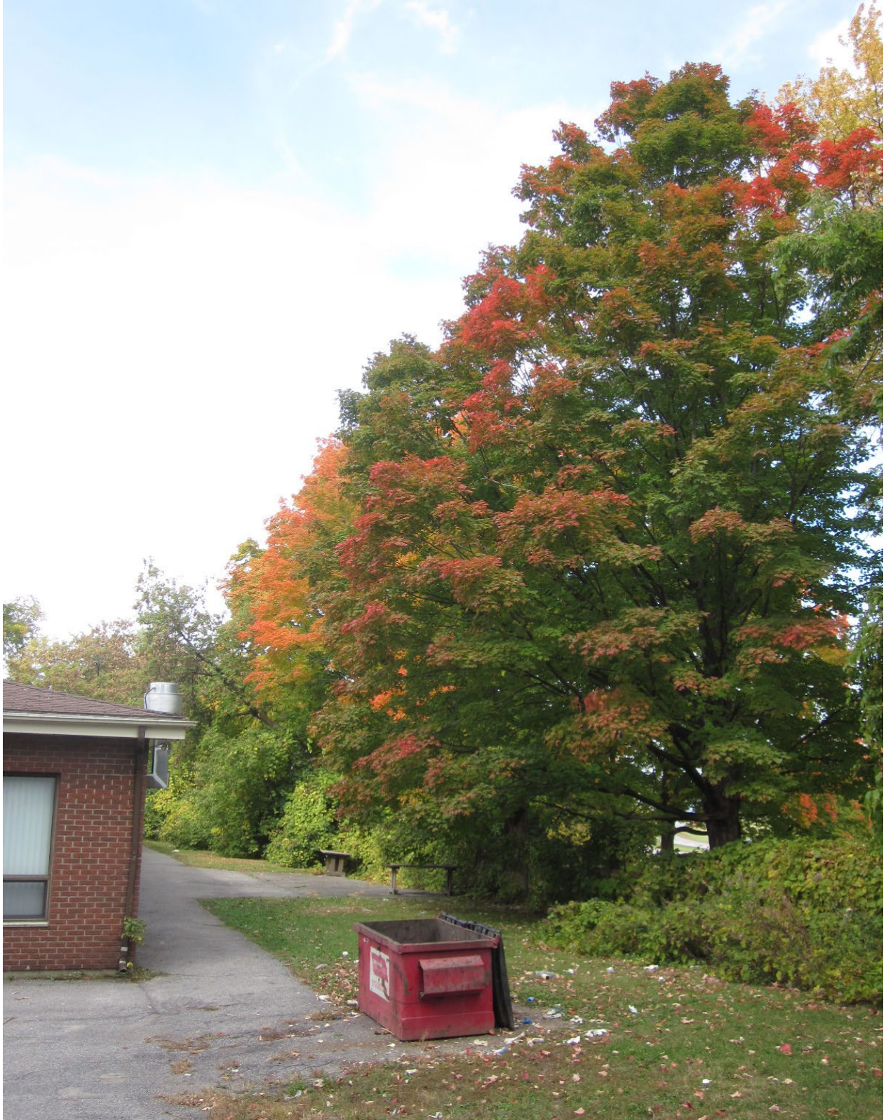
Picture 6. NCC maples in relation to existing building at 2475 Regina Street. A landscape buffer of approximately the same width as existing is proposed between the new building and the shared property line.