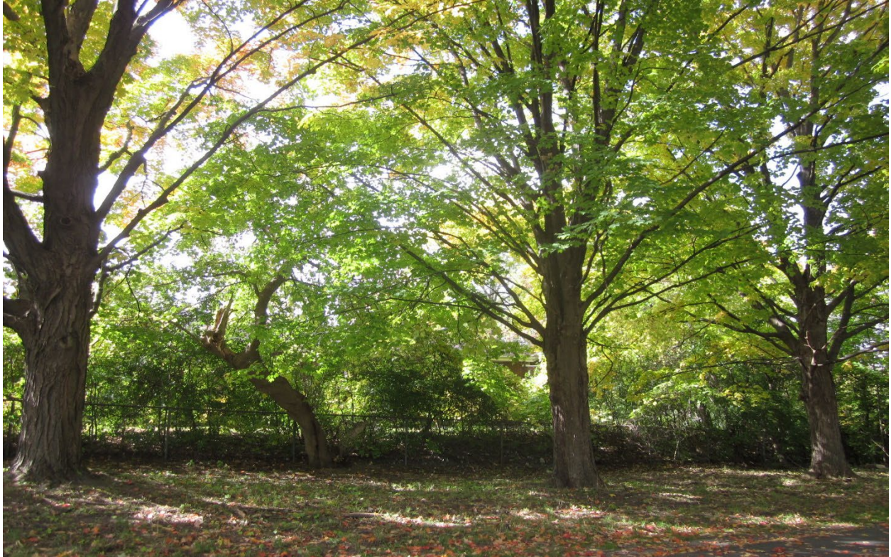
Picture 4. Trees #8-11 (right to left) on NCC land adjacent to 2475 Regina Street