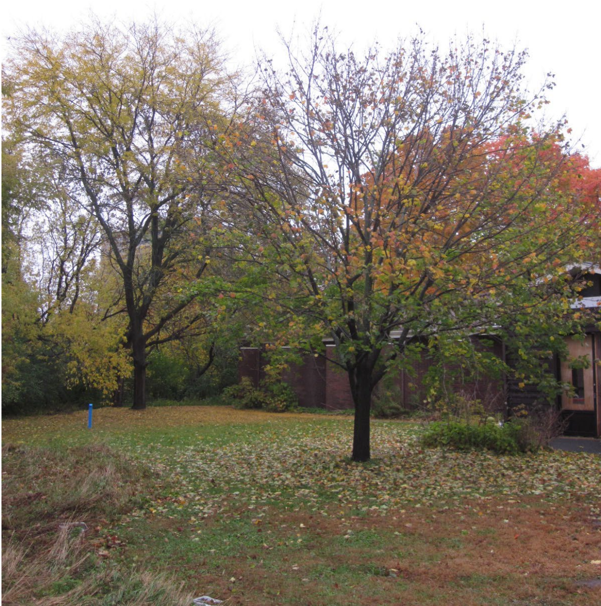
Picture 3. Trees #22 (right) and #23 (left background) at 2475 Regina Street