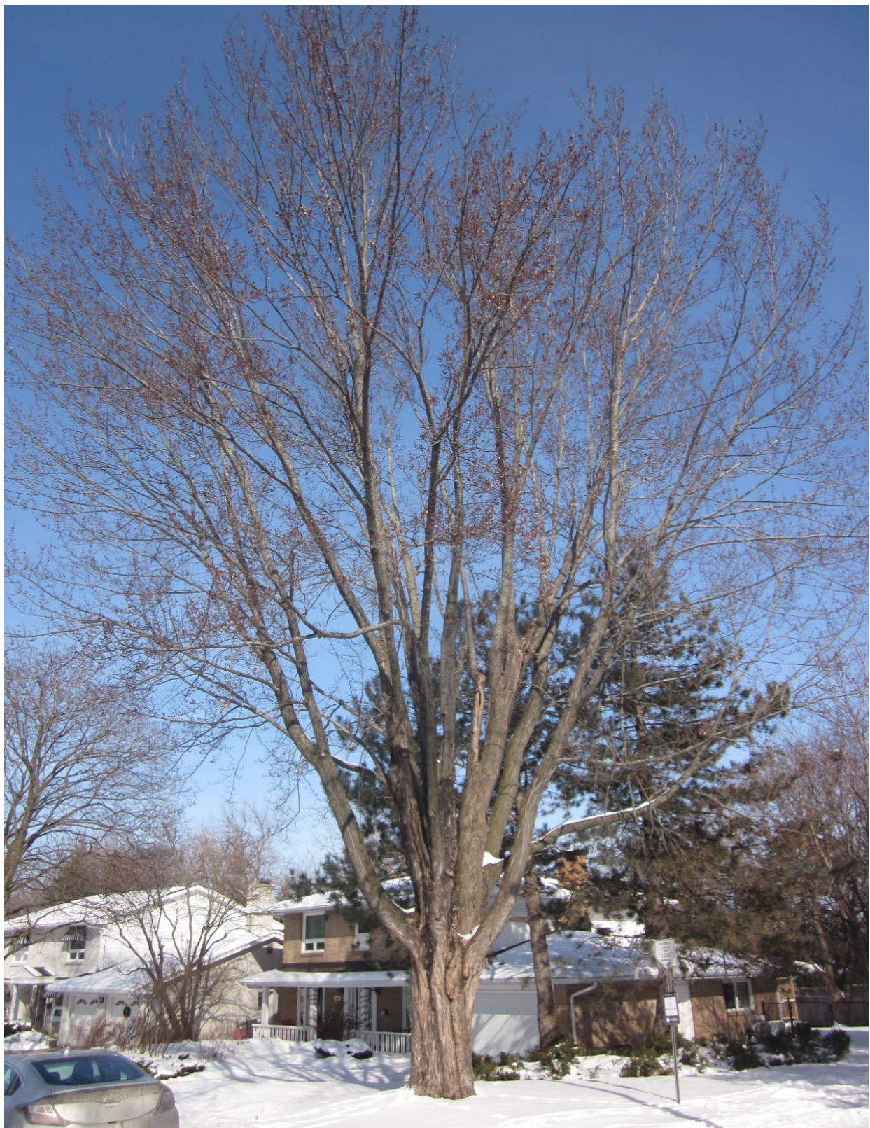
Picture 7. Tree #36, silver maple located on City of Ottawa property. To avoid root loss the proposed watermain is to be bored beneath tree's critical rooting zone.