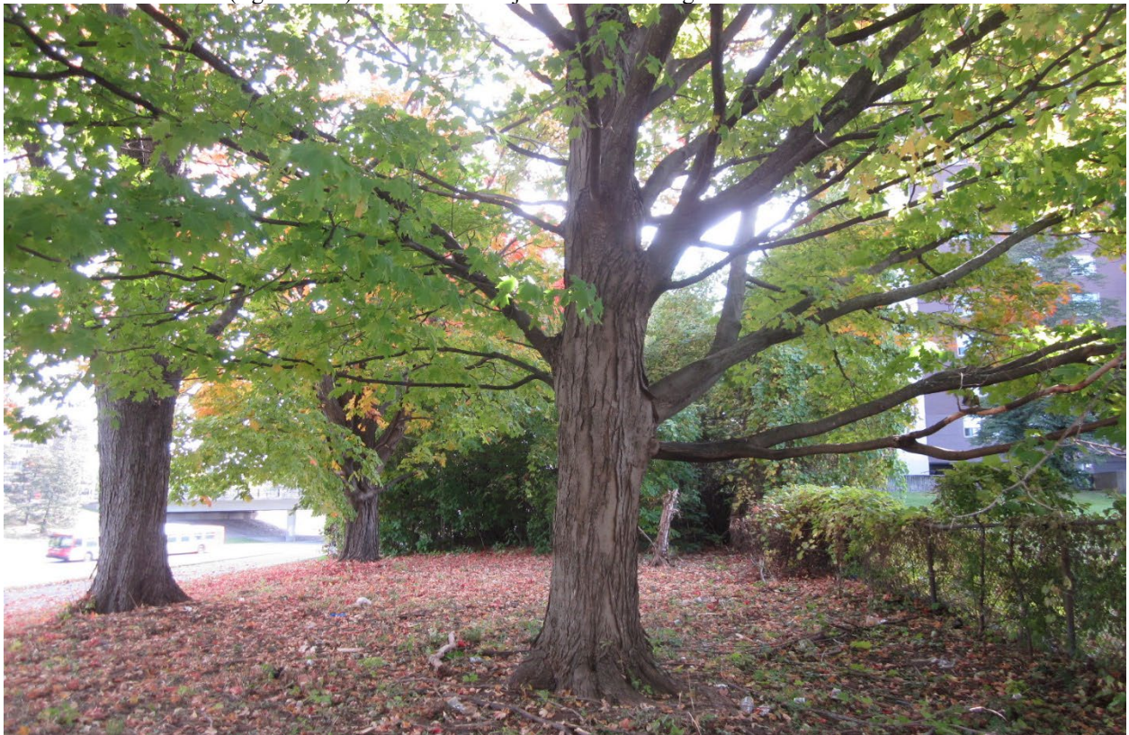
Picture 5. Trees #12-14 (foreground to background) on NCC land adjacent to 2475 Regina Street