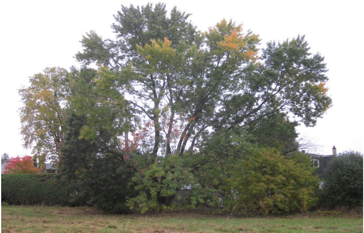
Picture 1. Tree #1, neighbouring silver maple adjacent to 2475 Regina Street