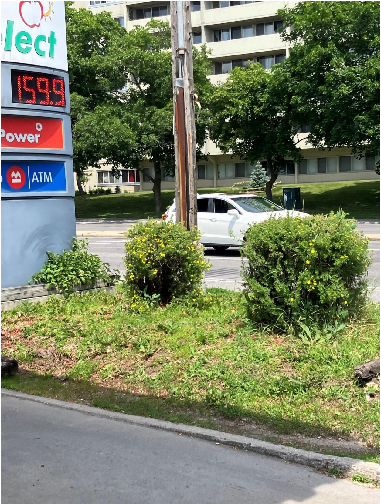
Tree 2 &3 Forsythia