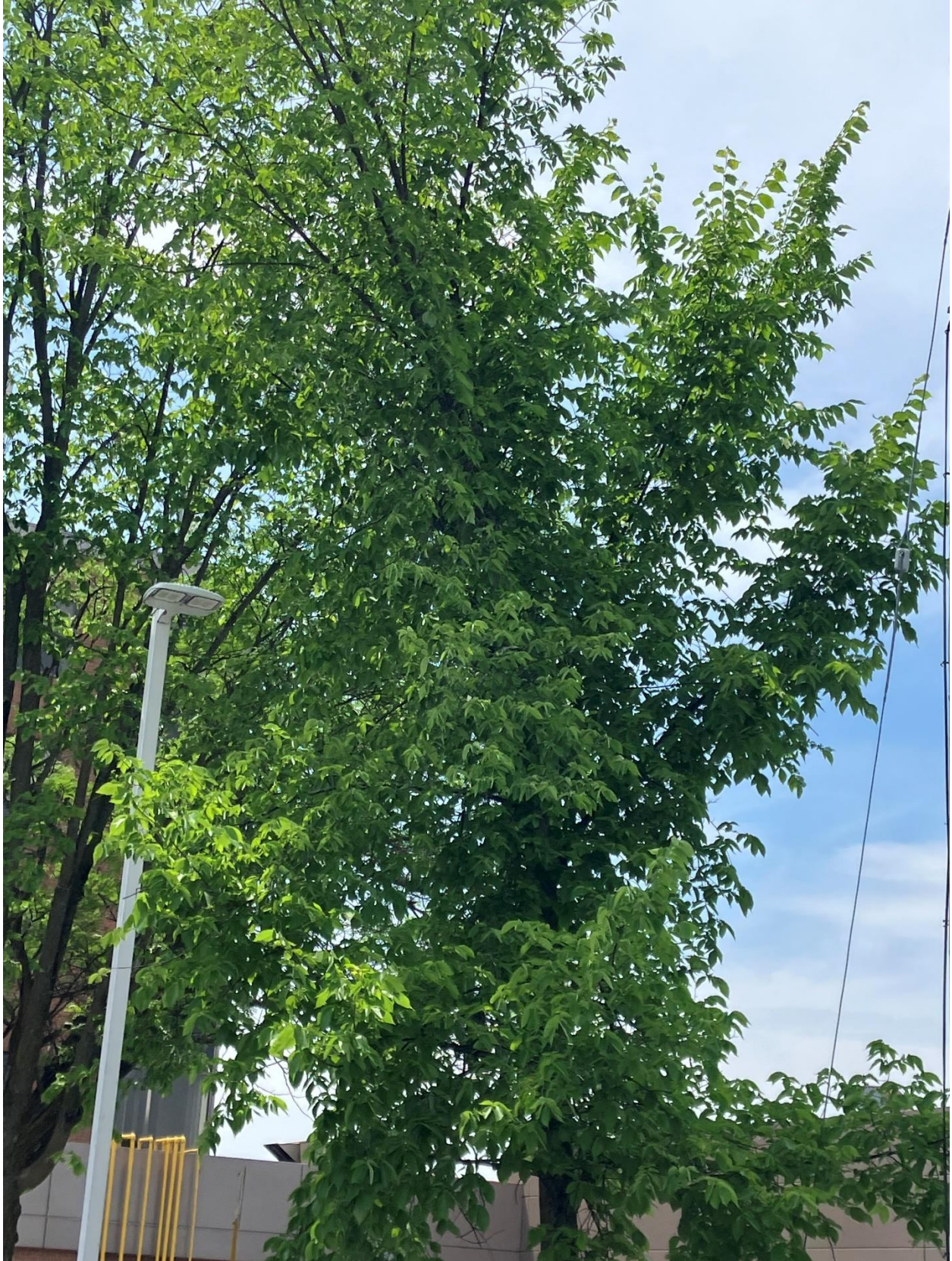
Tree 7 Elm