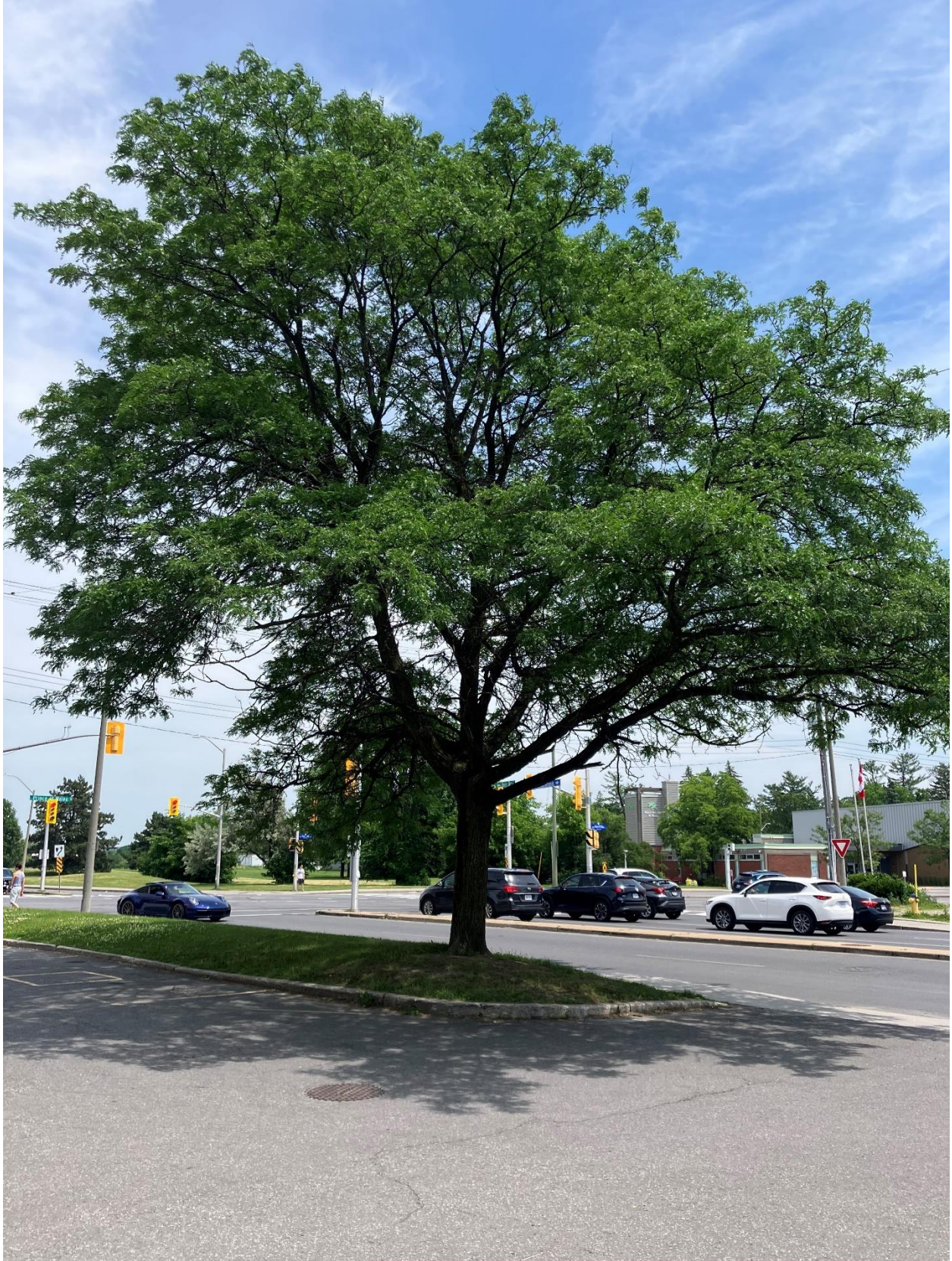
Tree 16(Honey Locust)