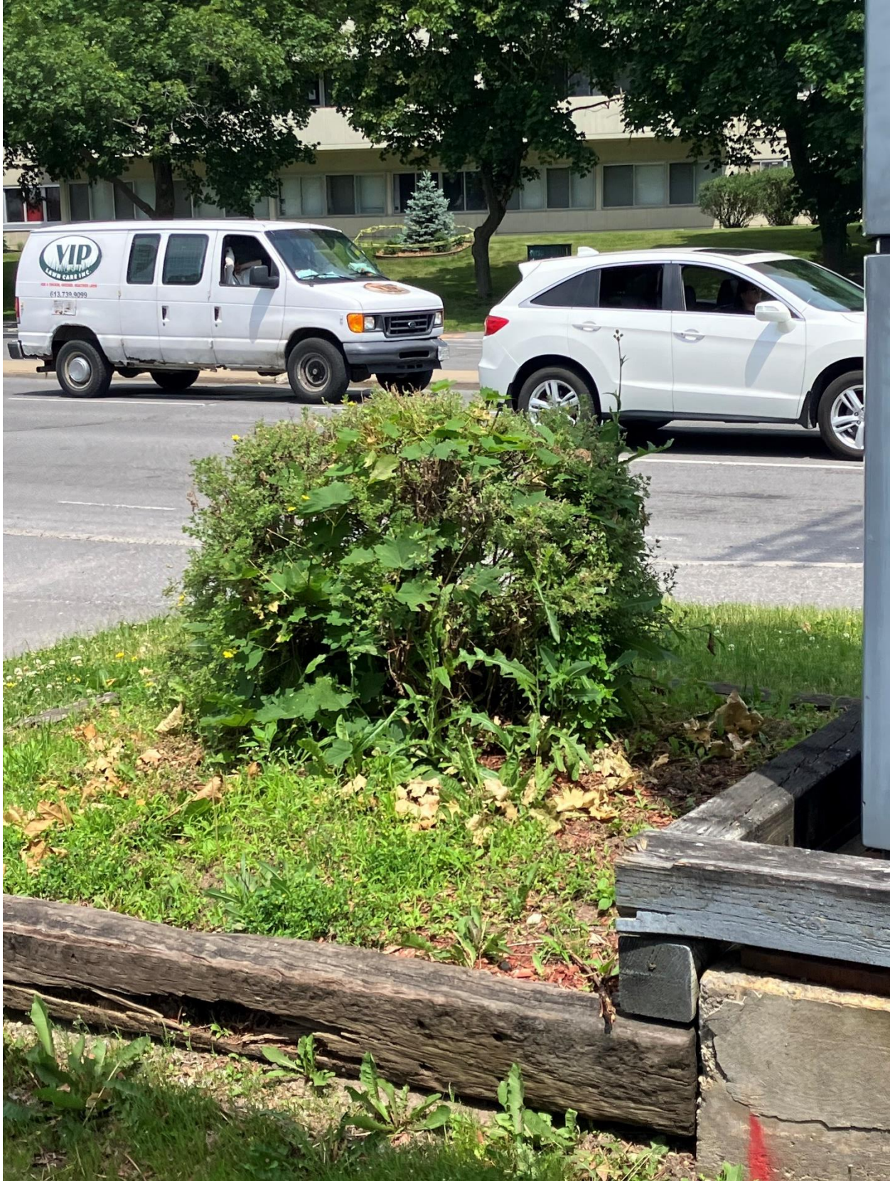
Tree 4 Forsythia