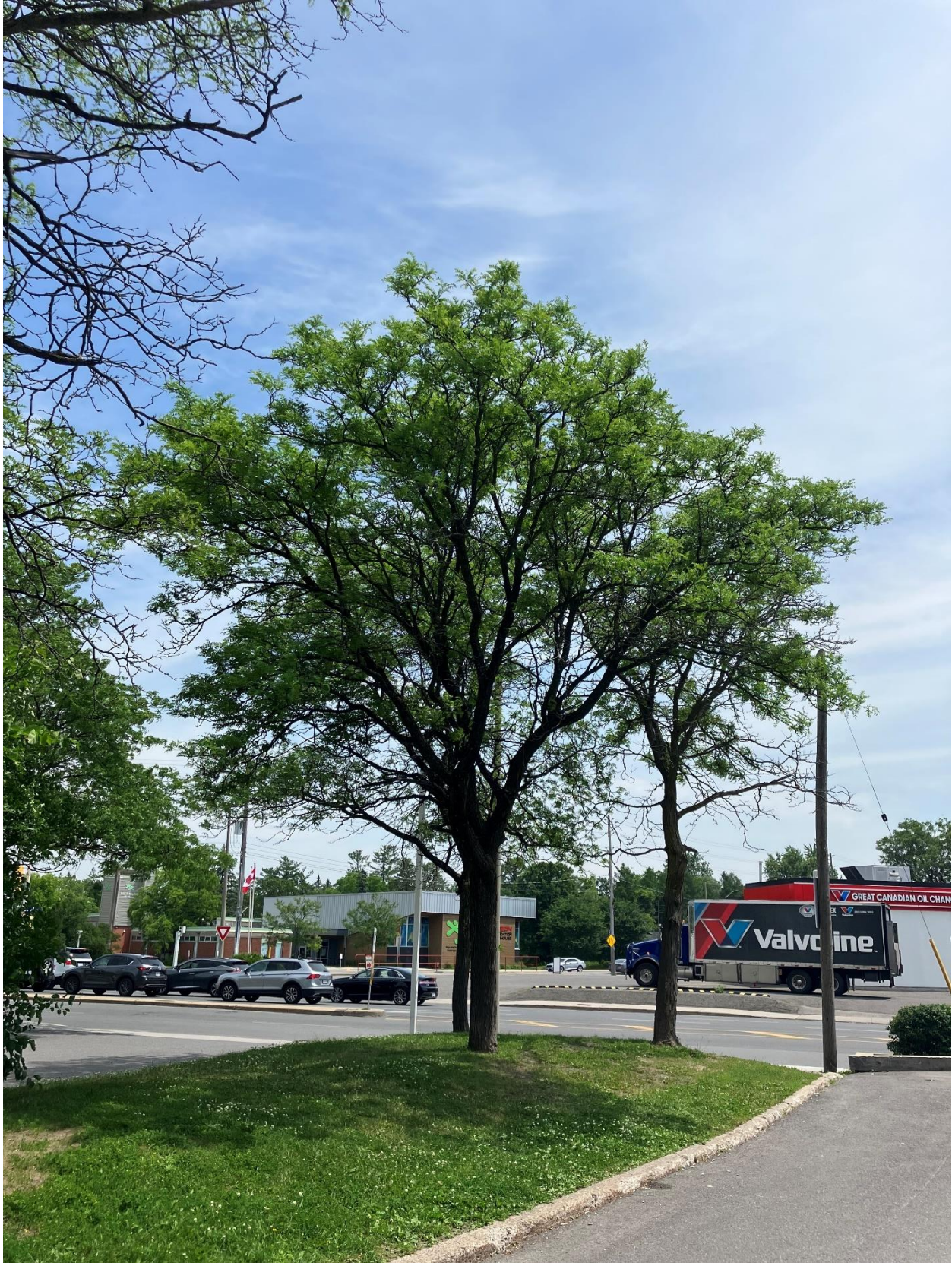
Tree 13 Honey Locust