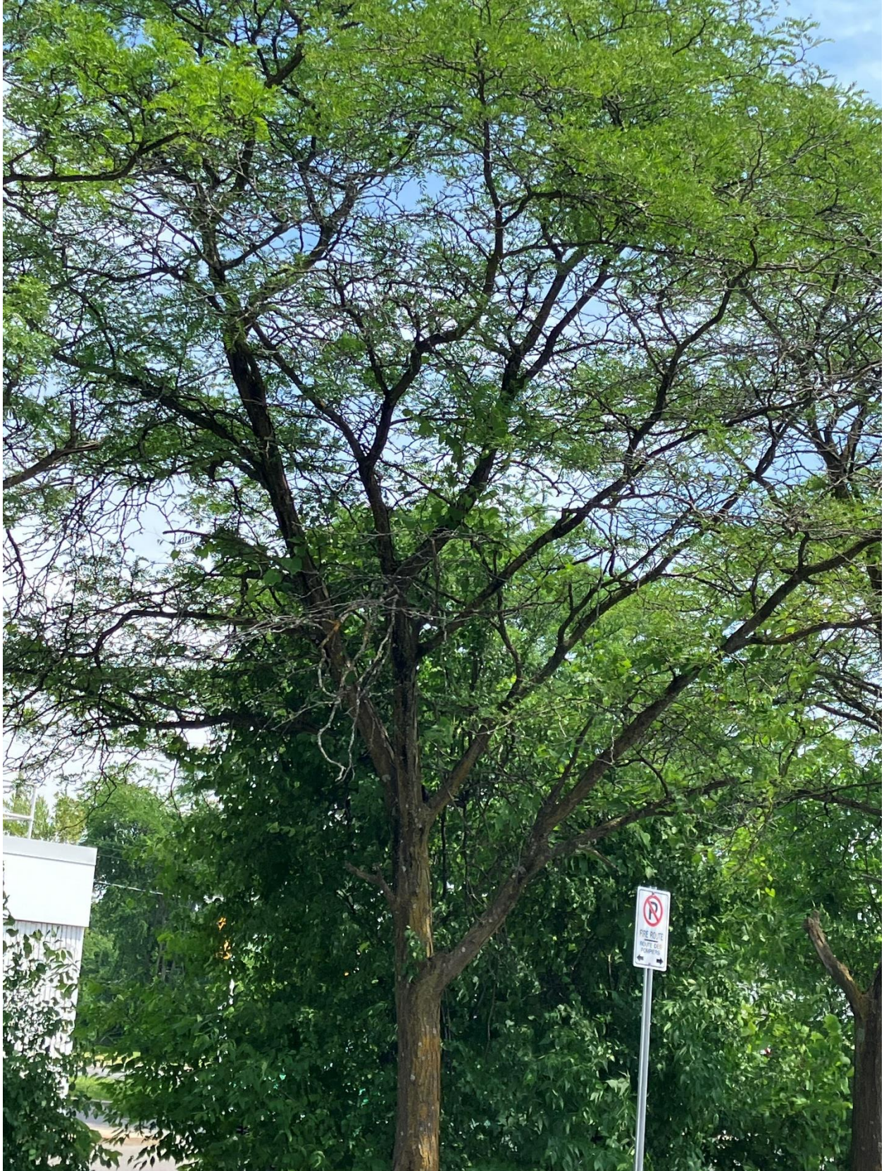
Tree 11 Honey Locust