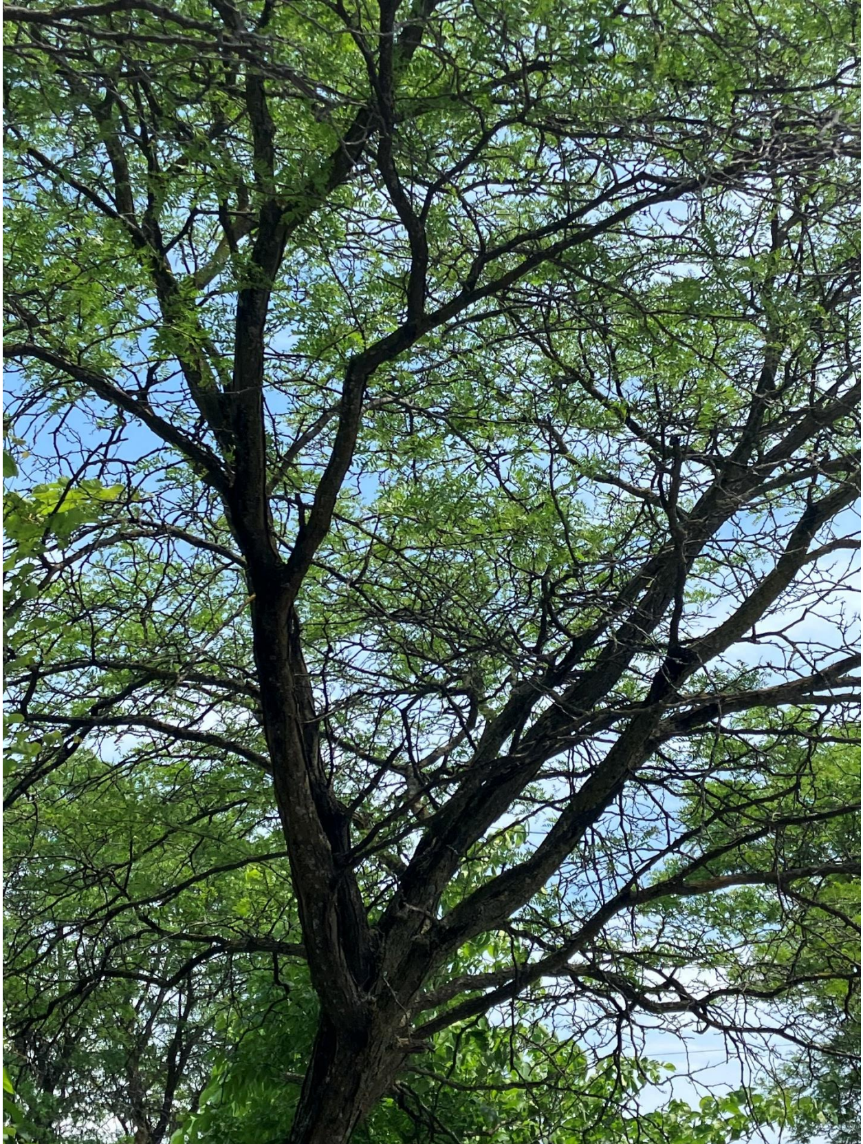
Tree 12 Honey Locust