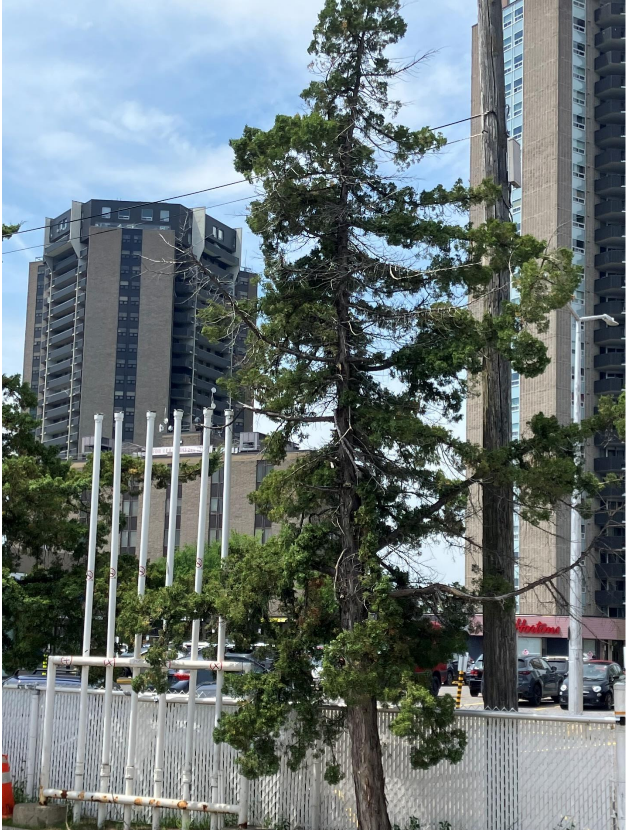
Tree 5 Juniper