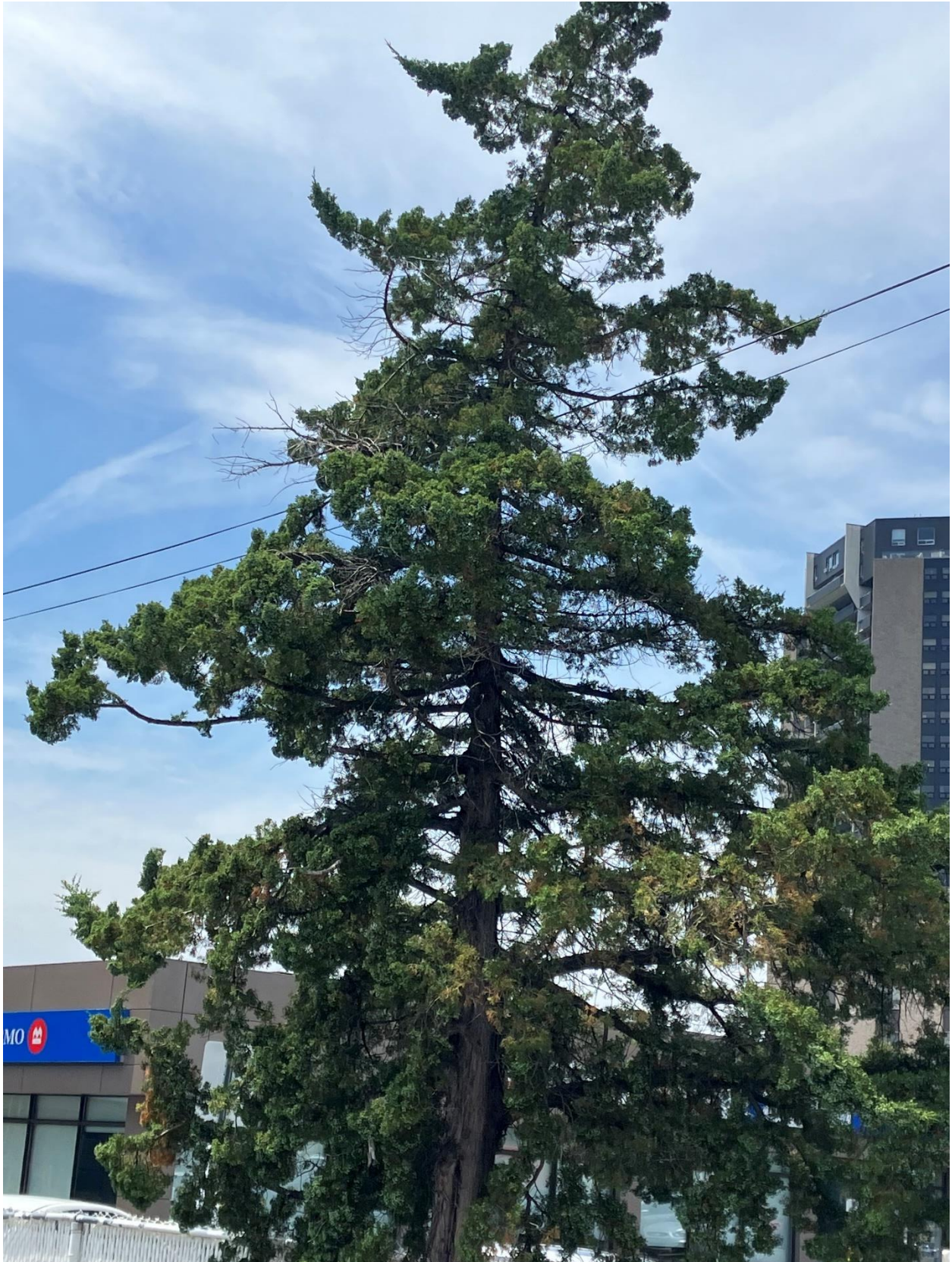
Tree 6 Juniper