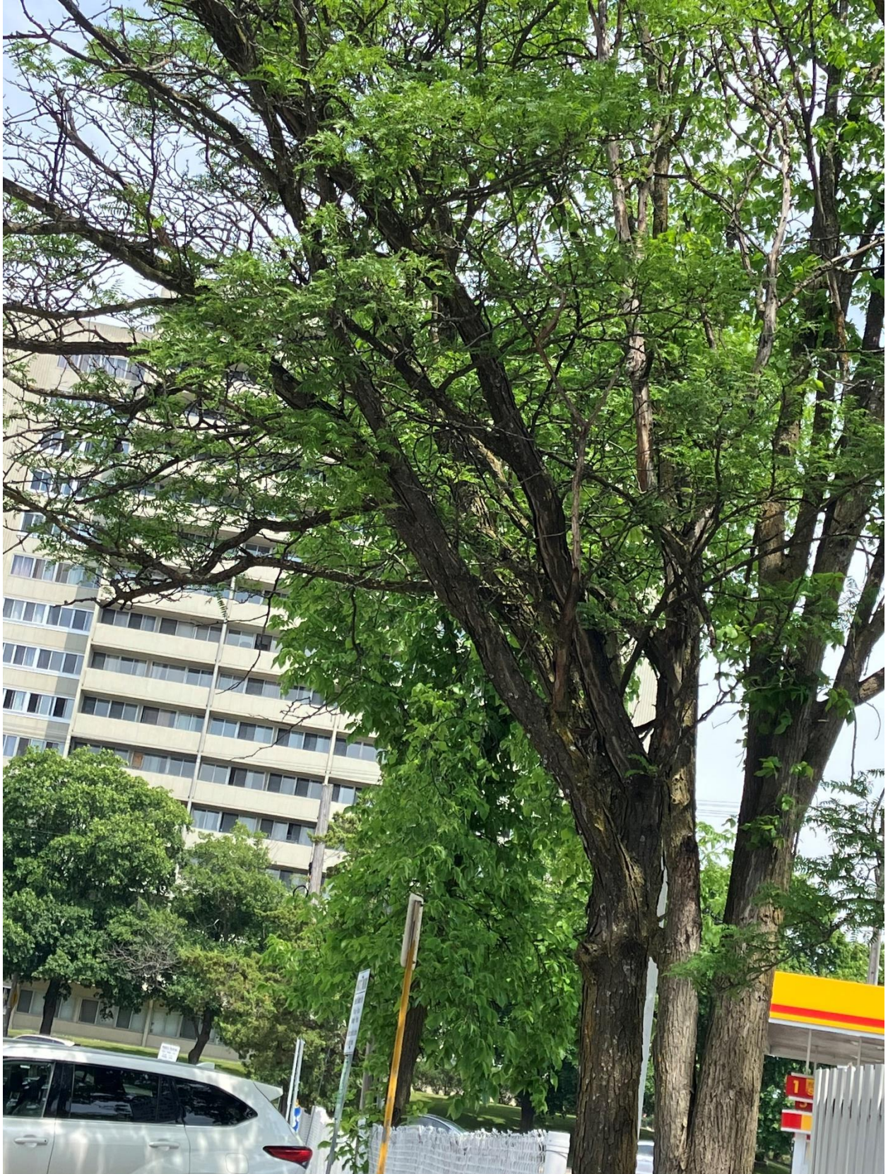
Tree 9 Honey Locust