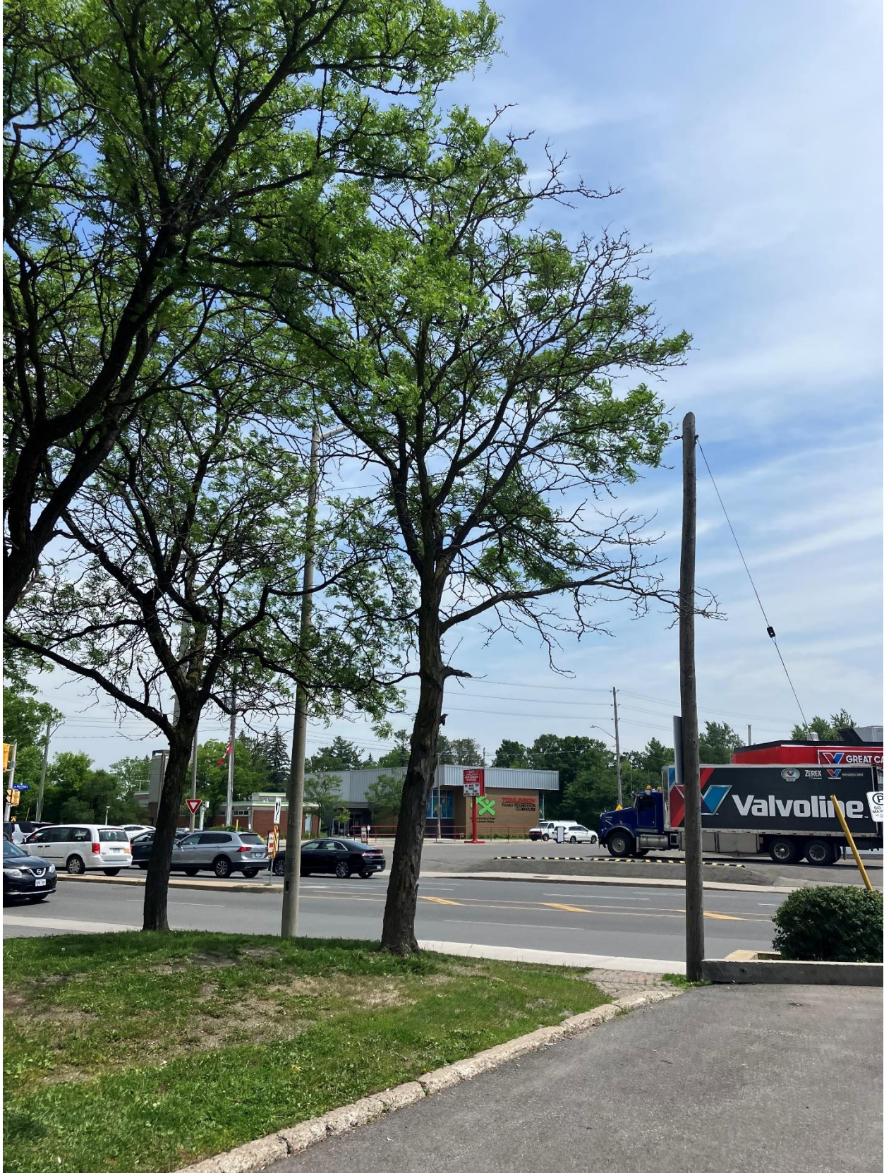
Tree 14 Honey Locust