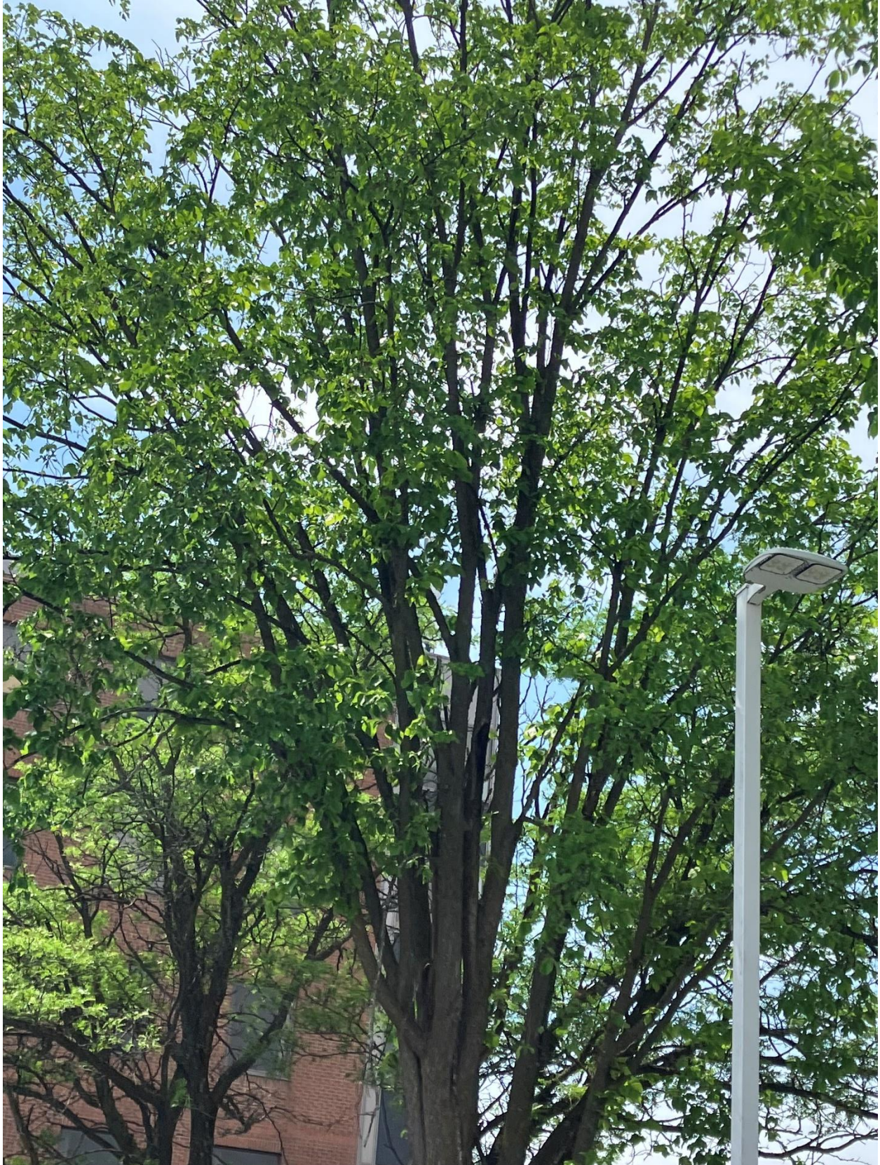
Tree 8 Elm