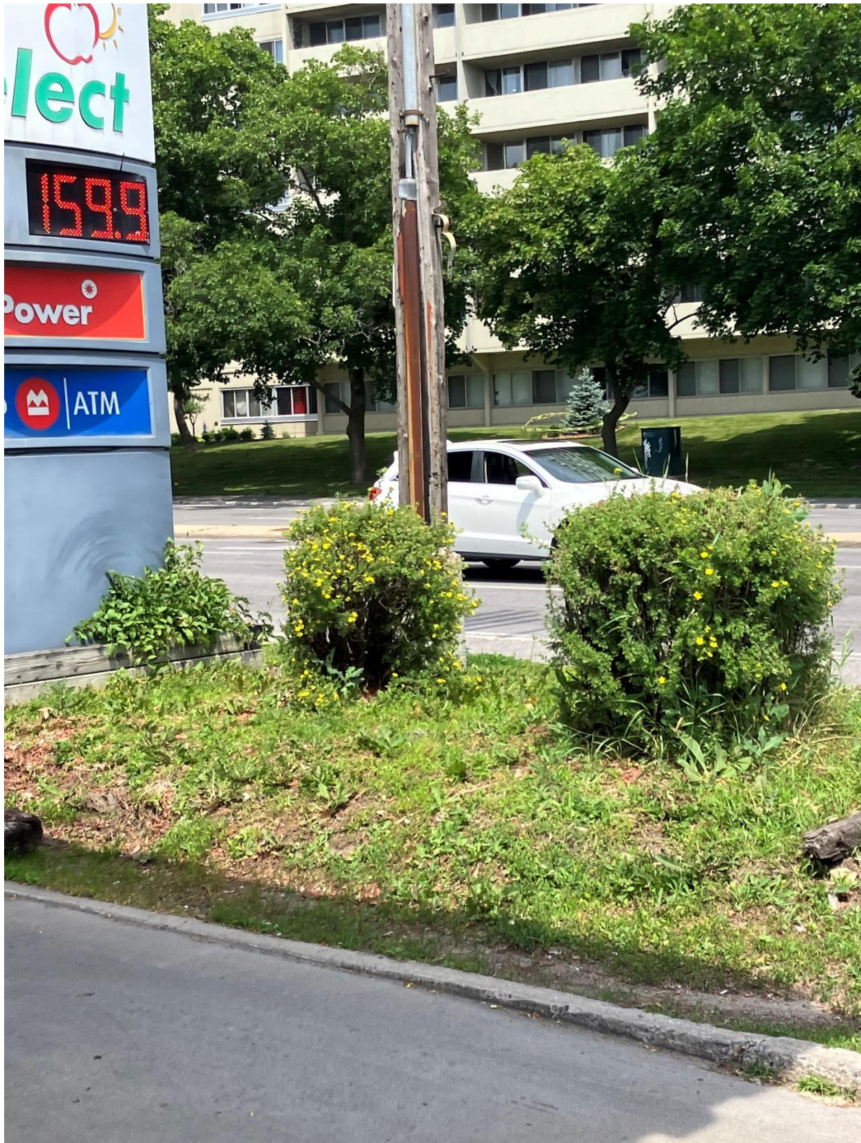
Tree 2 &3 Forsythia