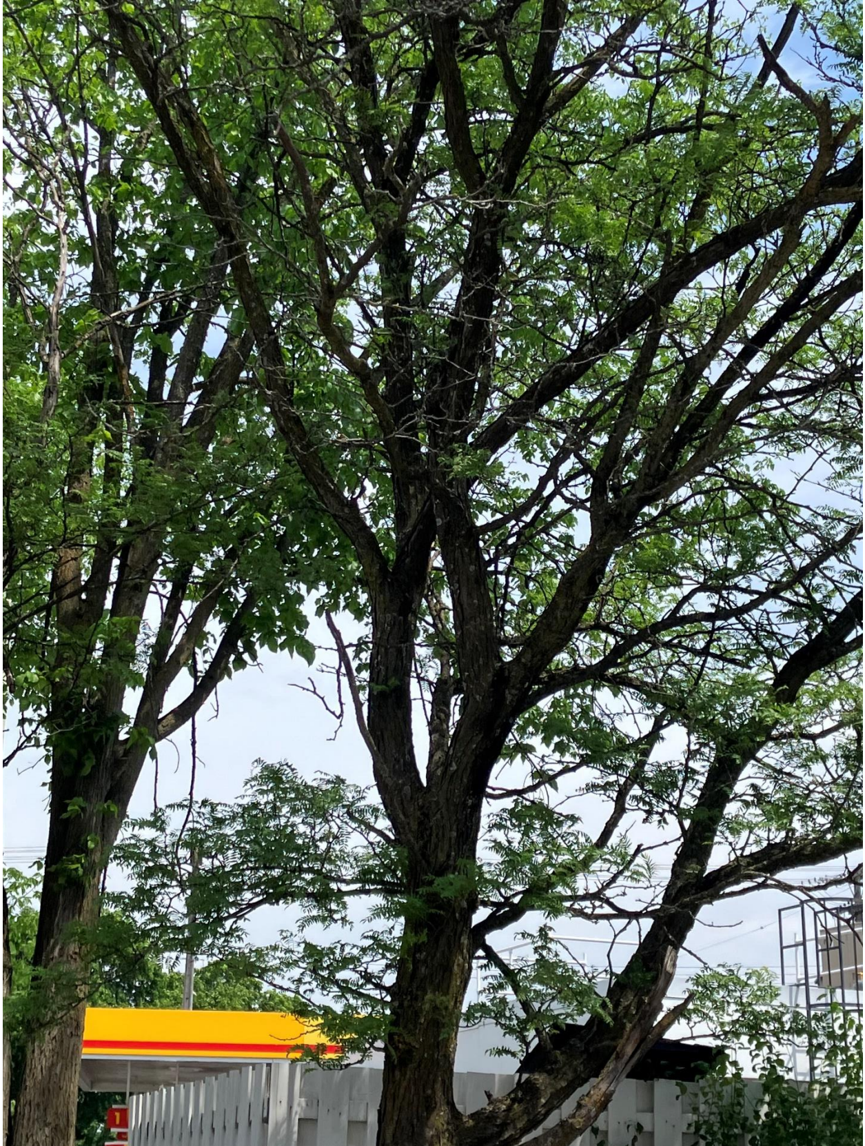
Tree 10 Honey Locust