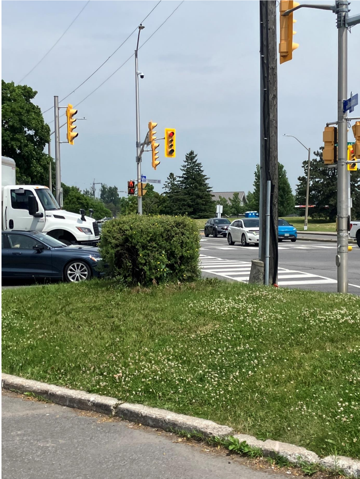
Tree 1 Forsythia