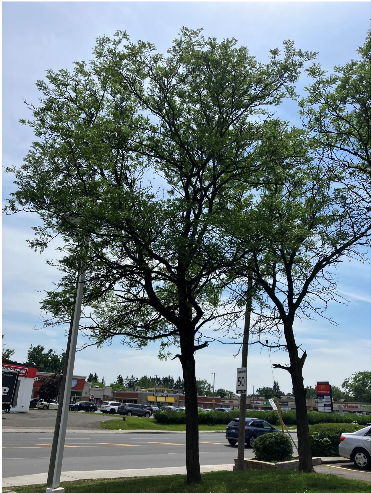
Tree 15 Honey Locust