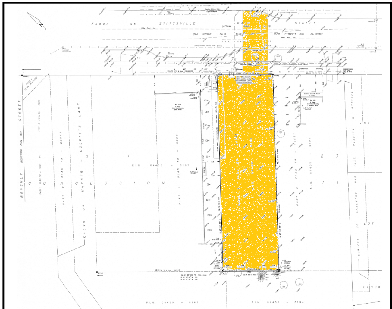
Figure 1: Proposed Construction Area