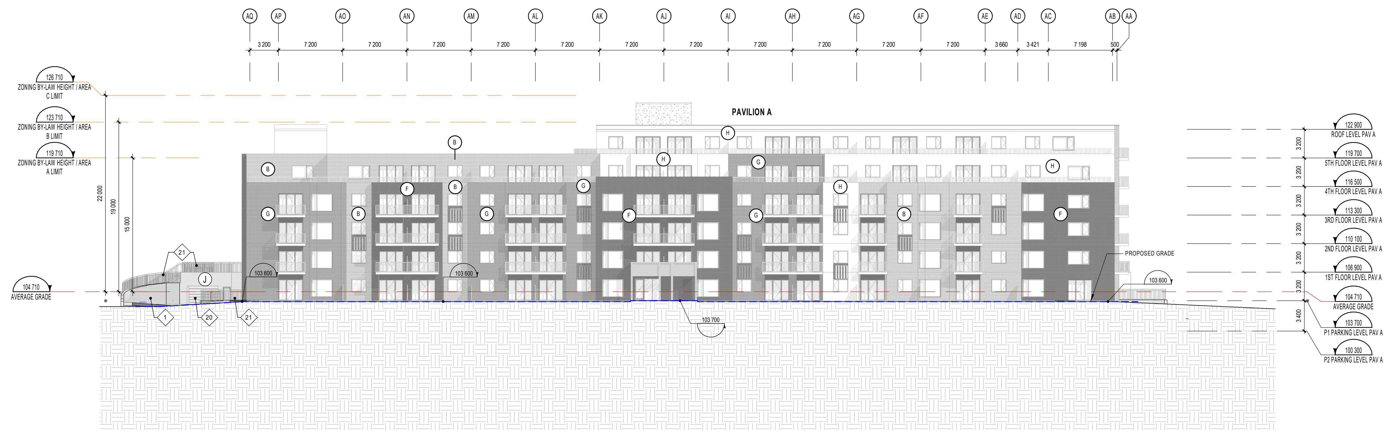
EAST ELEVATION - PAVILION A 1:250 (01 A401)

NOTES GÉNÉRALES / General Notes Ces documents d'architecture sont la propriété exclusive de NEUF architect(e)s et ne peuvent être utilisés, reproduits ou copiés sans autorisation écrite préalable. / These architectural documents are the exclusive property of NEUF architect(e)s and cannot be used, copied or reproduced without written pre-authorization. Les dimensions apparaissant sur ces documents doivent être vérifiées par l'entrepreneur avant le début des travaux. / All dimensions which appear on the documents must be verified by the contractor before to start the work. Veuillez aviser l'architecte de toute dimension erreur et/ou divergence entre ces documents et ceux des autres professionnels. / The architect must be notified of all errors, omissions and discrepancies between these documents and those of the others professionals. Les dimensions sur ces documents doivent être lues et non mesurées. / The dimensions on these documents must be read and not measured.