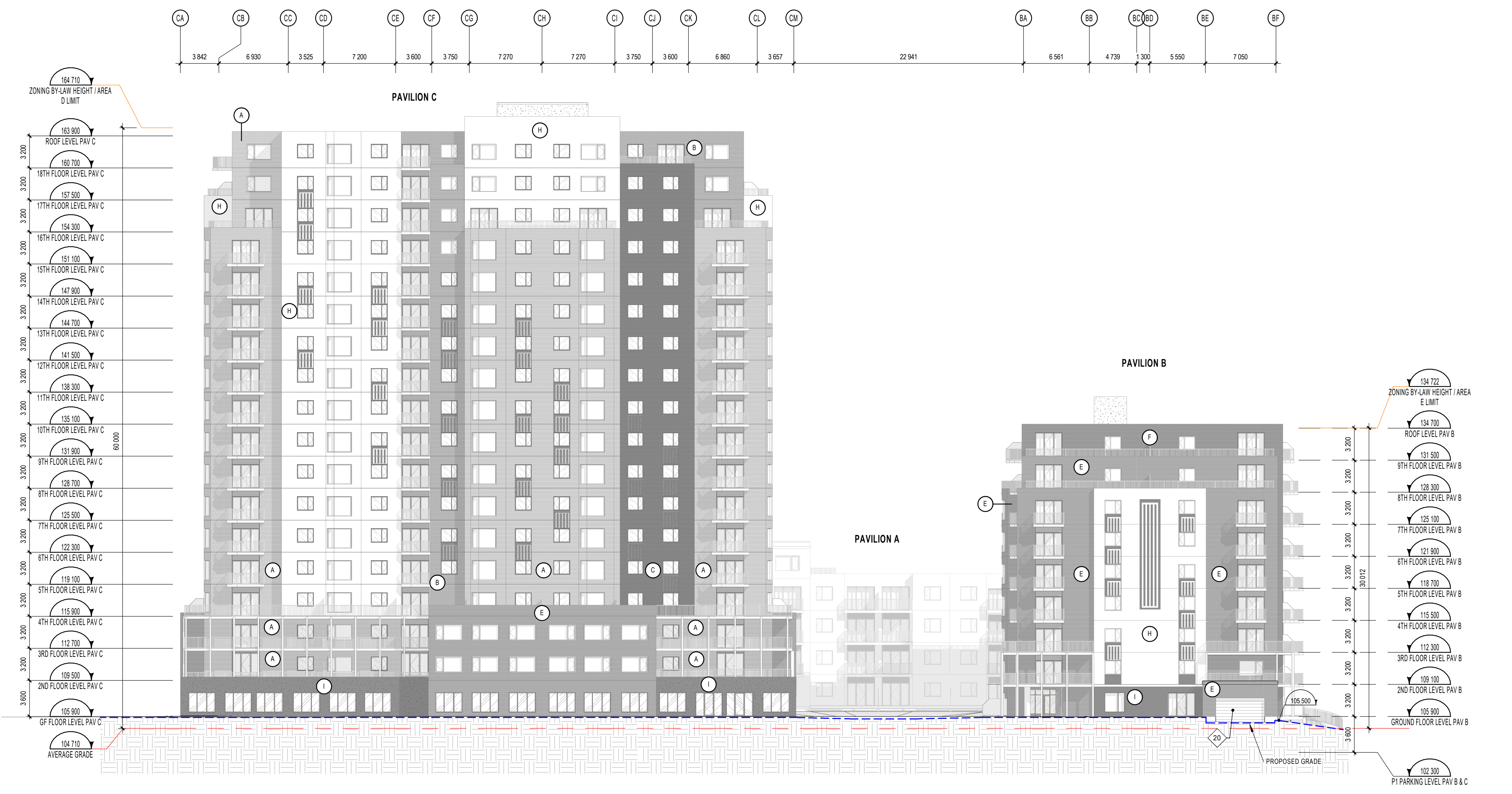
WEST ELEVATION - PAVILION C & B 1:250 (02 A401)