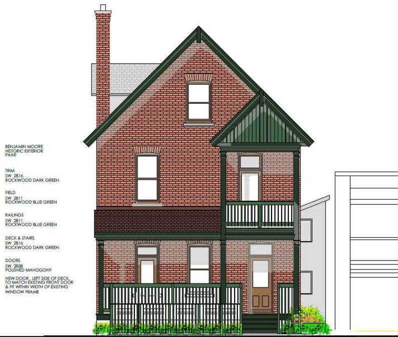
Figure 1. Rendering of proposed exterior modifications to existing building prepared by Woodman Architect Associates Ltd.

Arcadis Professional Services (Canada) Inc. is authorized agent and applicant for the owner of the property municipally known as 379 Cooper Street located in Ottawa, ON. The site presently contains a two-and-a-half storey red brick dwelling with a front porch, pitched roof, and a one-storey rear addition which will remain unchanged. The Owner is seeking to undertake interior modifications to the existing building to create three new dwelling units in the lower level of the 10-unit dwelling, for a total of 13 dwelling units. There is an existing sunken terrace within the front yard which is to be fully concealed with soft landscaping and shrubbery. Improvements to the front façade are proposed including extending and repairing the existing first storey front porch, adding a partial second storey front porch, retaining and repairing existing brickwork, and reinstating porch, beam and rail features as well as historic decorative trim. The rear yard will contain bicycle parking, a sunken terrace, waste storage, and soft landscaping. The proposed building elevation is presented in Figure 1 below, prepared by Woodman Architect Associates Ltd.