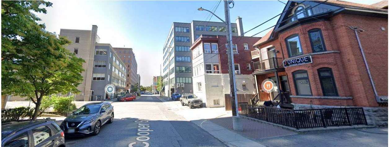
Figure 6. Surrounding uses looking southwest from Cooper Street