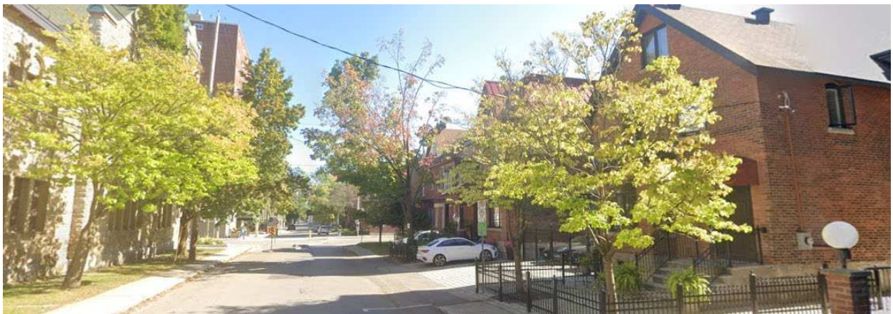
Figure 8. Similar scale of development on Cooper Street looking west (Google Streetview, Sept. 2024)