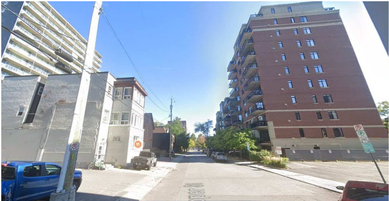
Figure 5. Surrounding conditions along Cooper Street looking northeast

The neighbourhood is generally characterized by some low-rise residential and mixed-commercial uses, institutional uses including a church fronting onto O'Connor Street to the east, mid- and high-rise residential buildings along Cooper Street, Lisgar Street to the north, and O'Connor Street to the east, as well as mid- to high-rise mixed-use commercial, residential and office buildings along Bank Street to the west. Images of the surrounding context are presented in Figures 5 through 8 below.