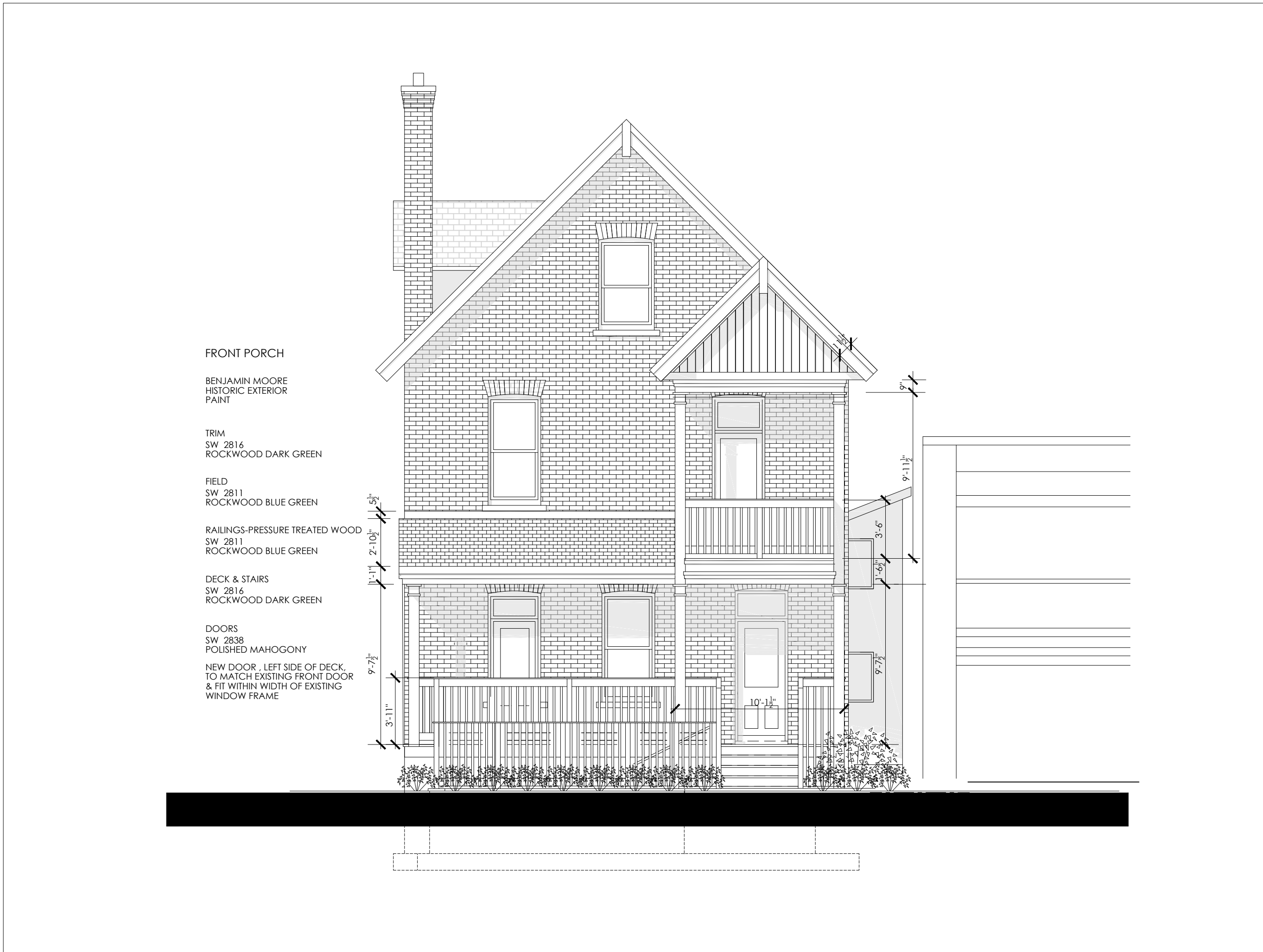
1 PROPOSED SOUTH ELEVATION- COOPER ST A3 SCALE : 3/16"=1'-0"

9/6/2024C:\Users\Owner\OneDrive\Desktop\Documents\New folder\Cooper SP1-SITE PLAN 2024.dwg