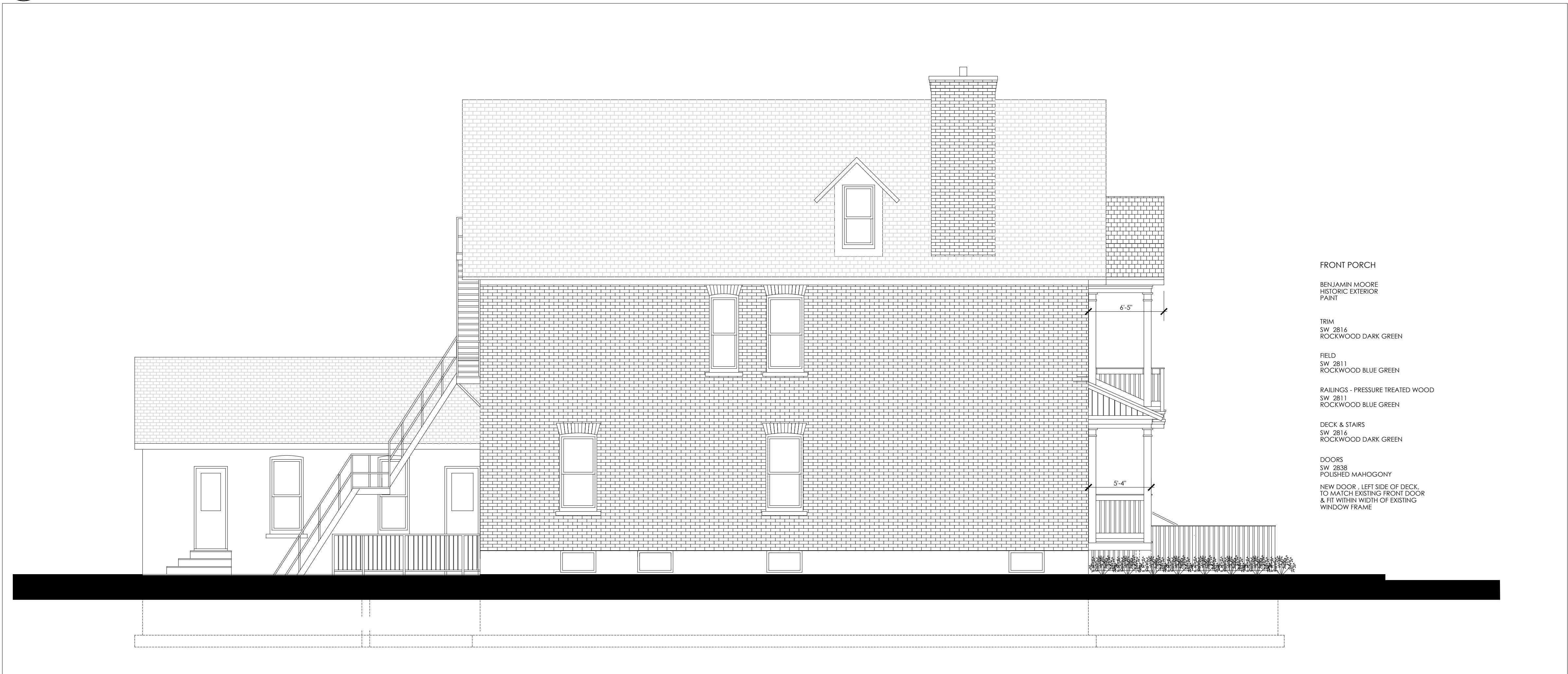
2 PROPOSED WEST ELEVATION A3 SCALE : 3/16"=1'-0"