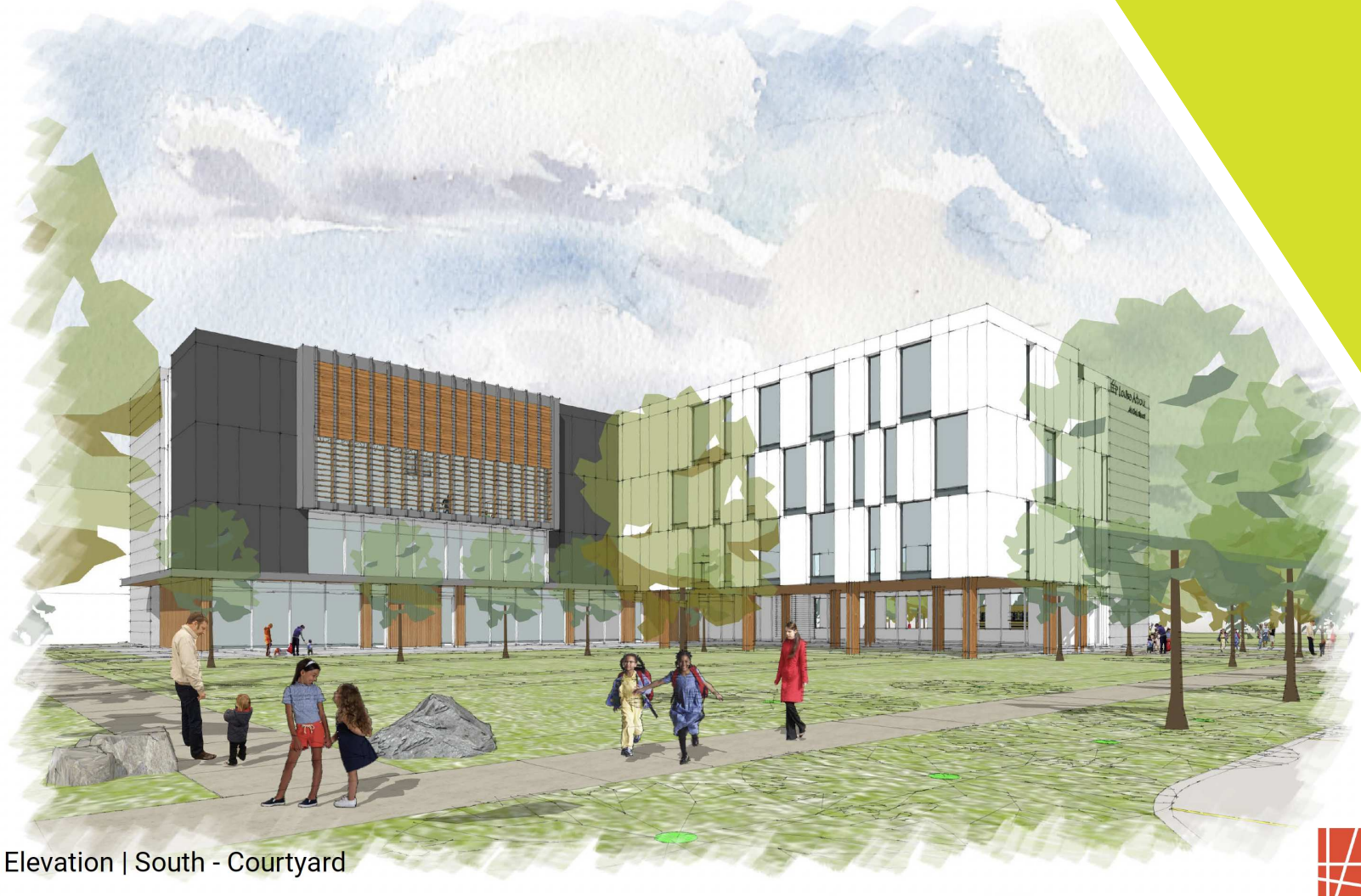
Elevation | South - Courtyard

REPORT DATE: June 20 2025 | REVISION: 2 REPORT PREPARED FOR: CÉPEO PREPARED BY: Q9 PLANNING + DESIGN INC.