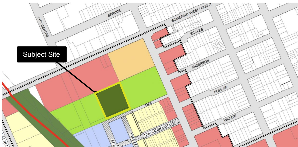
Figure 2: Extract of Schedule L, West Downtown Core Secondary Plan Volume 2 Corso Italia District

The subject site is also captured in the West Downtown Core Secondary Plan as part of the Corso Italia District. The subject site is currently designated Park .