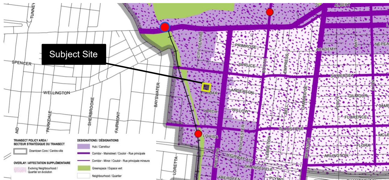
Figure 1: Extract of Schedule B1, Downtown Core Transect, City of Ottawa Official Plan

The site, 45 Oak Street, is designated Hub in the City of Ottawa Official Plan as shown on Schedule B1 – Downtown Core Transect .