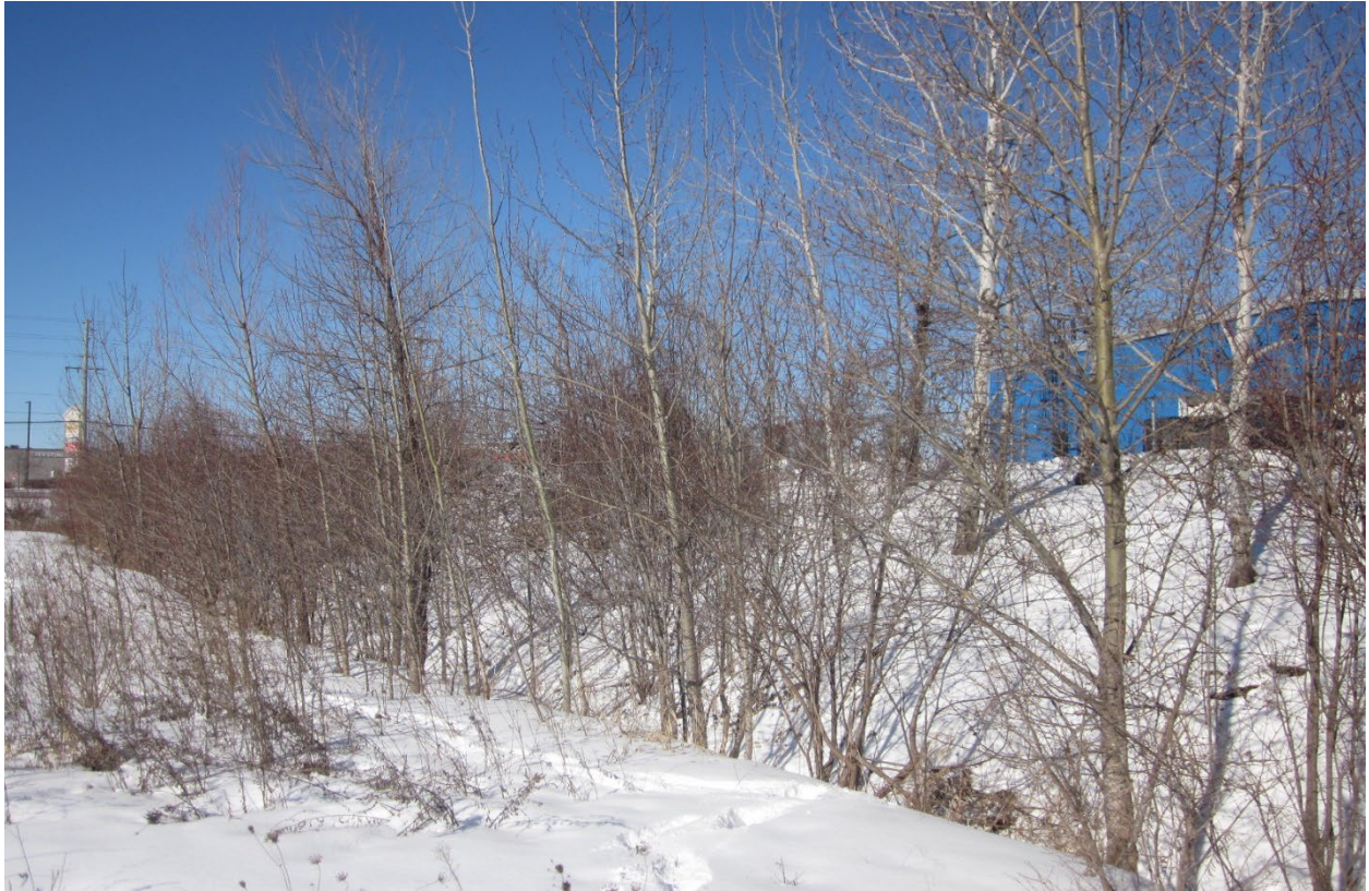
Picture 1. Overview of treed area along northeastern property line at 6310 Hazeldean Road