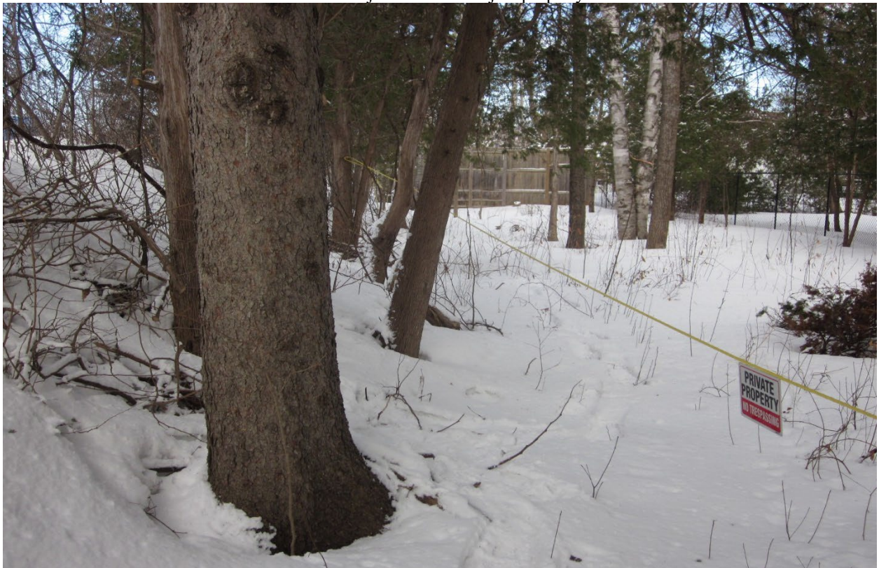
Picture 4. White cedars straddling property line at 6310 Hazeldean Road Picture