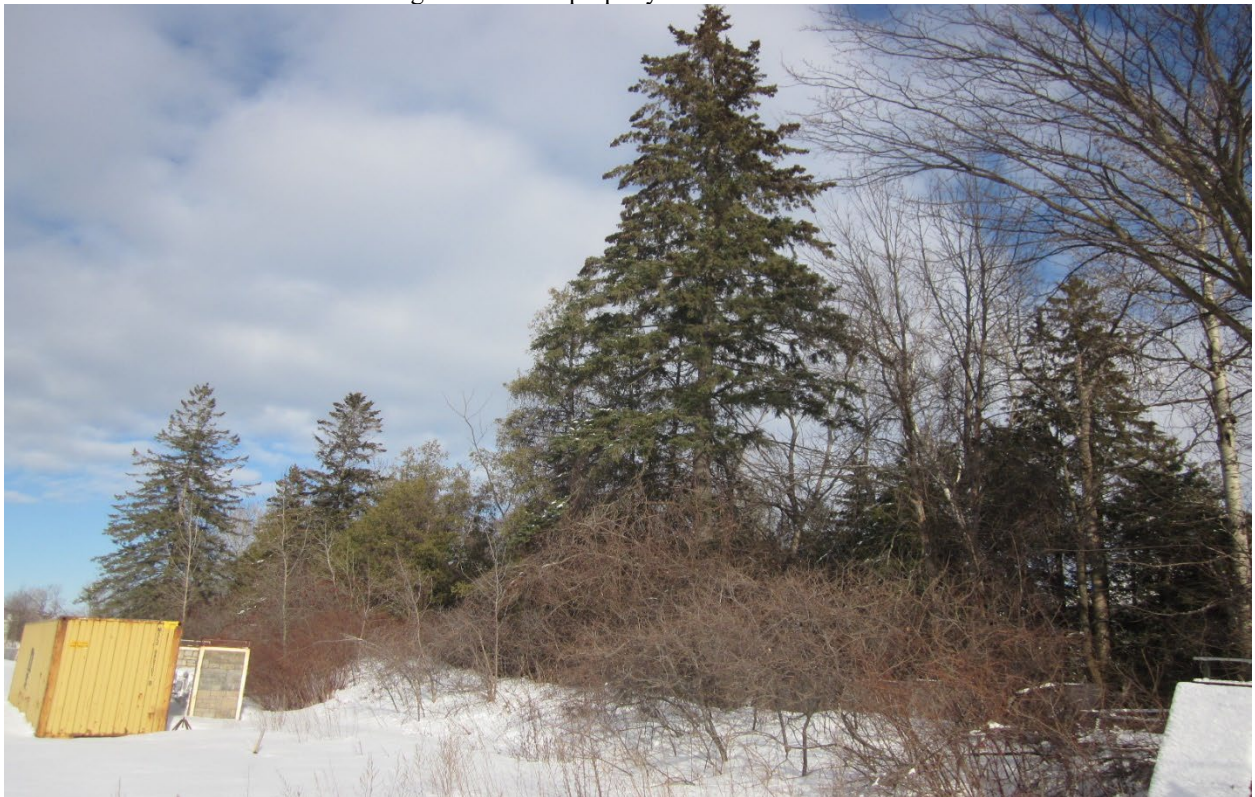
Picture 2. Overview of treed area along southeastern property line at 6310 Hazeldean Road