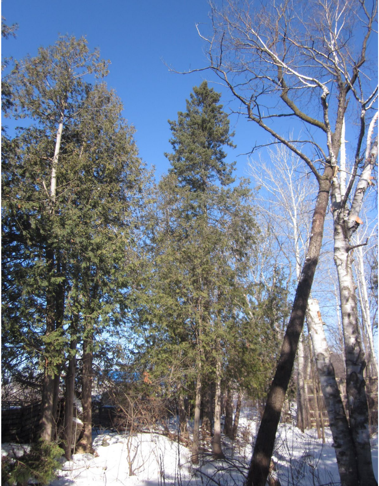
Picture 5. Poplar and white cedar trees on and adjacent to the subject property at 6310 Hazeldean Road