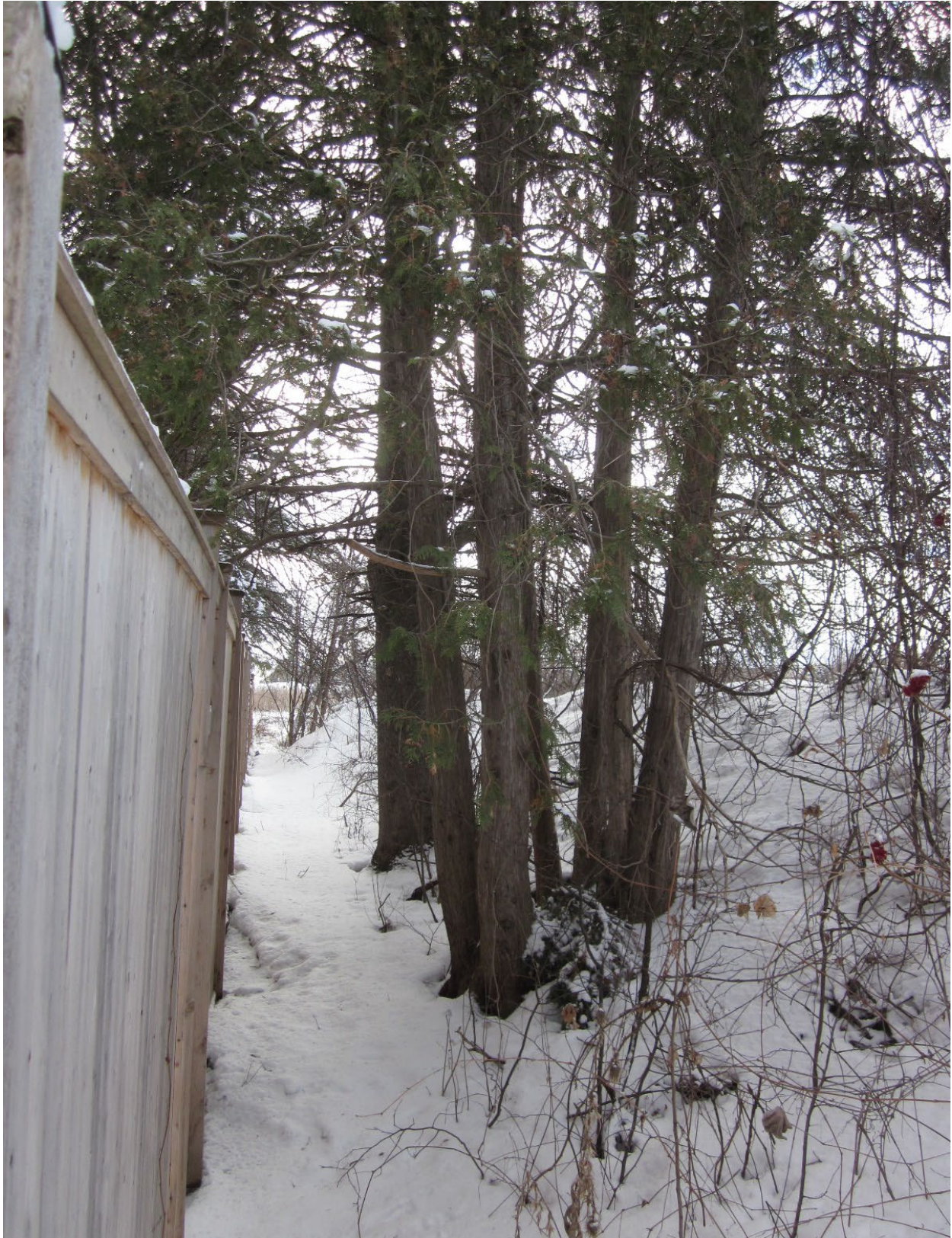
Picture 6. Cedar trees shared between neighbouring and subject property at 6310 Hazeldean Road