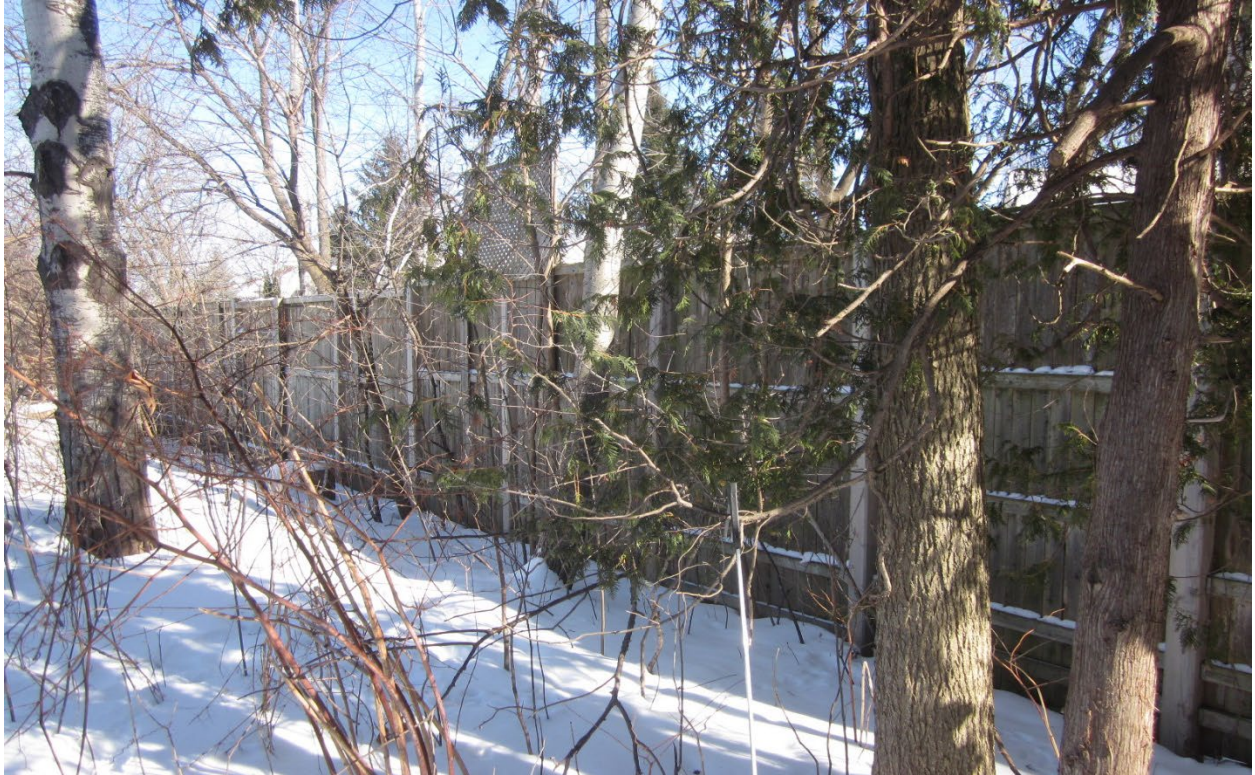
Picture 3. Poplar and white cedar trees on and adjacent to the subject property at 6310 Hazeldean Road