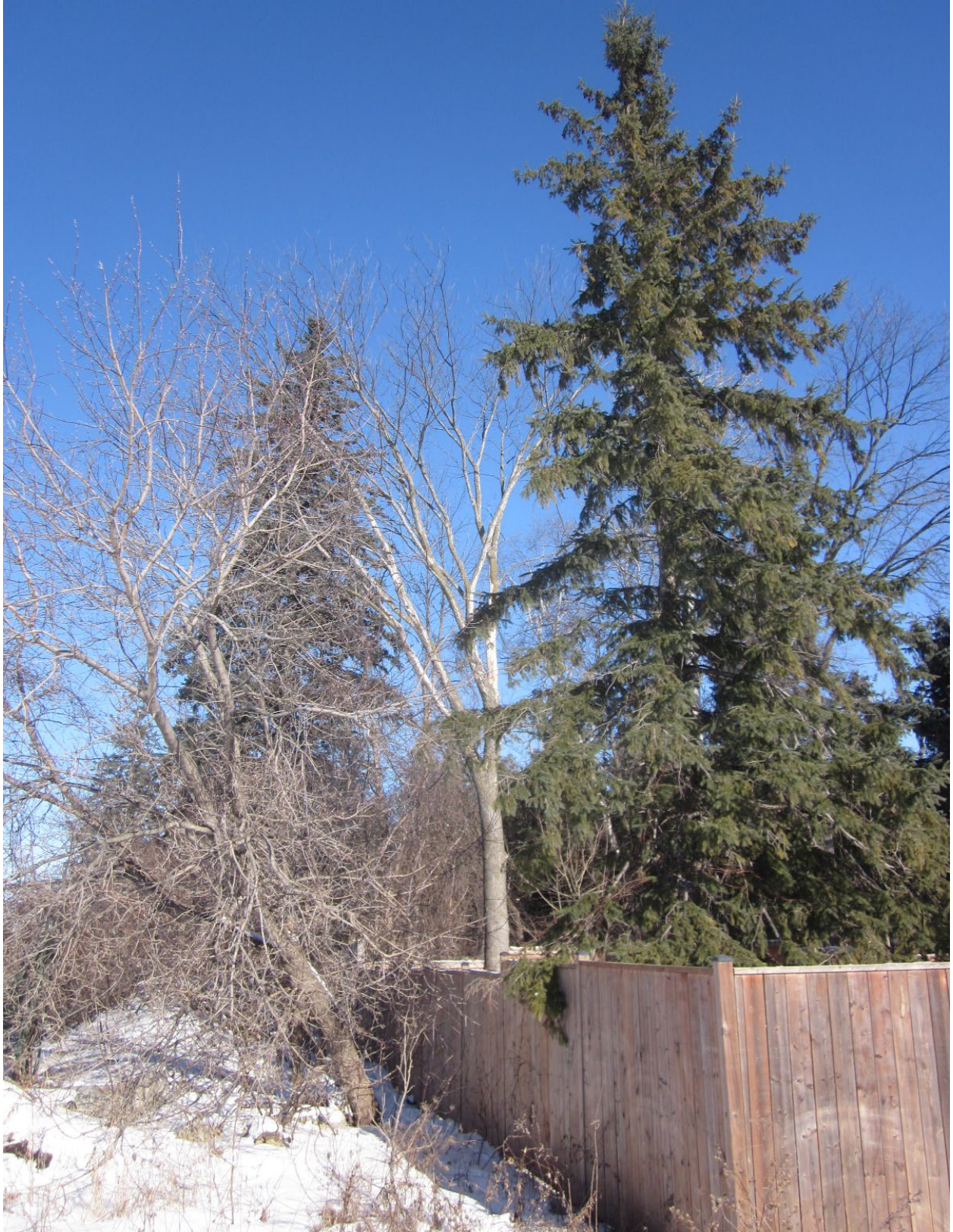
Picture 7. Manitoba maple, dead elm and spruce on neighbouring property at 6310 Hazeldean Road