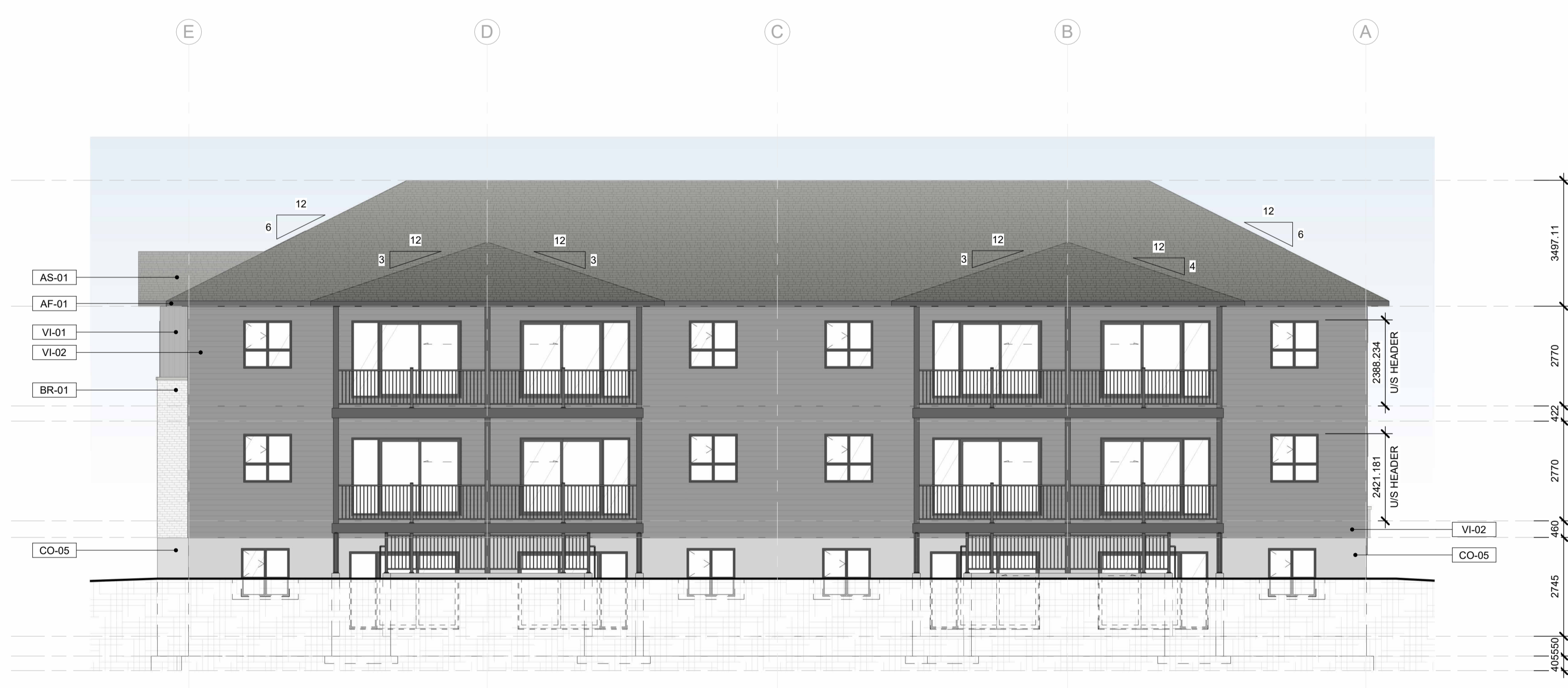
3 REAR ELEVATION A201 1:100