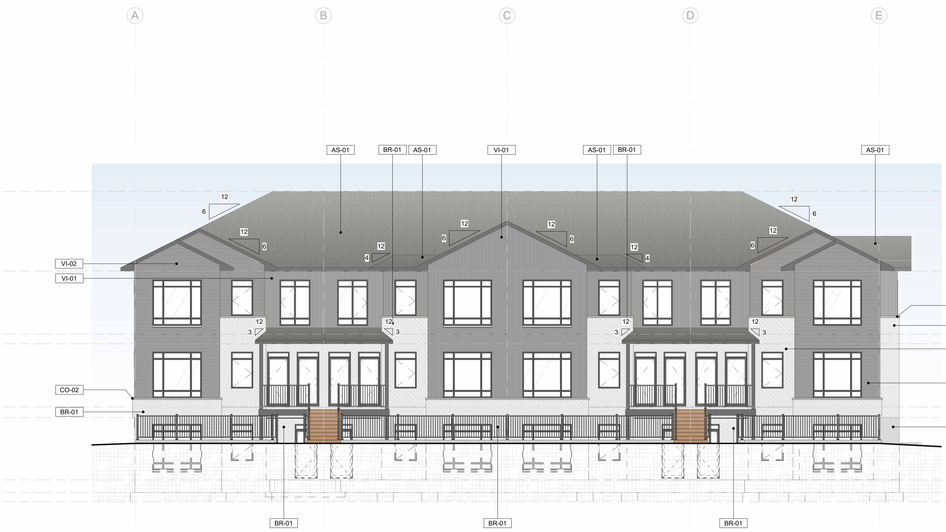
1 FRONT ELEVATION A201 1:100