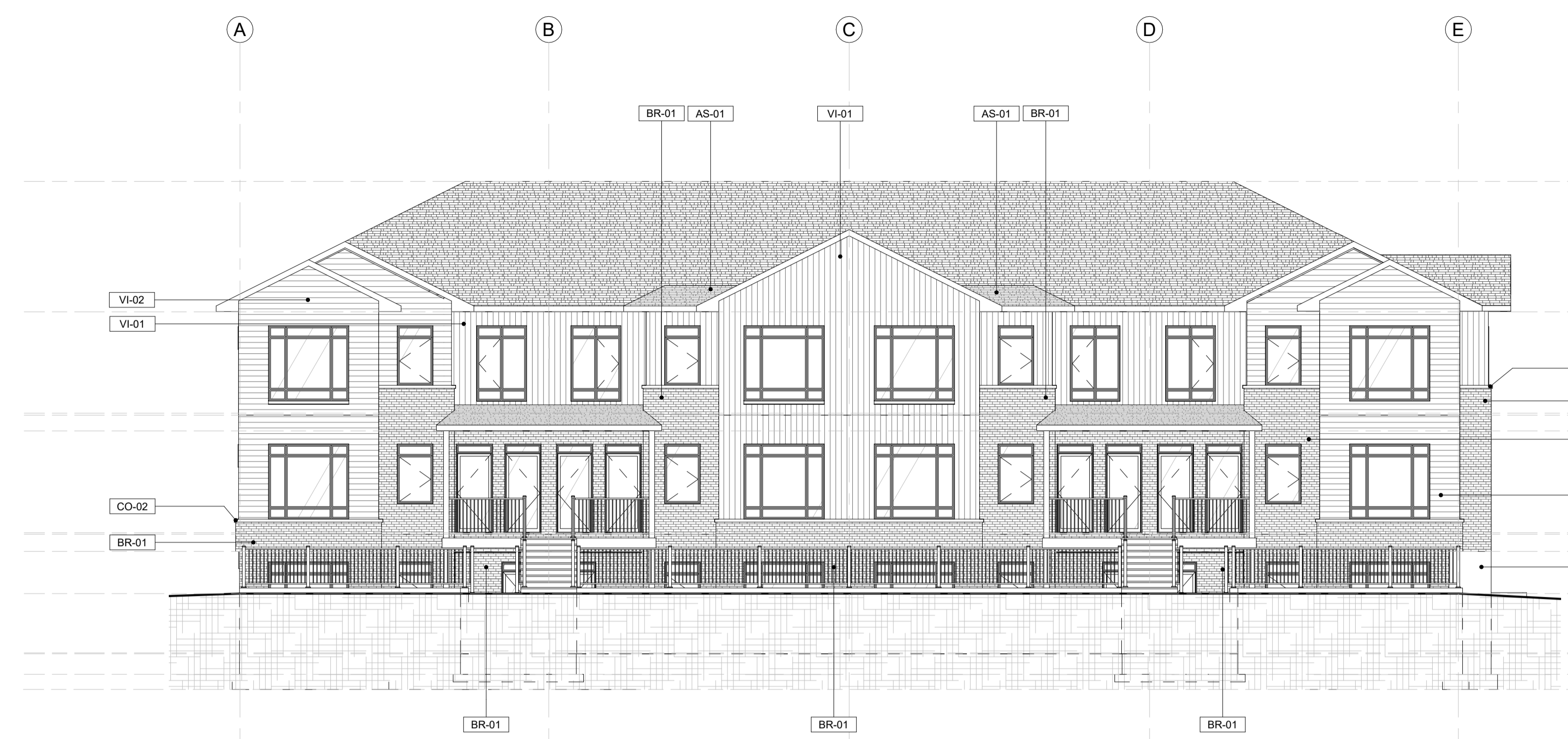
1 FRONT ELEVATION A202 1:100

IT IS THE RESPONSIBILITY OF THE APPROPRIATE CONTRACTOR TO CHECK AND VERIFY ALL DIMENSIONS ON SITE AND TO REPORT ALL ERRORS AND/OR OMISSIONS TO THE ARCHITECT. ALL CONTRACTORS MUST COMPLY WITH ALL PERTINENT CODES AND BY-LAWS. THIS DRAWING MAY NOT BE USED FOR CONSTRUCTION UNTIL SIGNED BY THE ARCHITECT. DO NOT SCALE DRAWINGS. COPYRIGHT RESERVED.