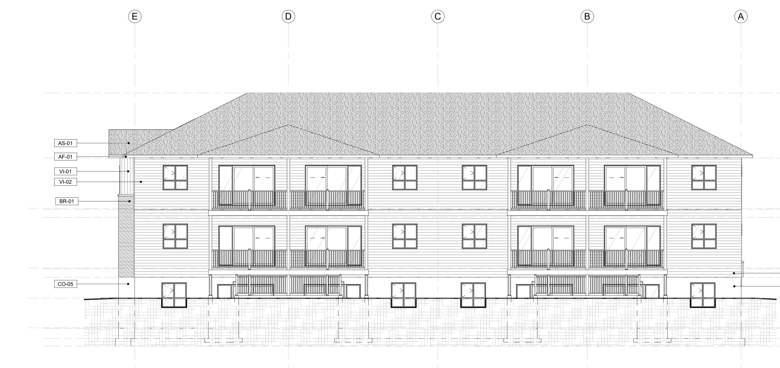
3 REAR ELEVATION A202 1:100