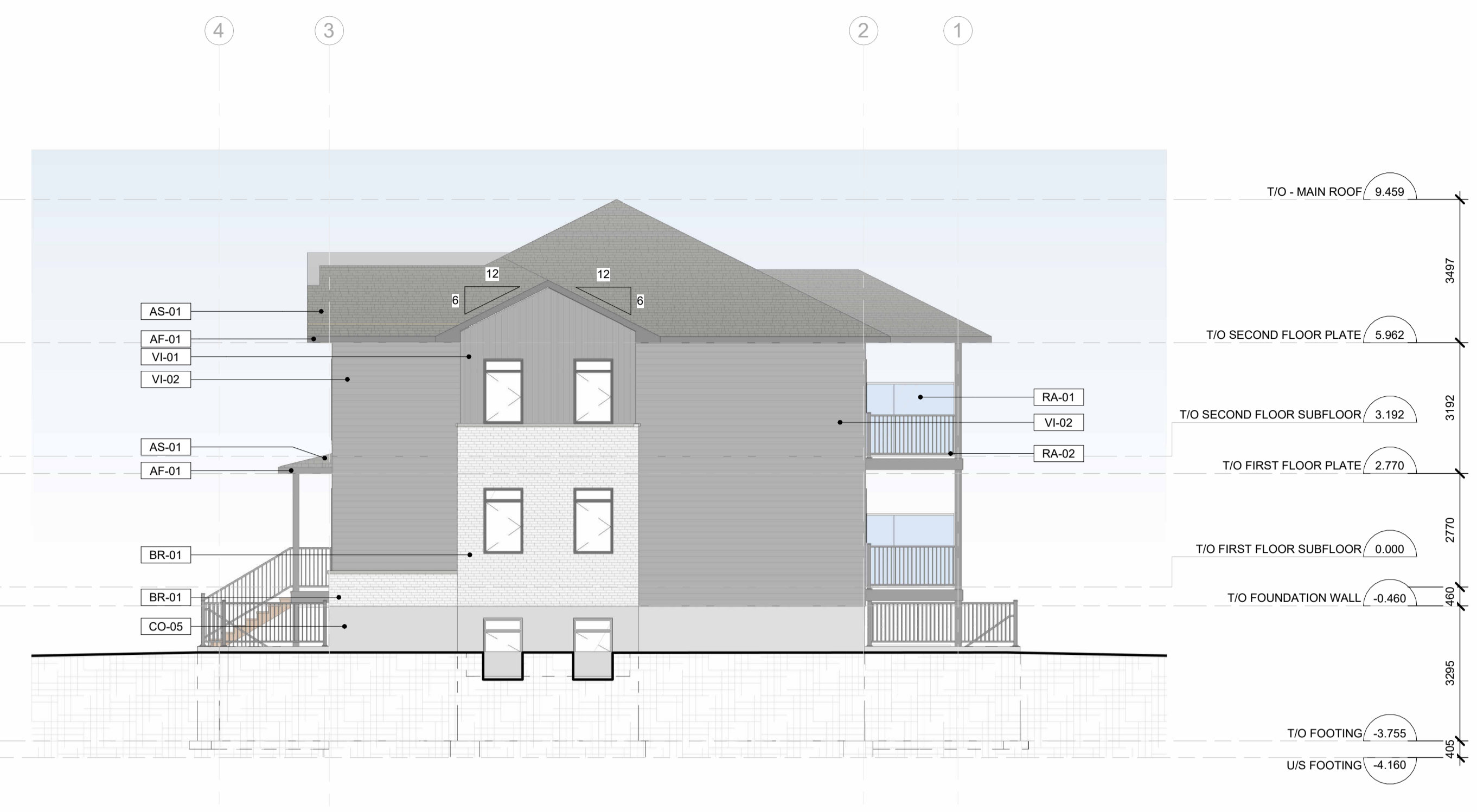
2 RIGHT ELEVATION A201 1:100