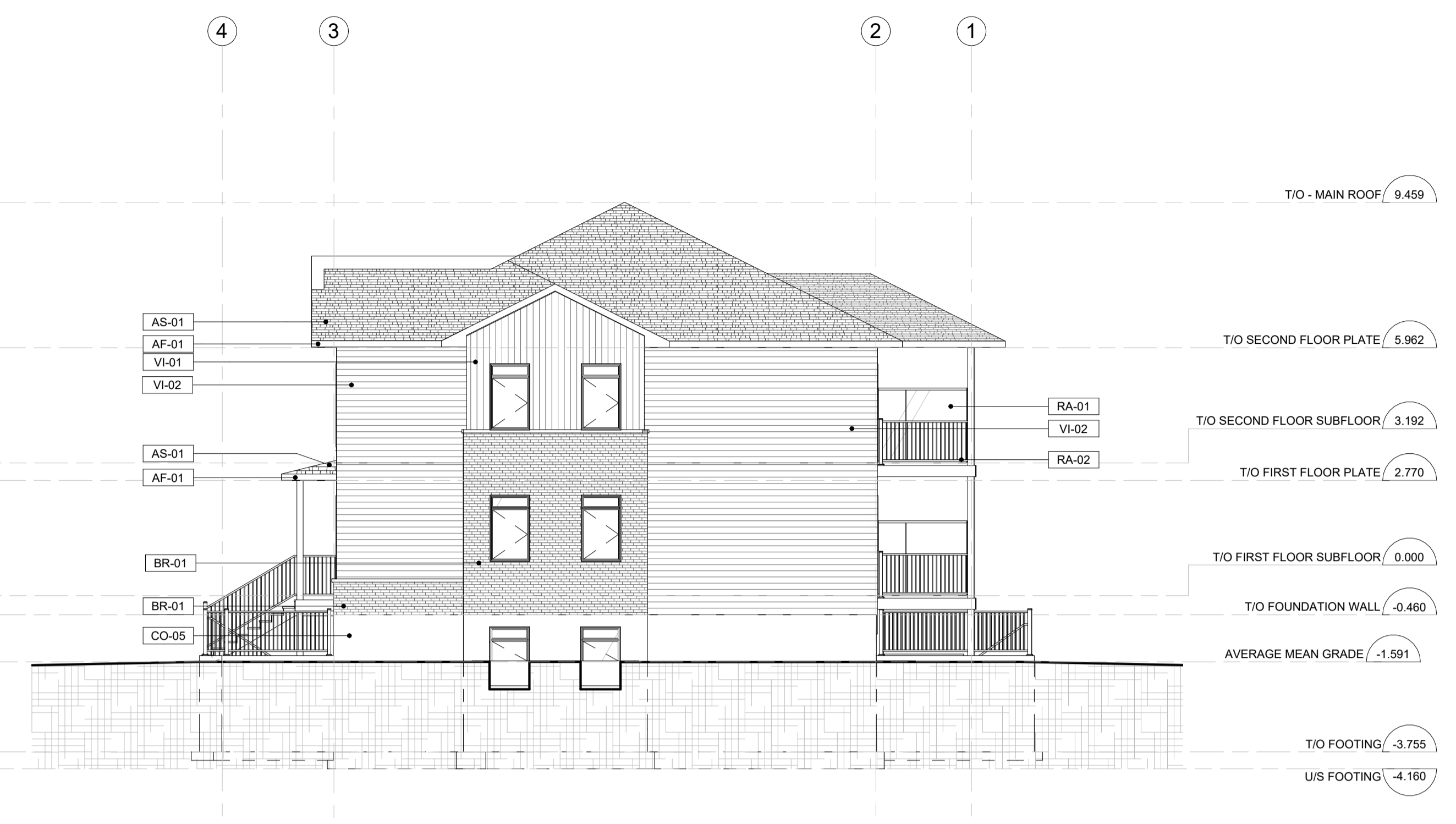
2 RIGHT ELEVATION A202 1:100