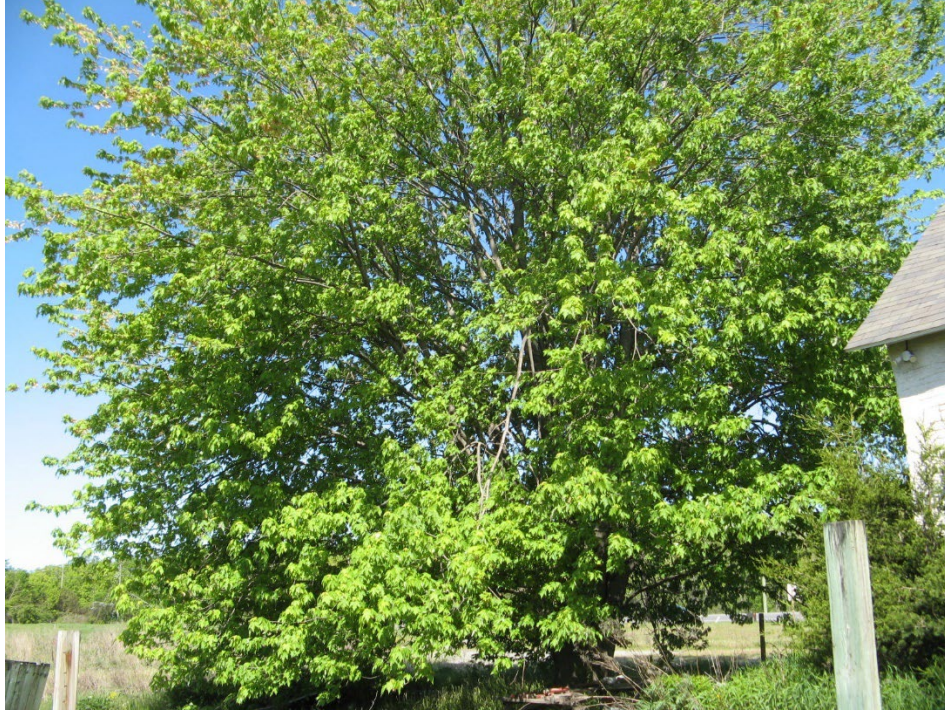
Photo 3 – Red maple, Tree ‘A’ on Map 1, to the east of Moodie Drive. View looking north. Tree now removed