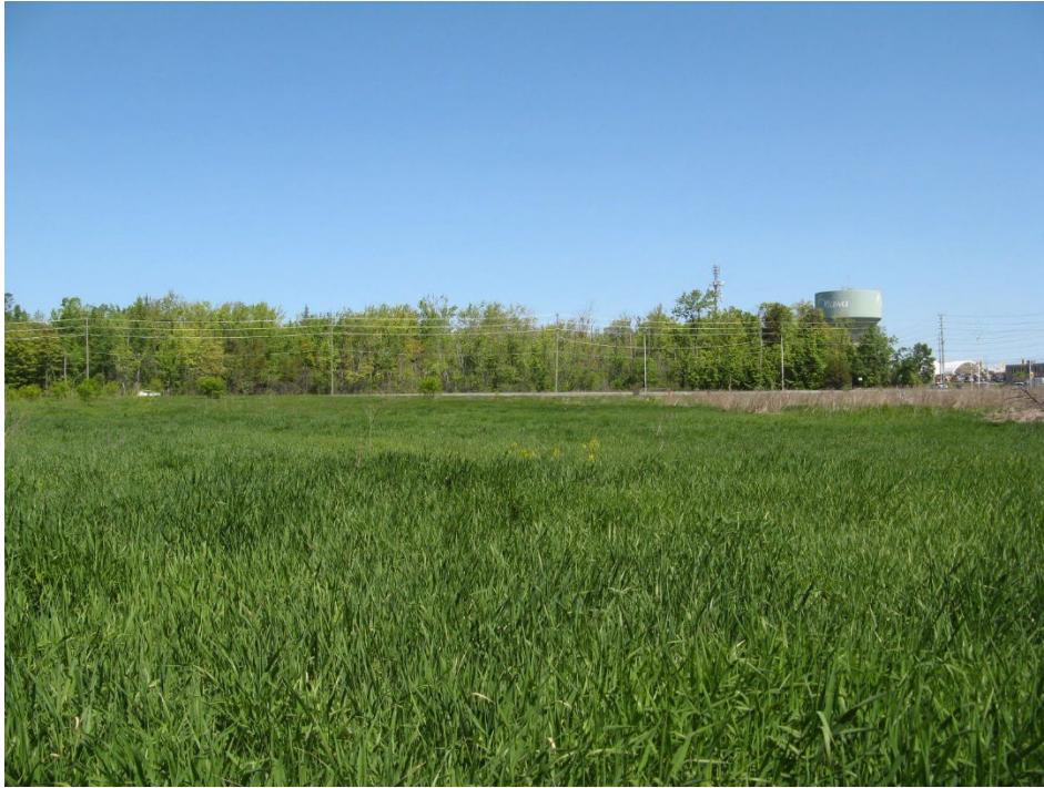
Photo 1 – Site looking north from the south-central edge. Note Monahan Forest in the background, on the north side of Fallowfield Road