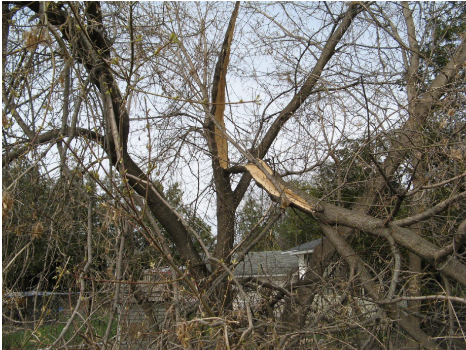
Photo 4 – Extensive damage on the Manitoba maples, Trees ‘C’ on Map 1, along the northwest site boundary. View looking northwest. Tree now removed