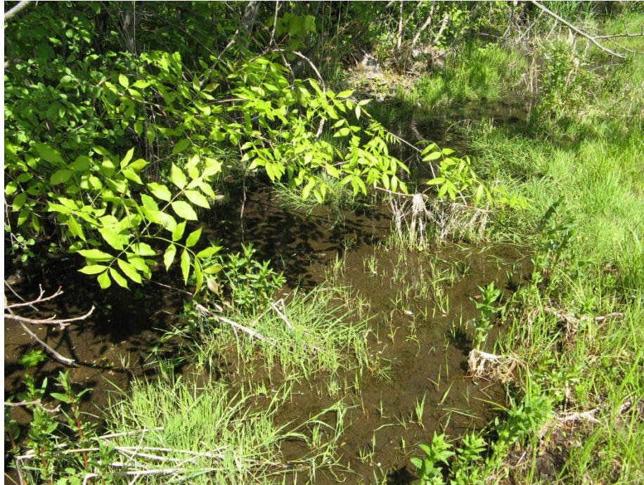
Photo 11 – A wider section of standing water up to 2cm deep in the ditch on May 25 th , 2023. View looking north