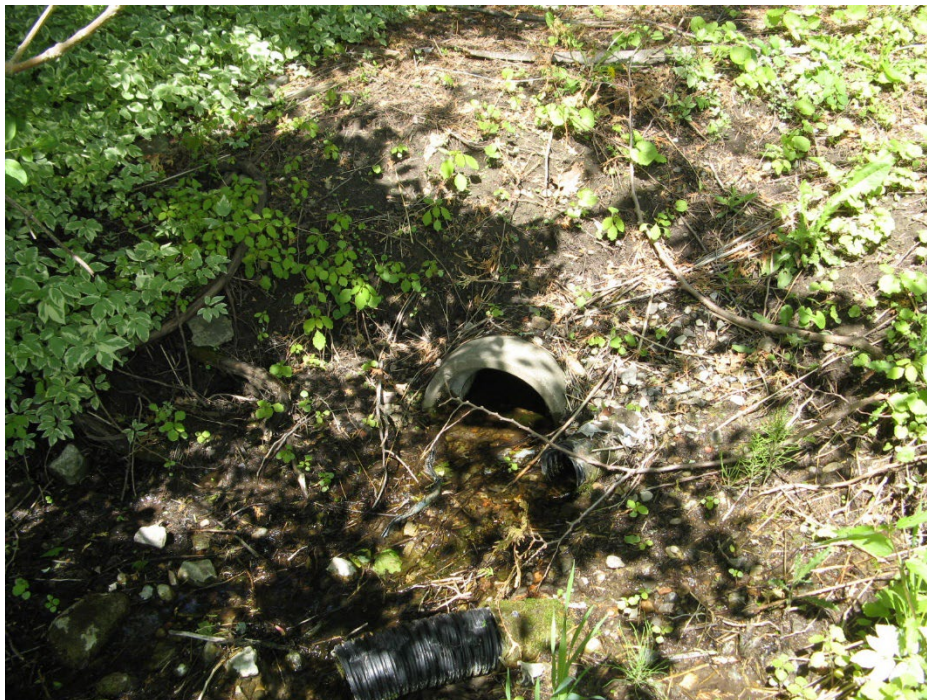
Photo 10 – Culvert and drain outlets entering the ditch along the west property line. View looking northeast