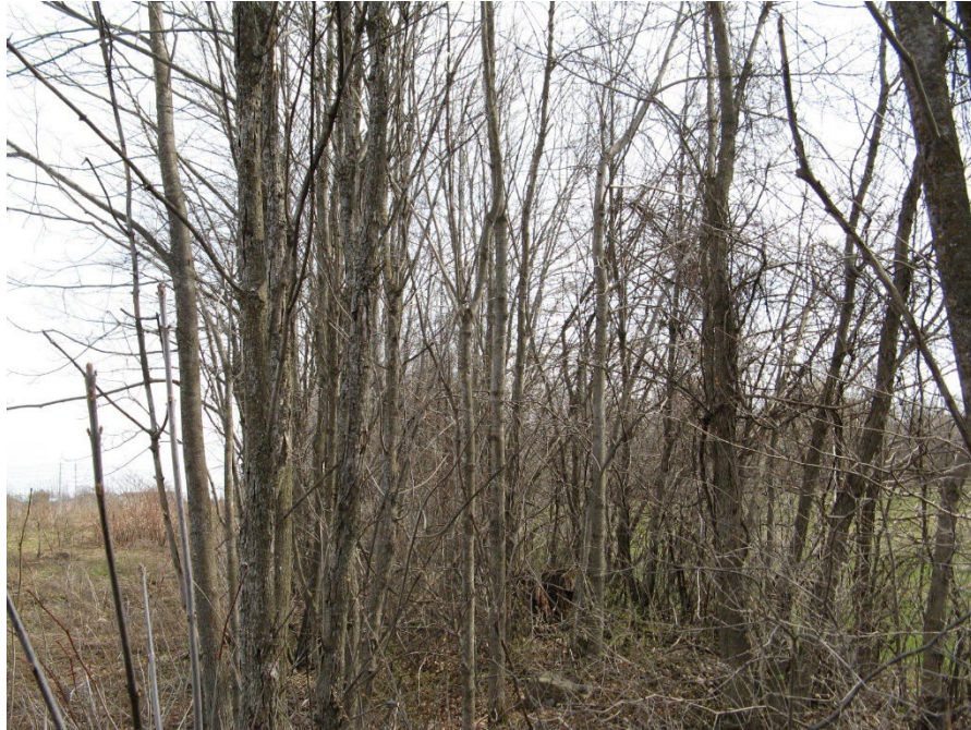
Photo 7 – Deciduous hedgerow, Trees ‘H’ on Map 1, immediately to the north of the south property line. View looking east