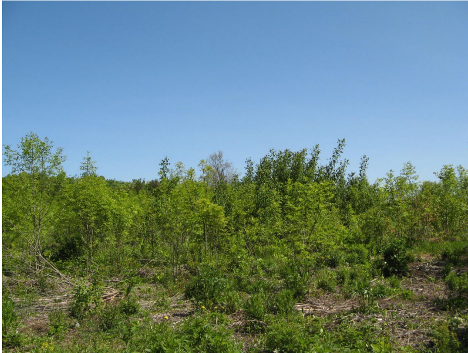
Photo 2 – Cultural thicket in the west portion of the site. View looking northeast.