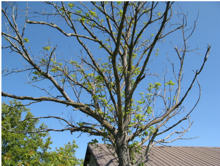
Photo 6 – Black walnut, Tree ‘F’ on Map 1, along the northwest portion of the property line. View looking northeast. Tree now removed