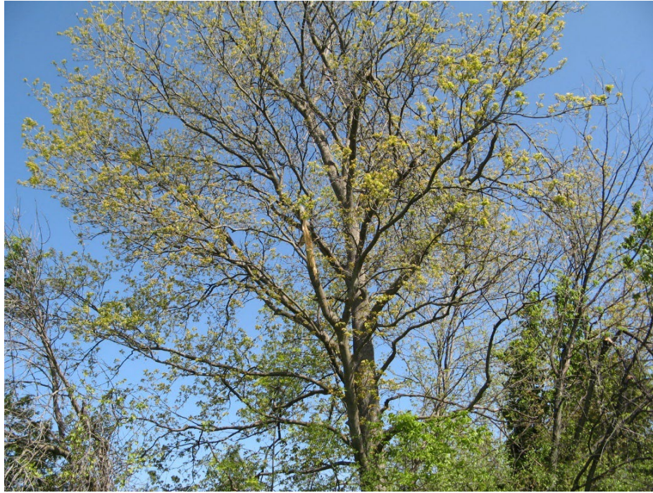
Photo 5 – Mature Manitoba maple, Tree ‘E’ on Map 1, immediately north of the northwest portion of the site. View looking north. Tree now removed