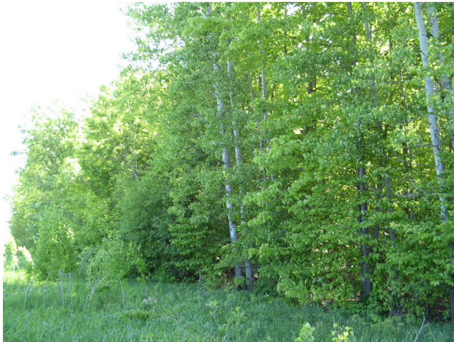
Photo 8 – North edge of young deciduous forest (Trees ‘I’ on Map 1), which is along the east portion of the south property line. View looking southeast