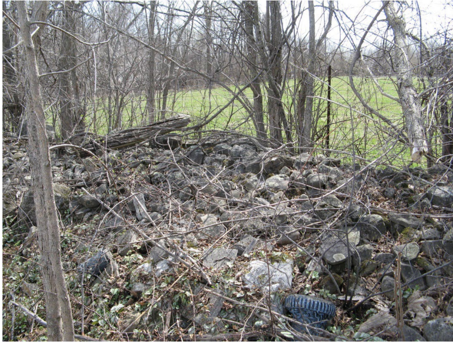
Photo 9 – Stone piles immediately north of the west portion of the south property line. View looking southeast