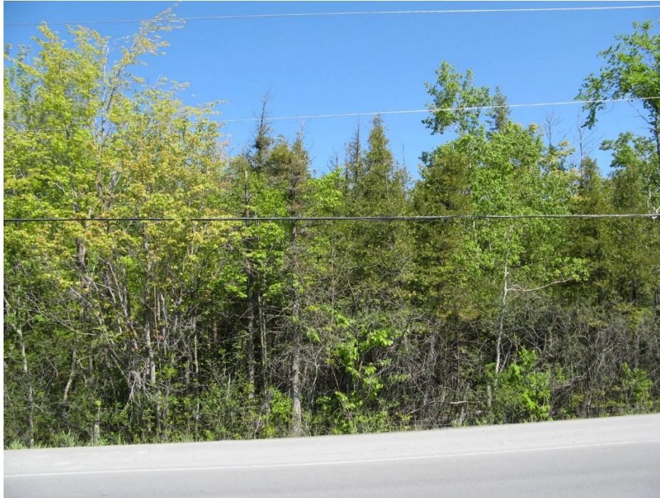
Photo 13 – Monahan Forest to the north of the site, north of Fallowfield Road. View looking north