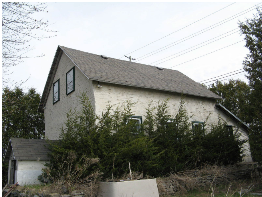
Photo 12 –Residence, now removed, on the east side of Moodie Drive. View looking northeast