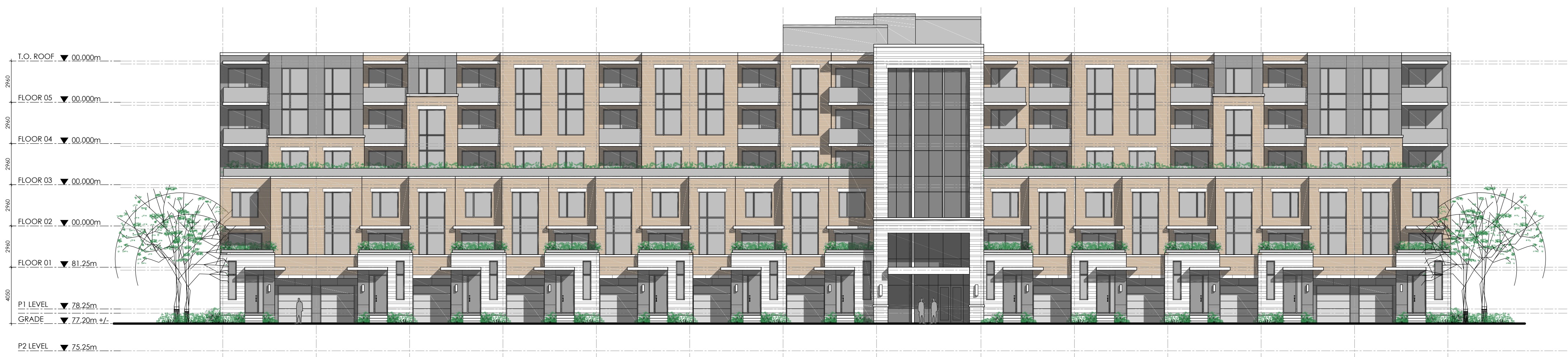
2 BLOCK 6 ELEVATION A1 (BLOCK 7 SIMILAR) SCALE: 1:200