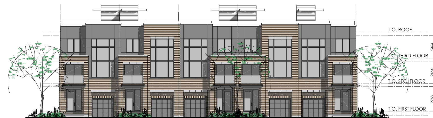
5 TYPICAL TOWNHOME BLOCK ELEVATION A1 SCALE: 1:200