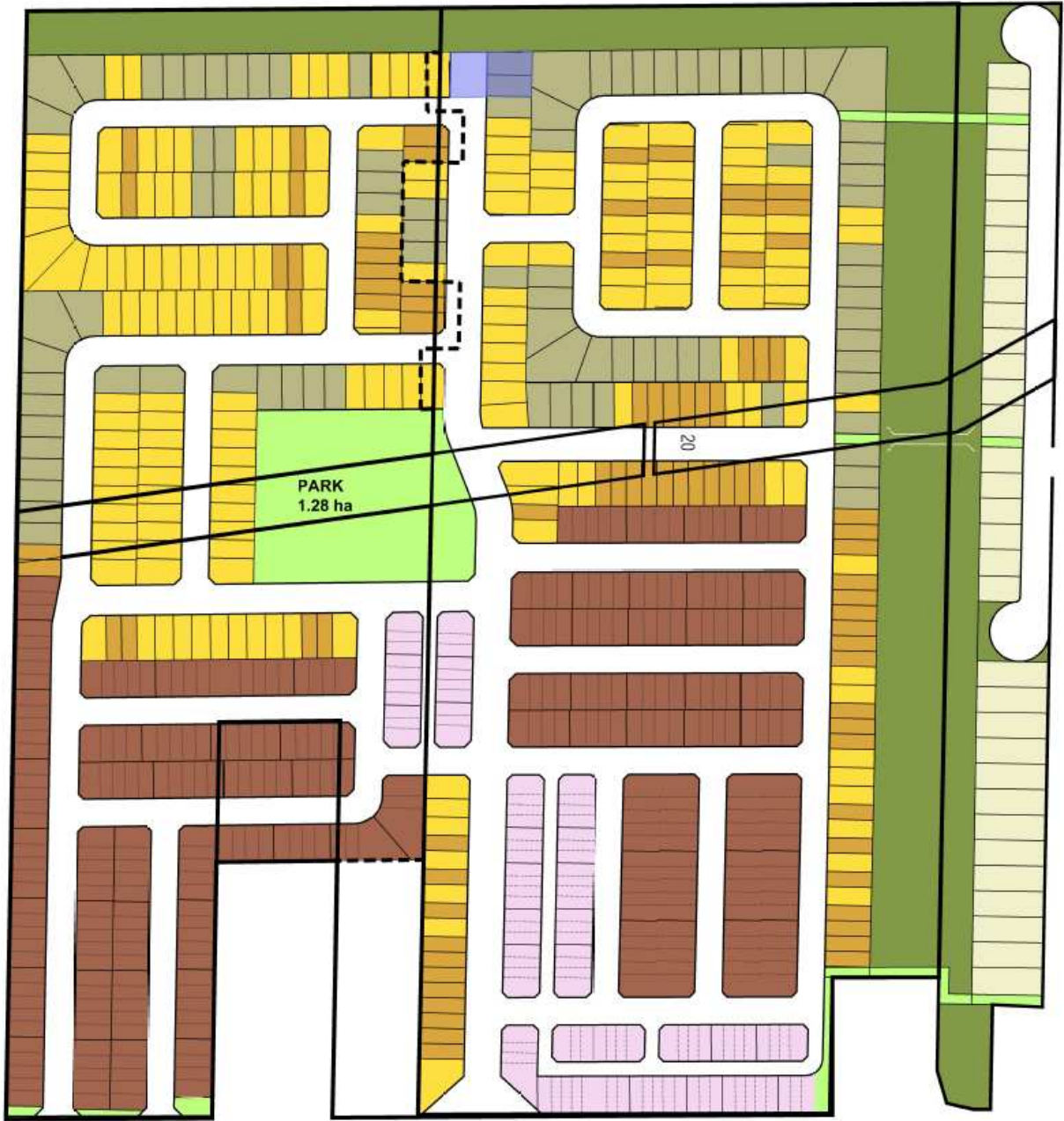
Figure 1: Revised Concept Plan for Green Lands and Fox Run North.