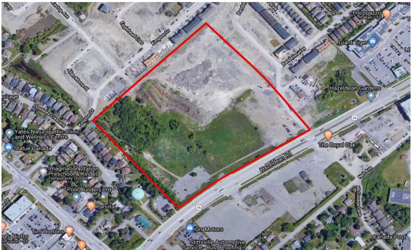
Figure 1-1 - Site Location

The site is located within 100m of transportation two noise sources. The source is Hazeldean Road, which classified as a 4-Lane Urban Arterial-Divided (4-UAD) roadway, and the second source is Kimpton Dr, which is a 2-Lane Urban Collector (2-UCU). Therefore, a noise impact assessment due to traffic is required.