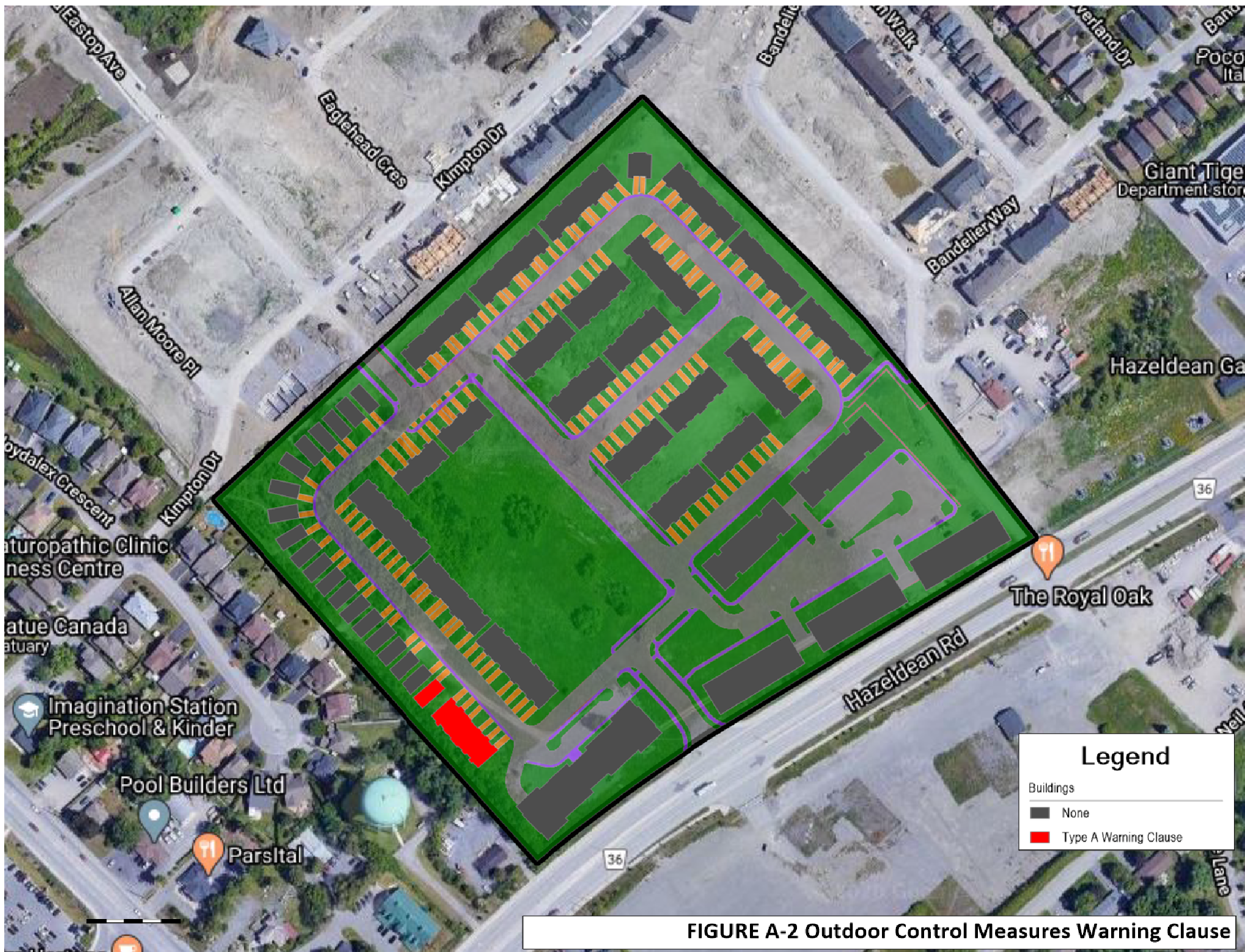
FIGURE A-2 Outdoor Control Measures Warning Clause